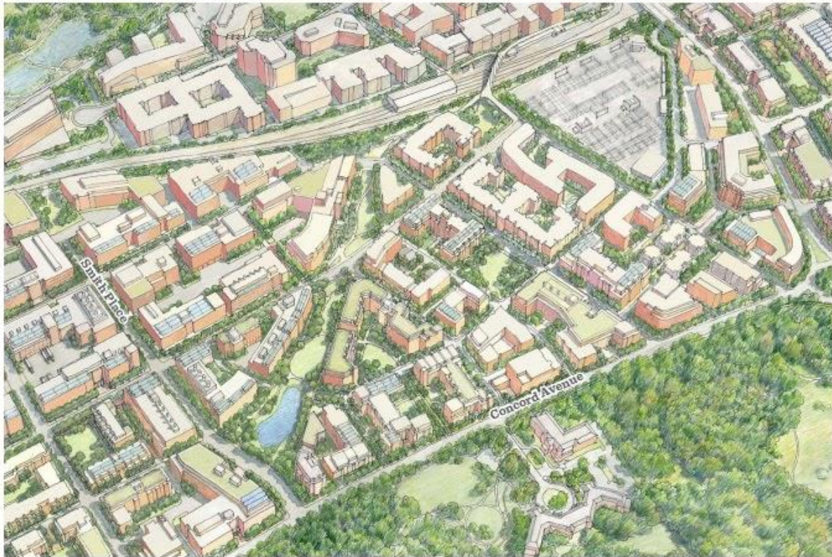
The conceptual illustration shows the proposed green linear open space in the Quadrangle, stretching from the proposed pedestrian/bicycle bridge to Fresh Pond. This open space link will benefit connectivity, stormwater mitigation, and overall quality of life.