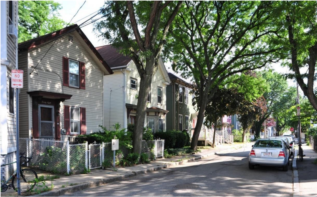
Even side of Union Street, looking south. #28 is at the far left. CHC photograph, July 2020

The zoning allowances of the C-1 zone, the presence of additional development potential on the site, and Cambridge's robust housing market will continue to put pressure on the property to be developed as fully as possible.