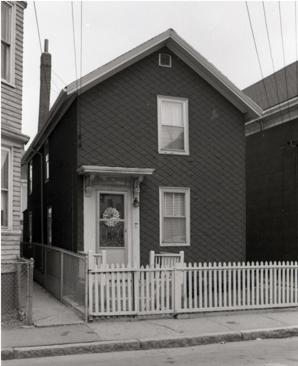
CHC survey photo of 28 Union St. Winter 1966-67.

The previous owner undertook some major interior work during her occupancy of the house including re-framing the roof and raising the ceilings upstairs. She also removed the horse-hair plaster from the walls, reinforced the framing where needed, and insulated with fiberglass batting. The original wood windows were repaired, and their sash cords replaced with chains. Her letter to the Commission details other features such as wallpaper and framing members.