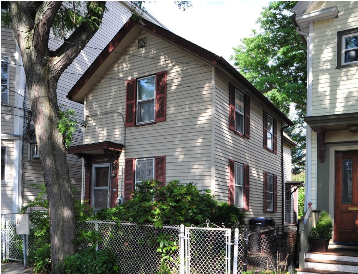
28 Union Street, west front and south side elevations.

The house is a modest example of the Italianate style of architecture in Cambridge. The 1 \frac{3}{4} - story house has a gable roof, oriented with its gable-end to the street. The pitch of the roof is not steep, and the second-floor windows are positioned very close to the eaves on the side elevation. The façade of the house is just two bays wide with the entrance at the far-left side and the first and second floor windows centered under the gable. Four symmetrically placed 2-over-2 double-hung wood sash windows light the south elevation of the front part of the house. The front door is covered with a small flat roof supported by two ornamental brackets. A 1 \frac{1}{2} -story ell extends on the east end of the house. A tall chimney is located on the north side of the house. The house is organized in a side-hall plan, with a staircase just inside the front door and a front parlor to the right.