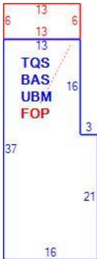
Assessor's measured footprint of 28 Union Street. Accessed May 1, 2021.

The gross floor area of the house is 1,710 square feet. This total includes the original front part of the house (16' x 21'), the ell (13' x 16'), a rear attached shed (13' x 6'), and the basement. The actual living area is only 952 square feet. The house is approximately 22' tall.