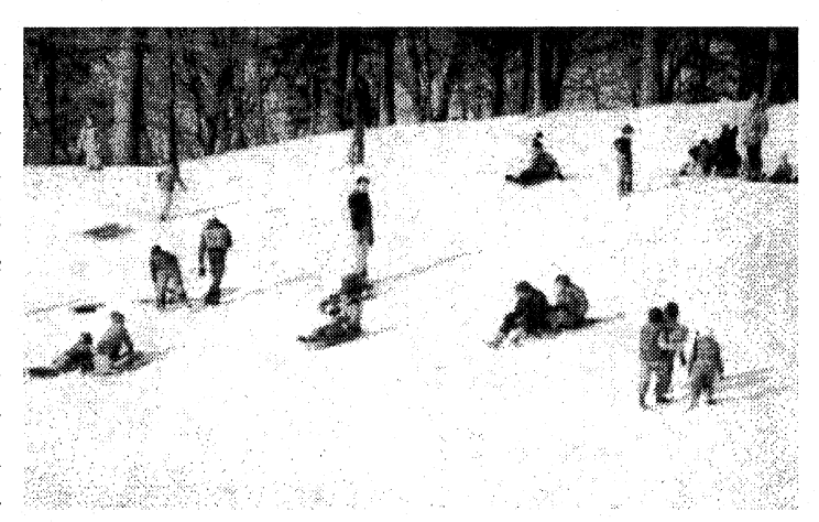
Figure 21: Sledding at Fresh Pond Reservation Photo by Janice Snow, 1978

Within the Reservation's boundaries are two active recreation areas, the Municipal Golf Course, managed, maintained and supervised by the Recreation Division, and