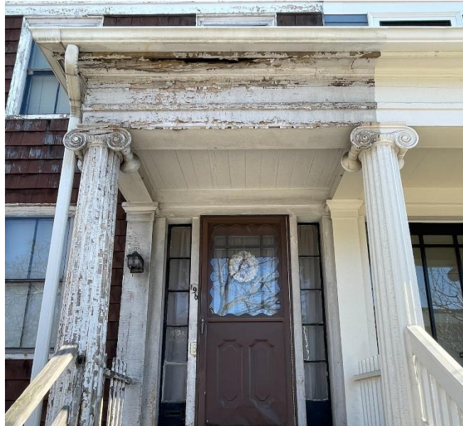
196 Prospect Street, entry detail.

In 1899 Louis Baldwin extended the ell with an 18' long one-story addition that probably became the kitchen. The Baldwins also added the three-sided bay window with a stained-glass "piano window" in 1900. These are the only alterations associated with Maria Baldwin's use of the home and may have been designed to facilitate the meetings and study sessions she held with activists and students. Later additions include a side porch from 1930 now enclosed with fanlight transoms above casement windows and a small extension for a bathroom. These are not considered