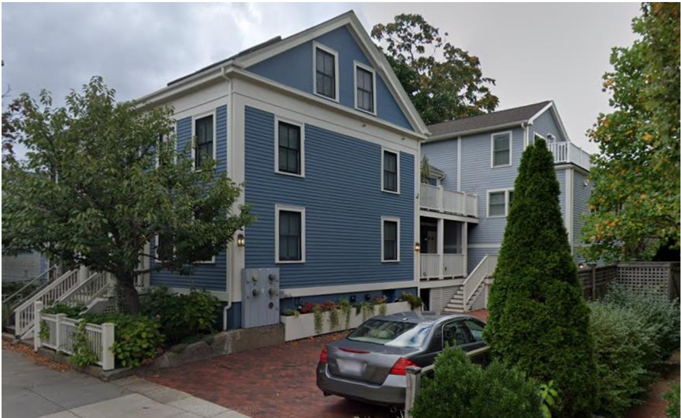
194 Prospect Street