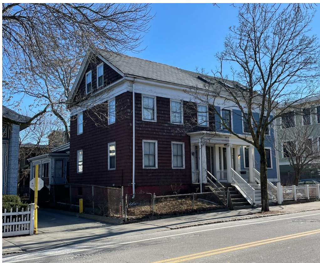
194 (right) and 196 (left) Prospect Street, January 2022.