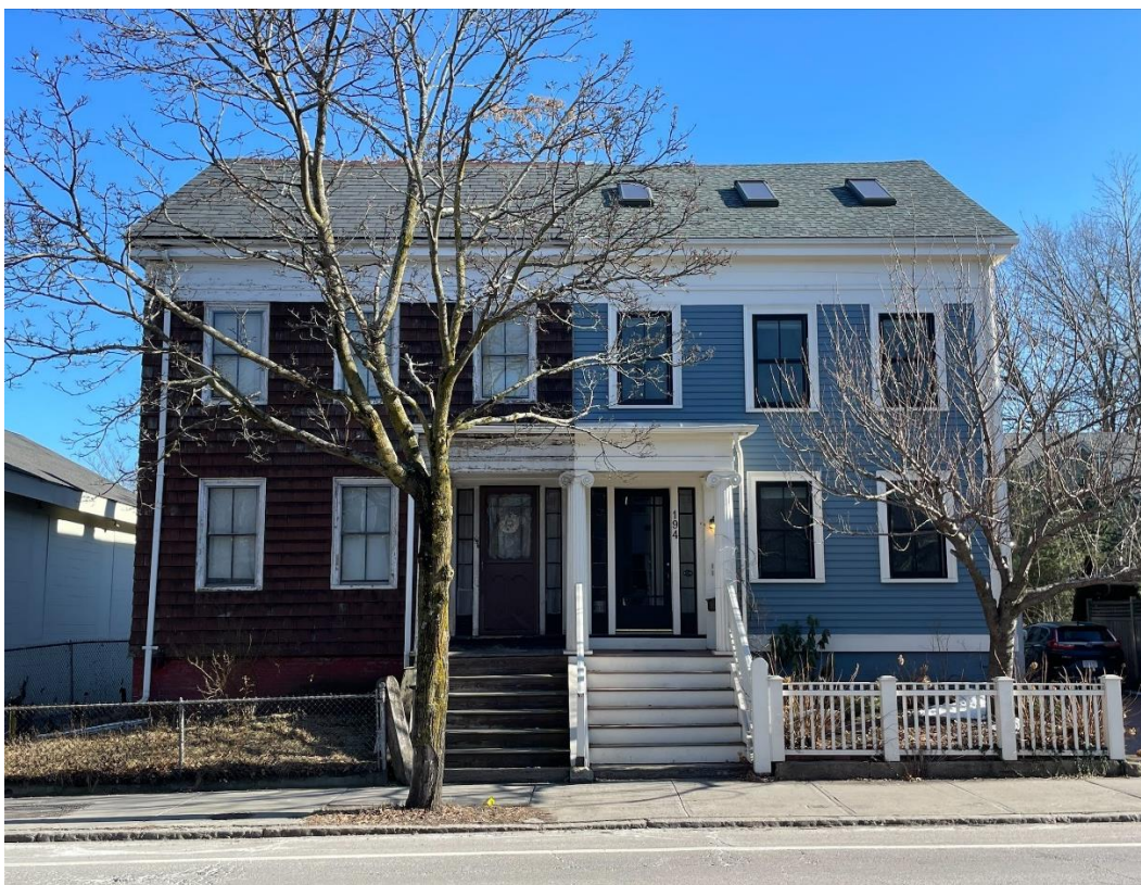
194 (right) and 196 (left) Prospect Street, January 2022.