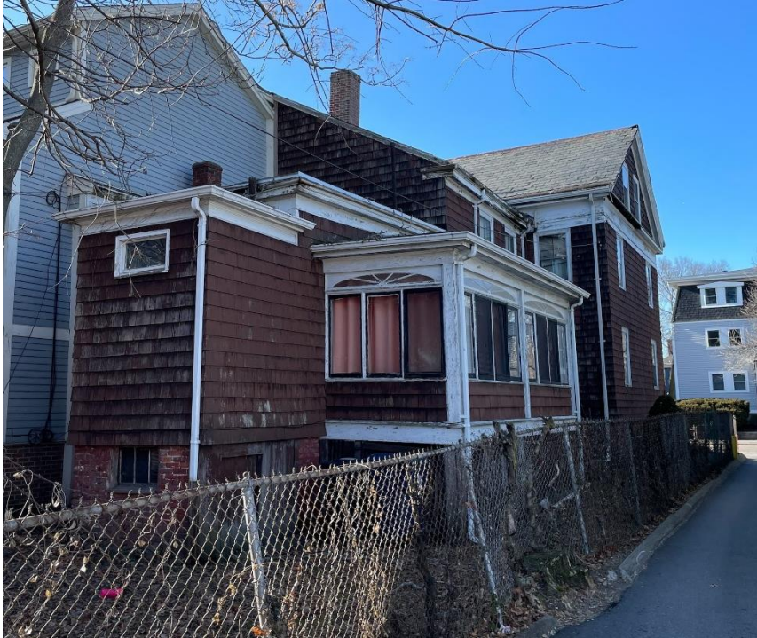
View of 1899 one-story Lewis F. Baldwin addition and bathroom and enclosed porch added by a later owner, facing Prospect Street.

While the front portion of 194 Prospect was restored to its original appearance in 2009, 196 still bears the wood shingles that were applied over its original clapboards in the 1930s. The Baldwin house suffers somewhat from deferred maintenance but is largely in recoverable condition. Both houses should be brought to the same level of repair and appearance and maintained so as to present a consistent appearance.