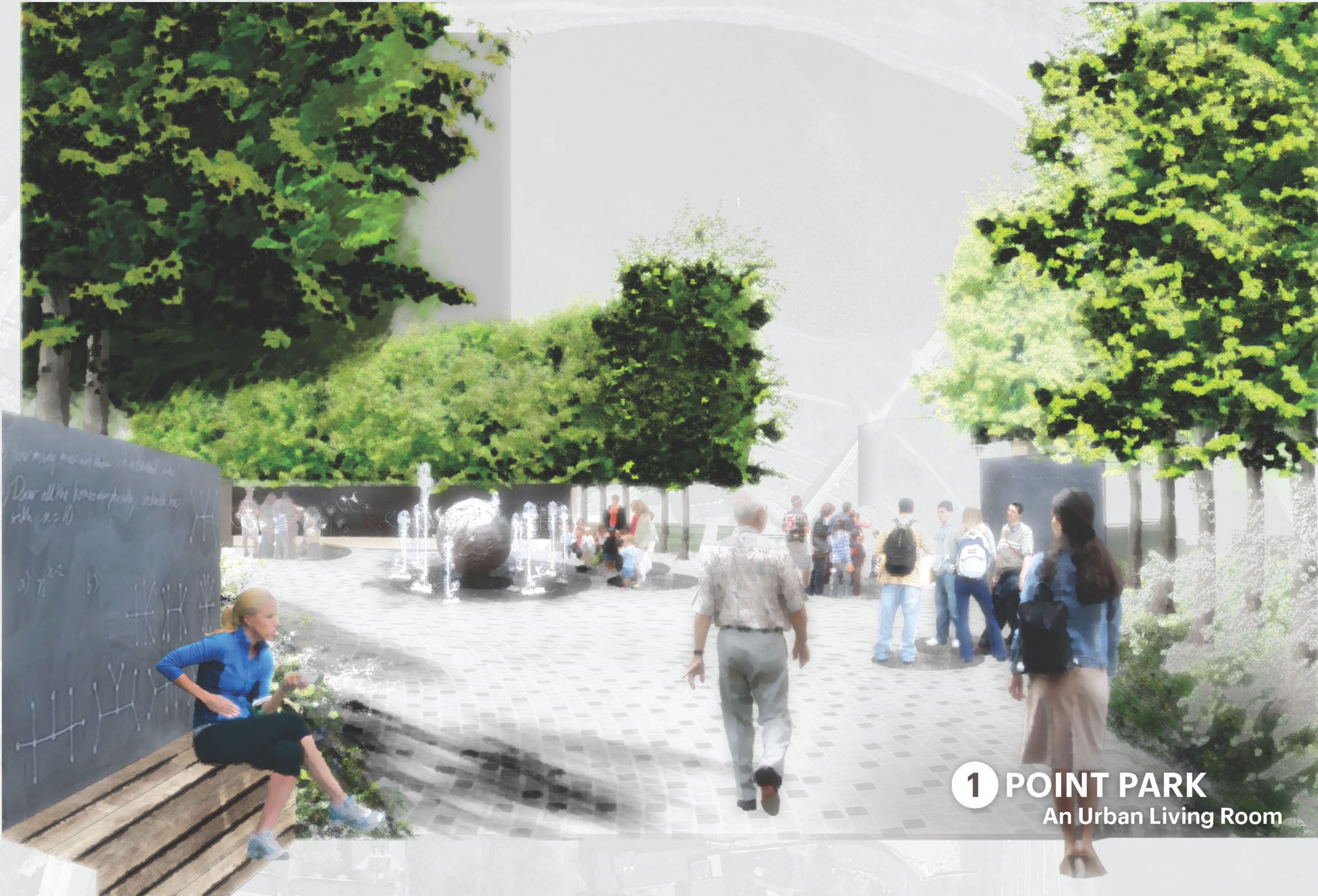
1 POINT PARK An Urban Living Room