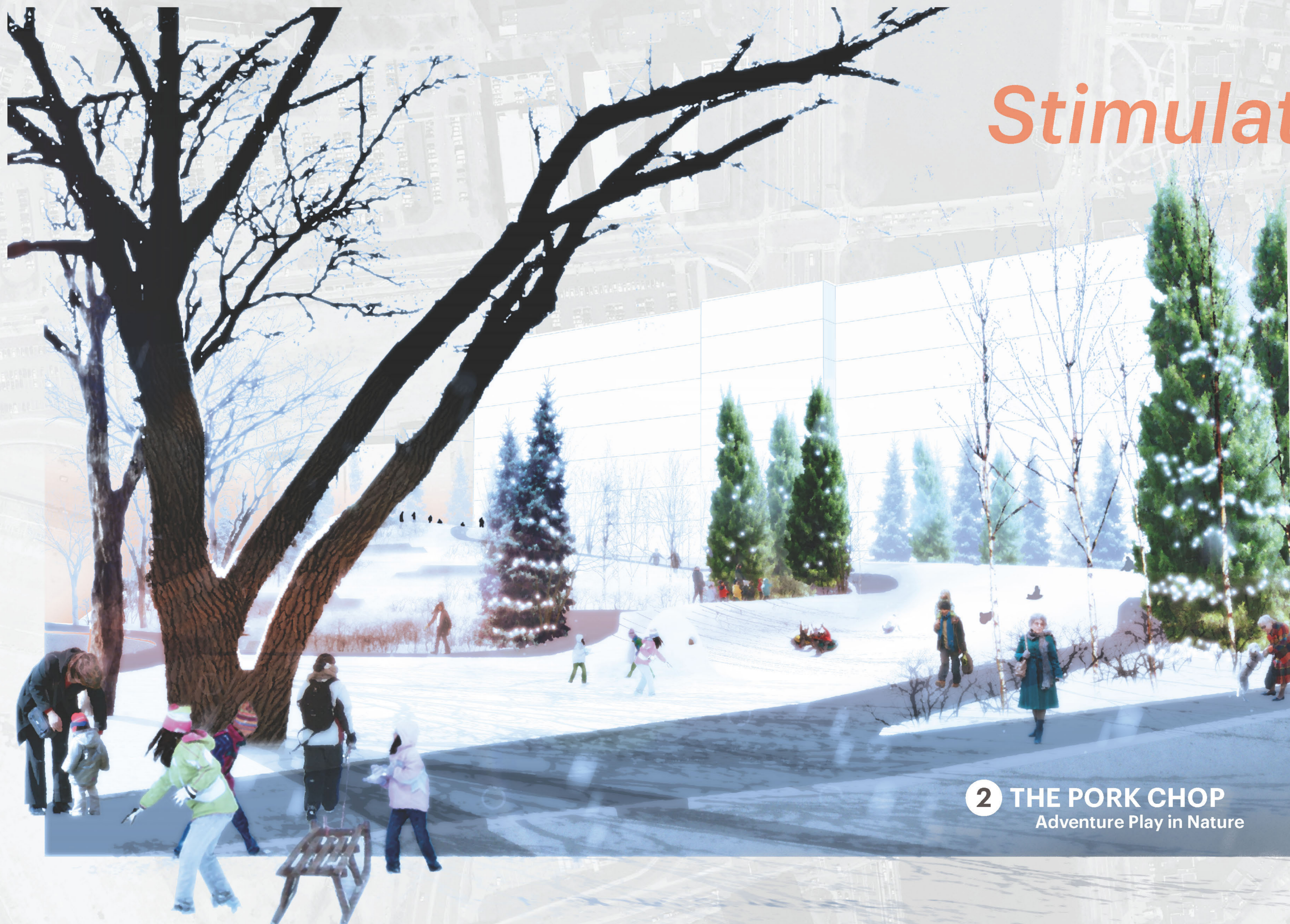
2 THE PORK CHOP Adventure Play in Nature