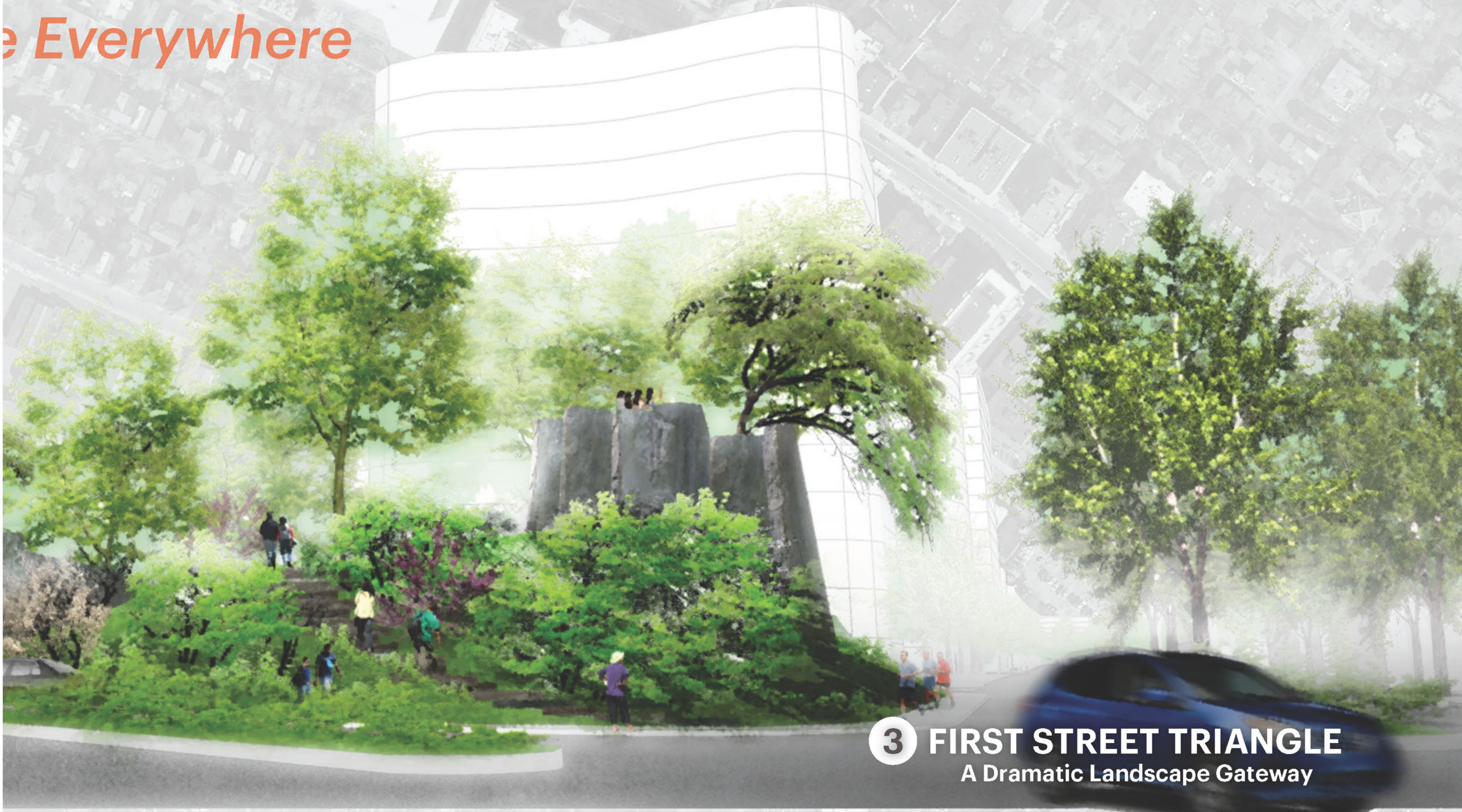
3 FIRST STREET TRIANGLE A Dramatic Landscape Gateway