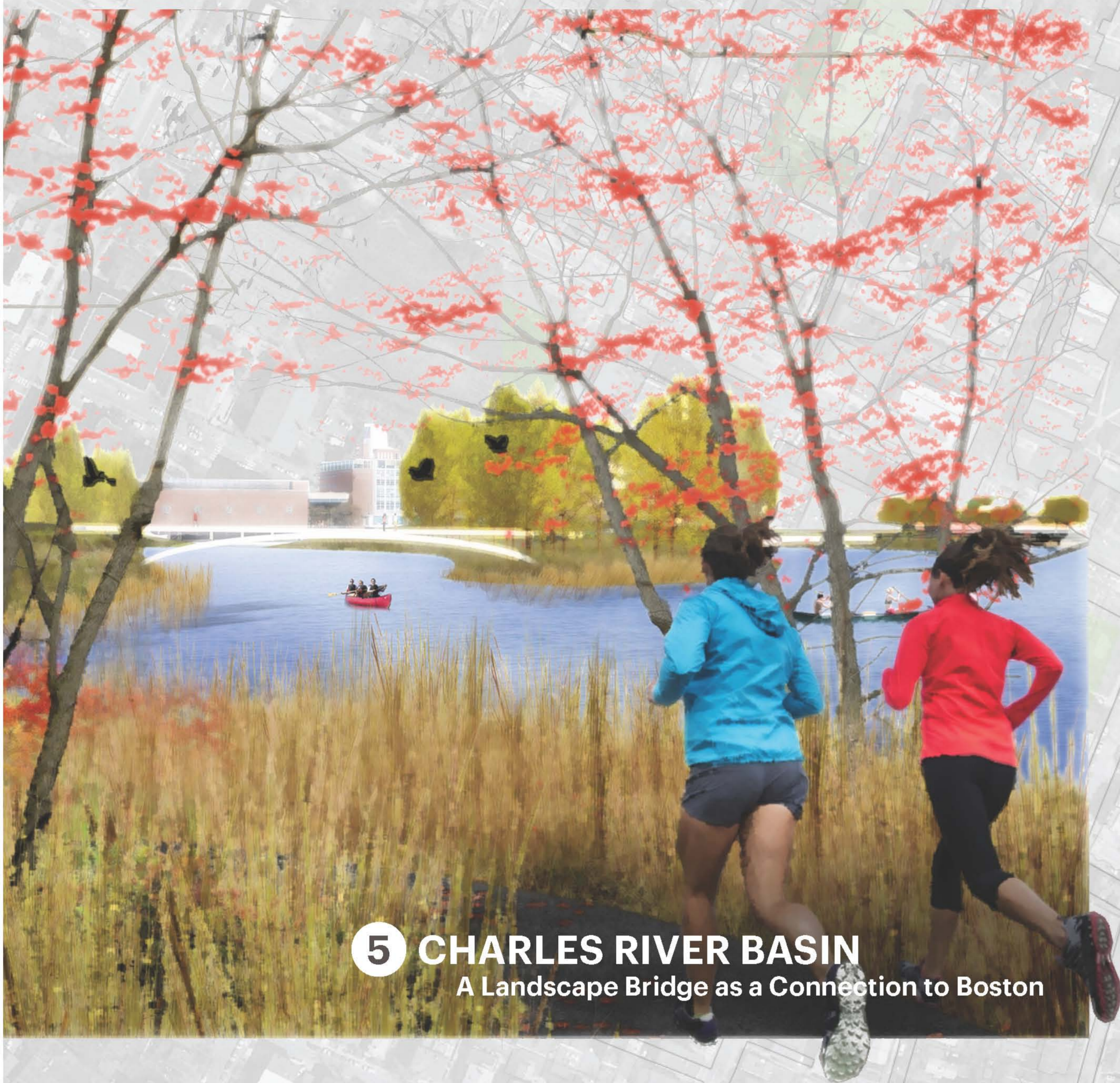
5 CHARLES RIVER BASIN A Landscape Bridge as a Connection to Boston