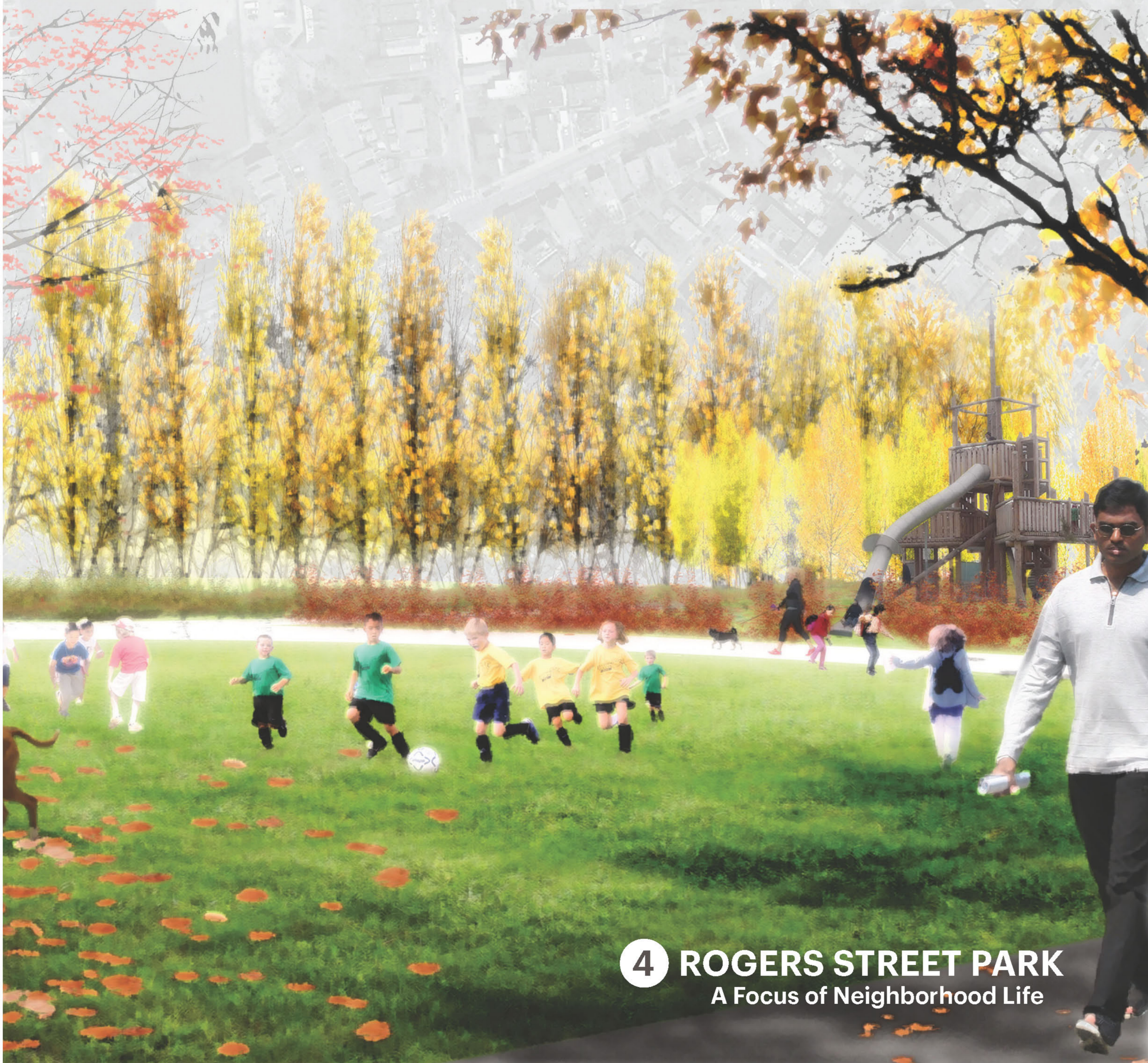
4 ROGERS STREET PARK A Focus of Neighborhood Life