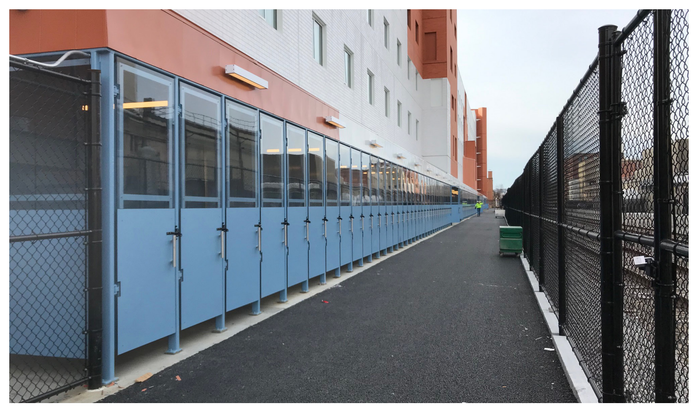
Long-term bicycle parking at an MIT Dormitory.