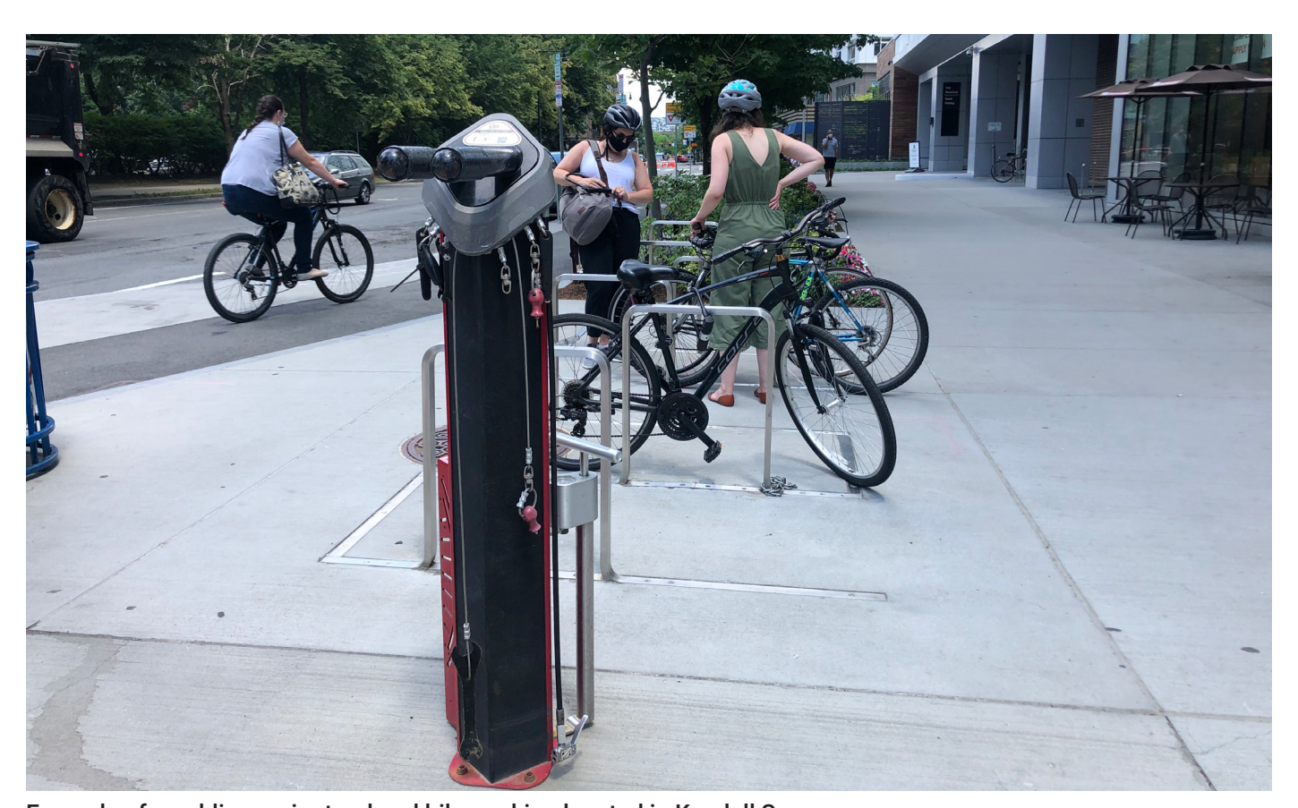
Example of a public repair stand and bike parking located in Kendall Square.