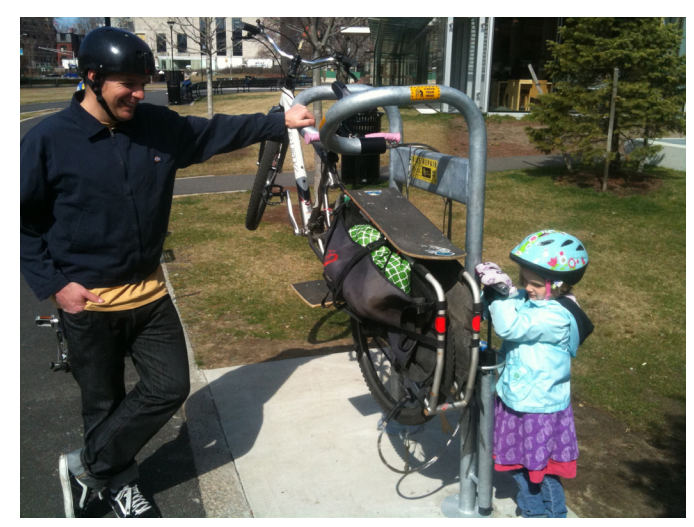
Public bike repair stand in use.

For more information, please visit the <u>Getting</u>. Around Cambridge By Bike webpage.