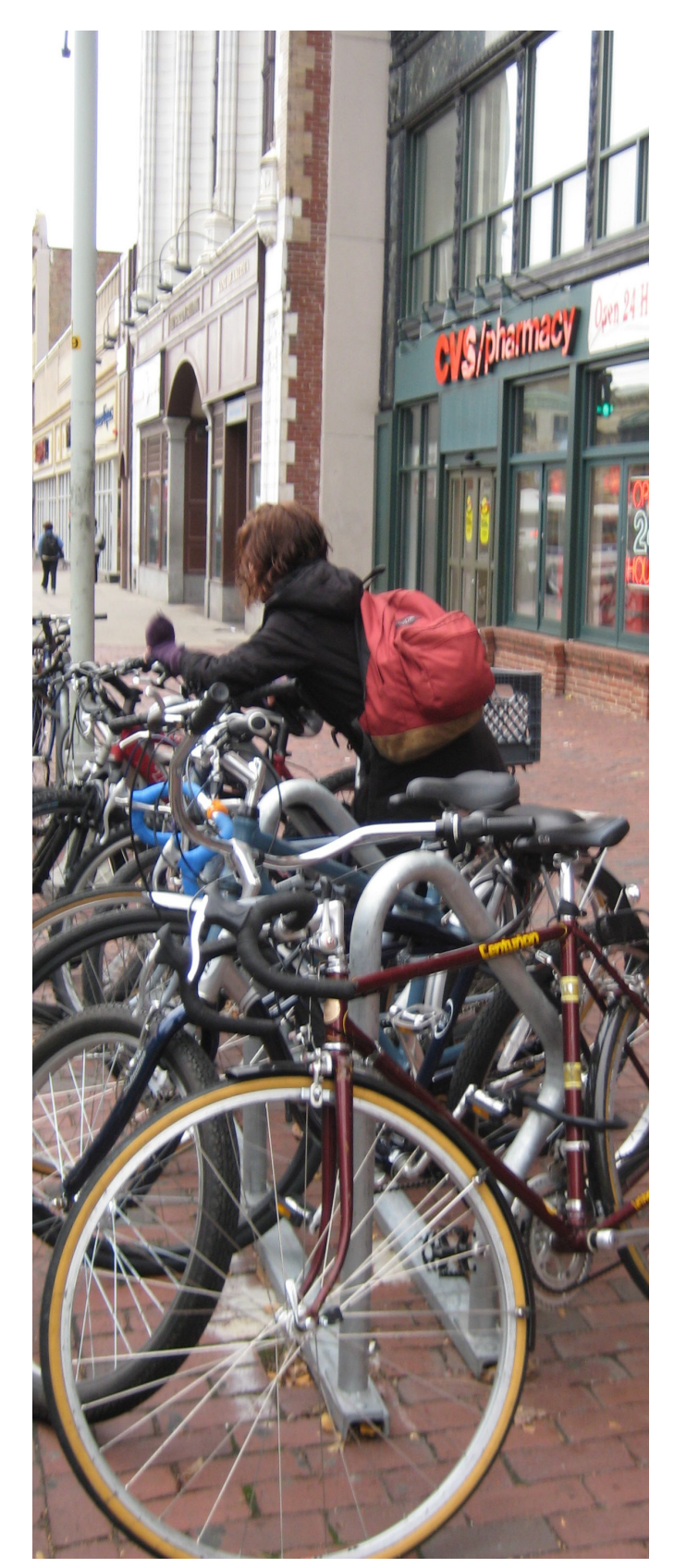
Figure 7.4: The "Swerve" rack on a rail system enables racks to be located where it is not feasible to drill into pavement.