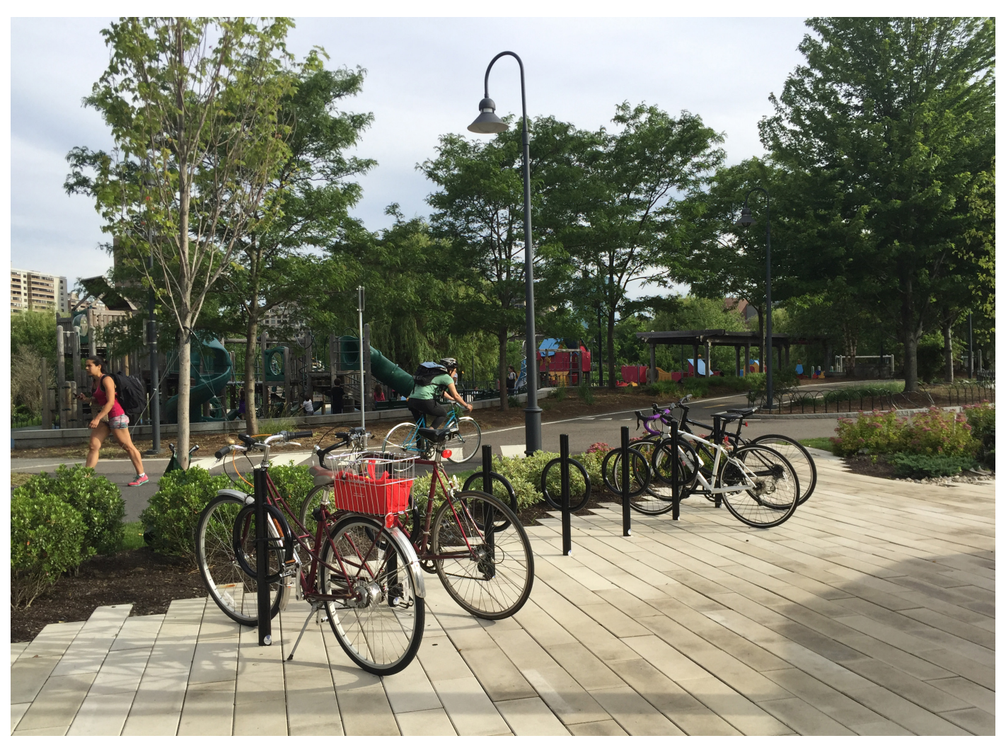
Figure 7.6: "Post and ring" style bicycle parking provided in front of EF Education First Building adjacent to North Point Park.

One of the important ways of maintaining bicycle parking is to remove bicycles locked to racks that have been abandoned. A 72-hour maximum time frame for bicycle parking was instituted for bicycle spaces in designated commercial and retail districts, as these are not intended for long-term storage. This is to ensure that those coming to the districts by bicycle are able to find parking quickly and easily.