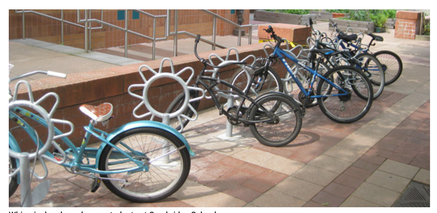
Whimsical racks welcome students at Cambridge Schools.

Acceptable racks, like the "Inverted U," "Swerve," and "Post and Ring" racks, have two-point support and fit a variety of bicycle types. Custom designs and "artistic" racks can also be used, provided they meet the performance criteria for bicycle racks.