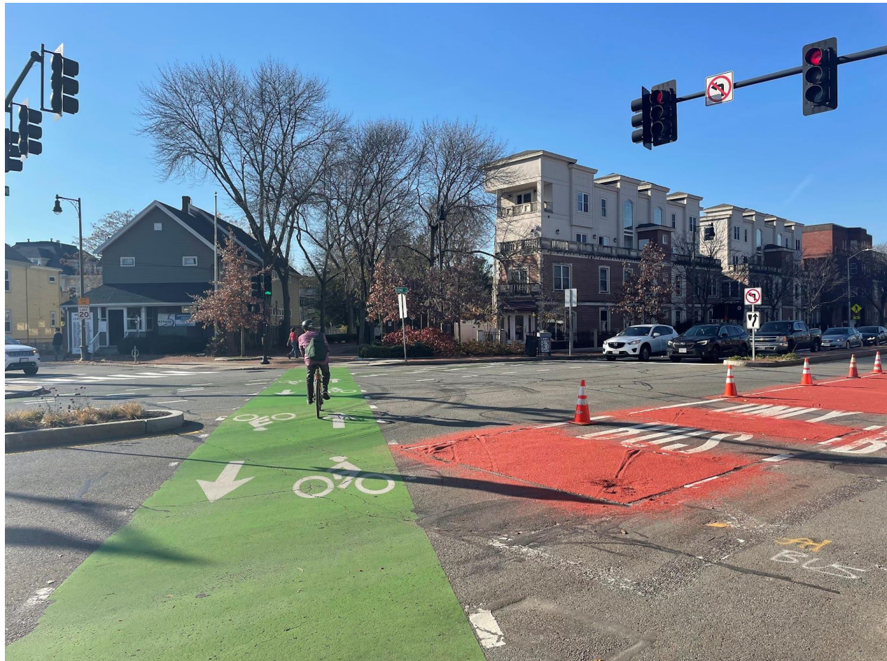
Linear Park path (NB)