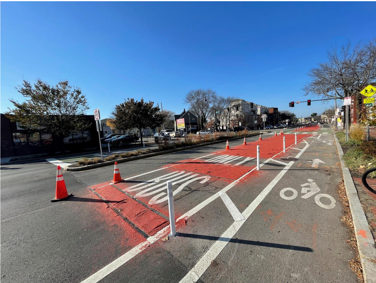
Between Cameron + Cedar (NB)