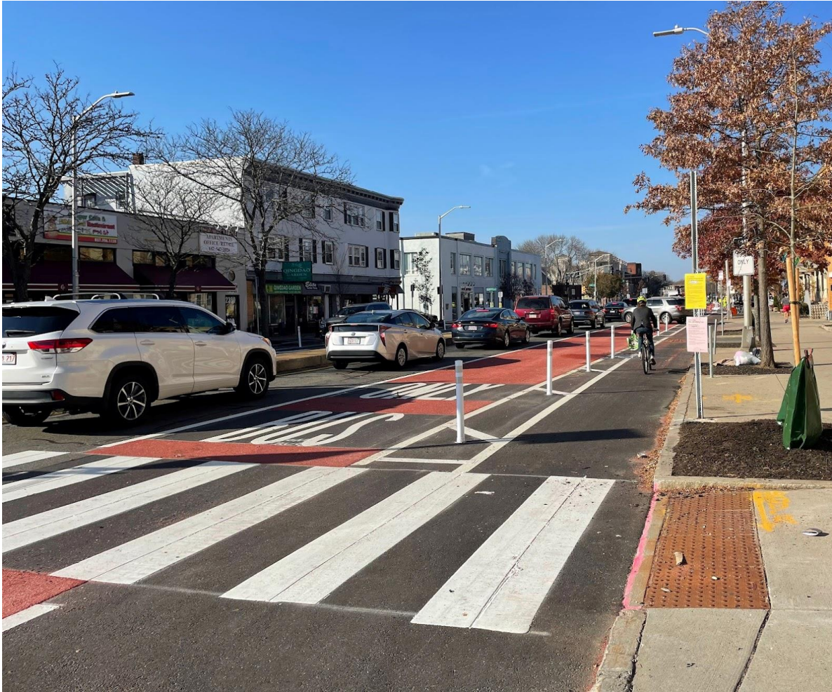
Dudley + Mass Ave (NB)