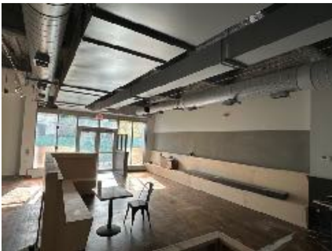
Remodeling work in progress