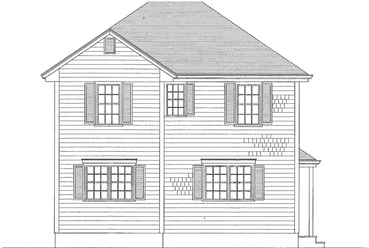
(East) DRIVEWAY SIDE EXTERIOR ELEVATION Scale: 1/4" = 1'-0"