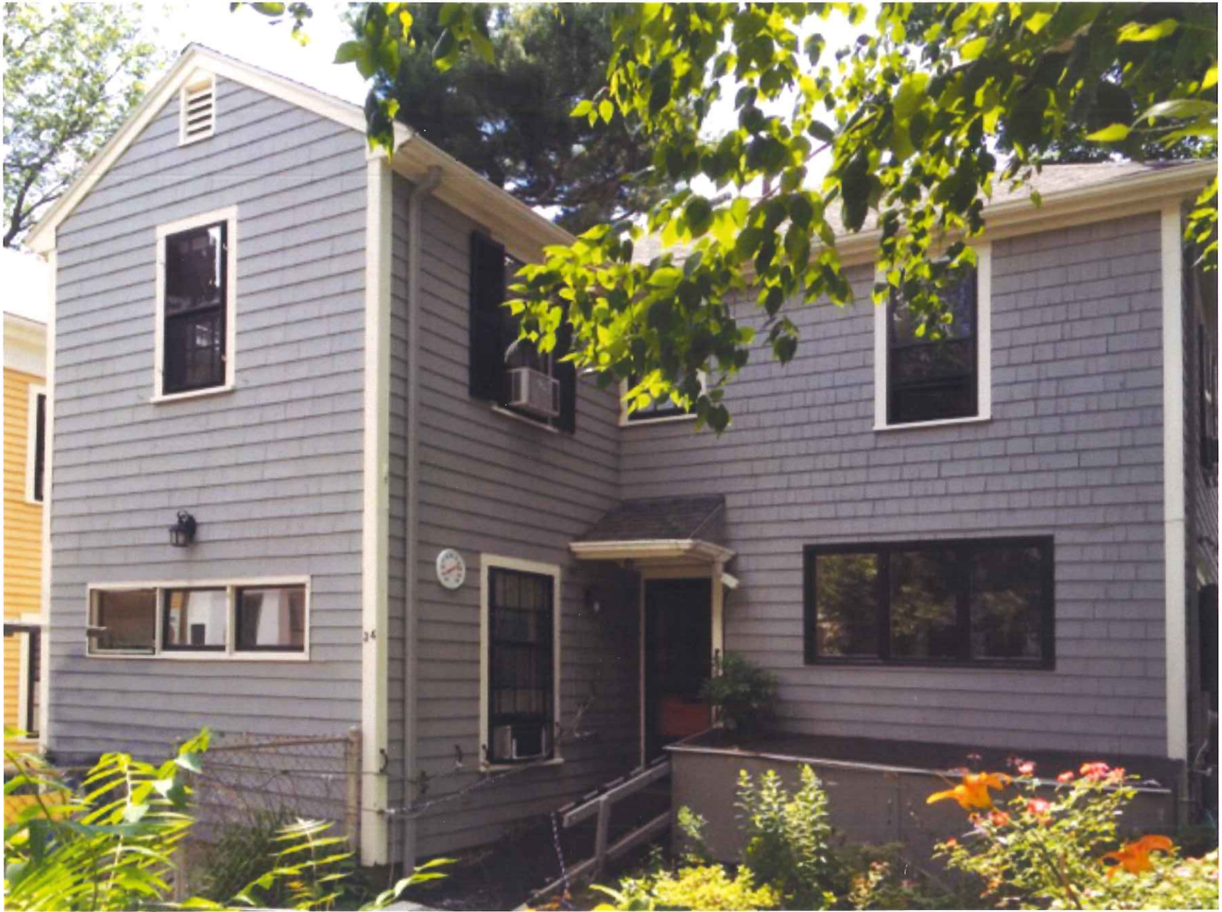
Existing (view from northeast)