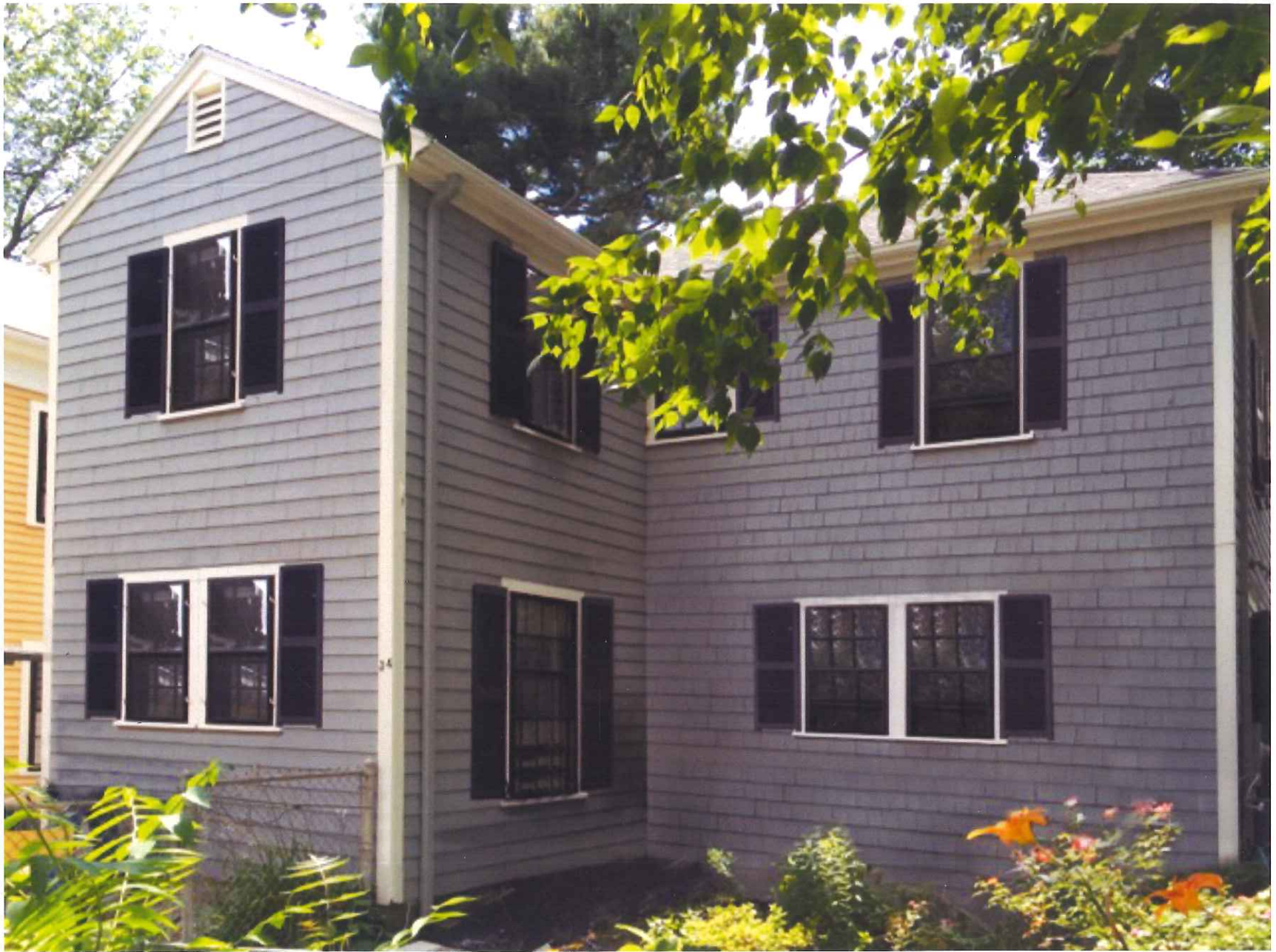
Proposed East / NE