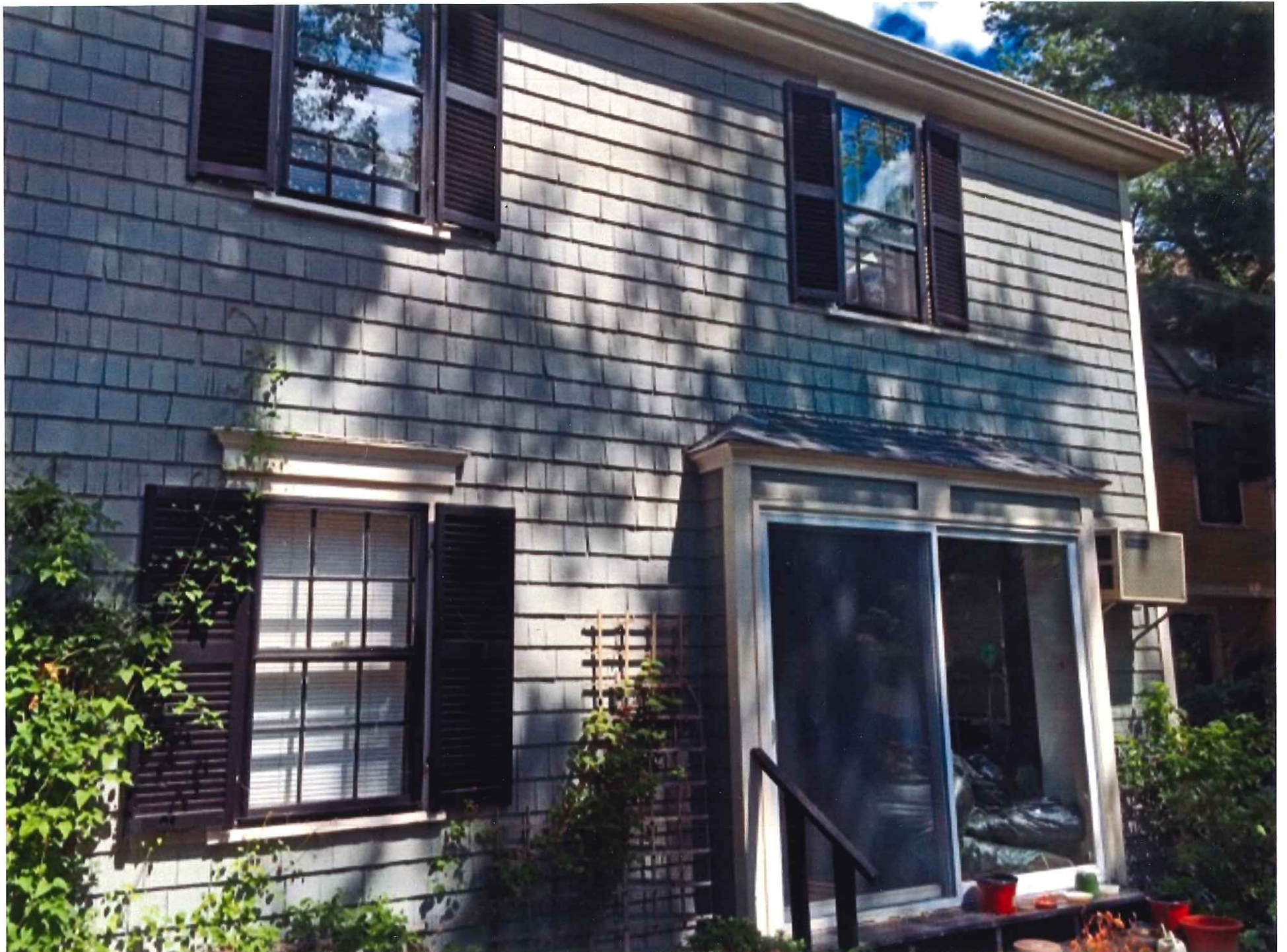
Existing West Elev.