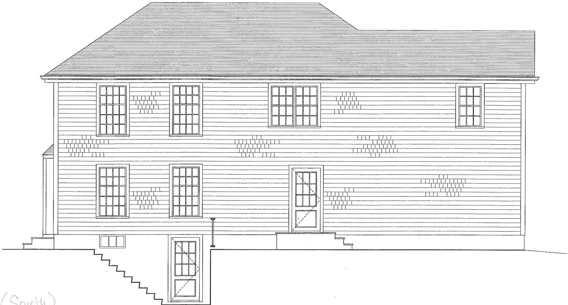
(South) REAR EXTERIOR ELEVATION Scale: 1/4" = 1'-0"