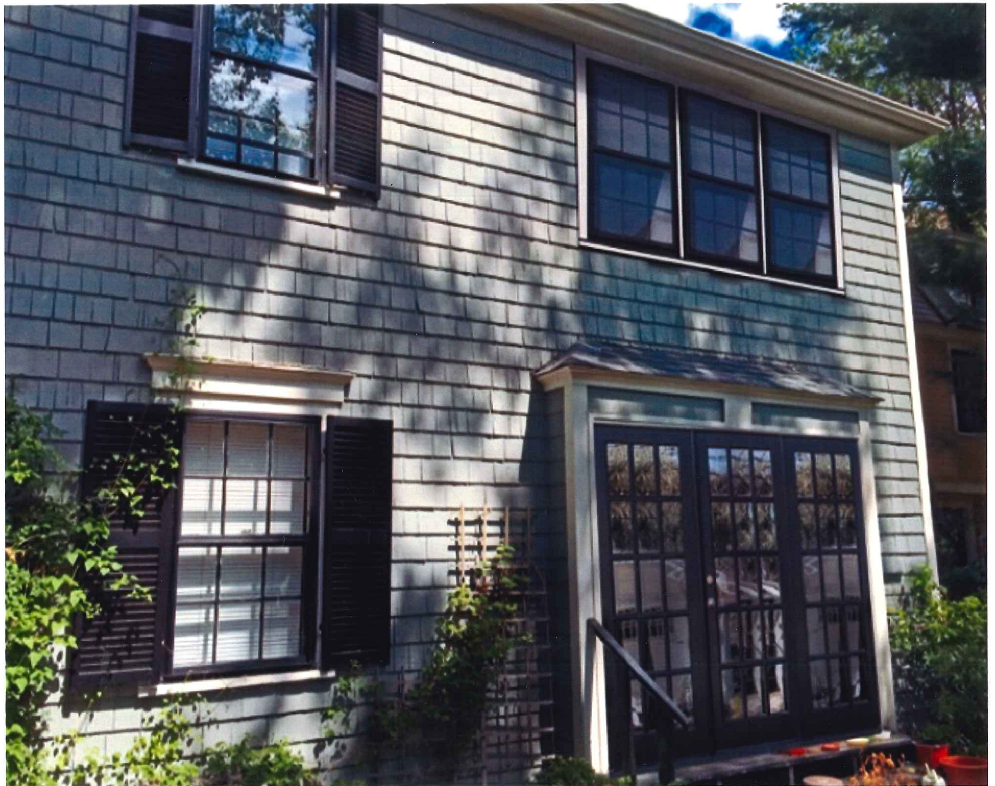
Proposed West Elev.