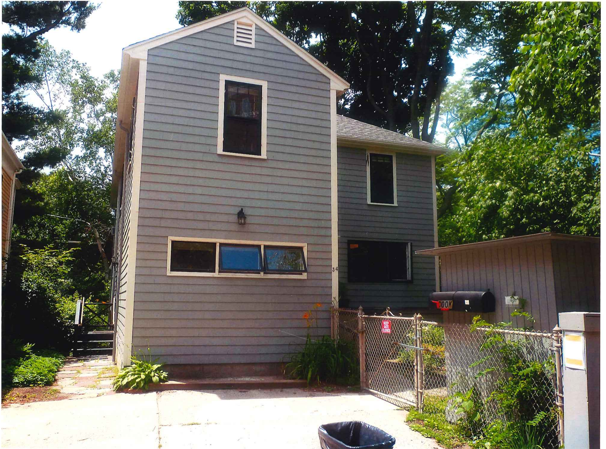
Existing East Elev.