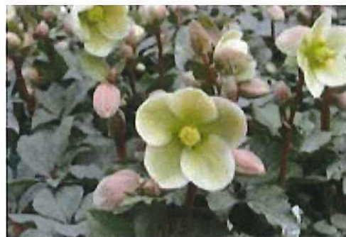
helleborus 'ivory prince' | lenten rose