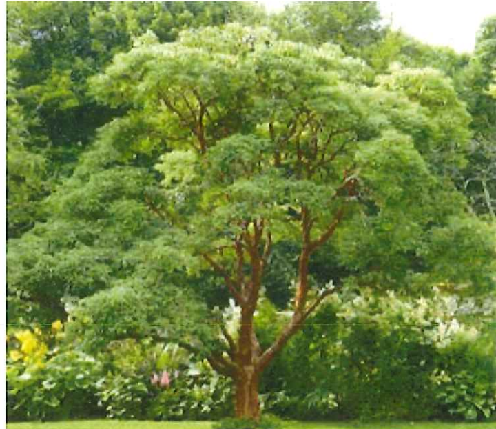
acer griseum | paperbark maple