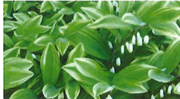
polygonatum o. 'variegatum' | solomon's seal