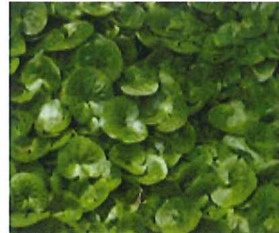
asarum europaeum | ginger