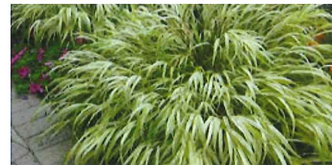
hakonechloa macra 'albo striata' | hakone grass