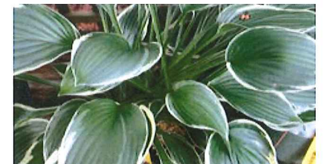
hosta 'francee' | hosta