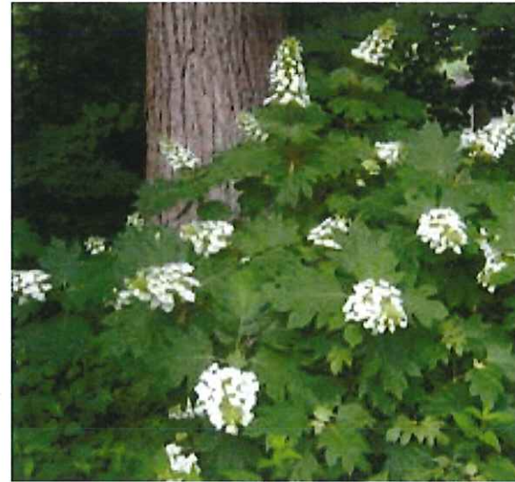
hydrangea quercifolia | oakleaf hydrangea