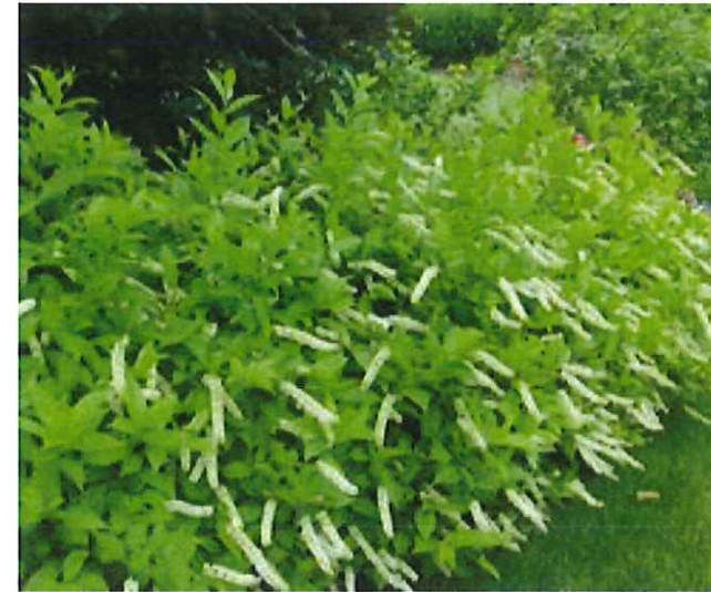
itea virginica 'little henry' | little henry's garnet