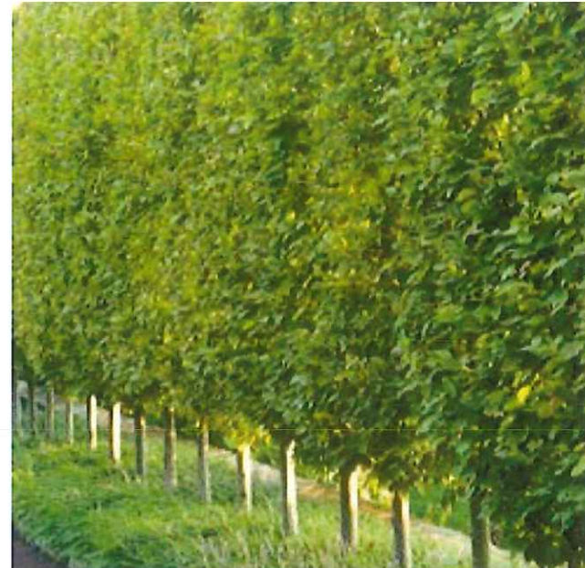
carpinus betulus 'fastigiata' | hornbeam