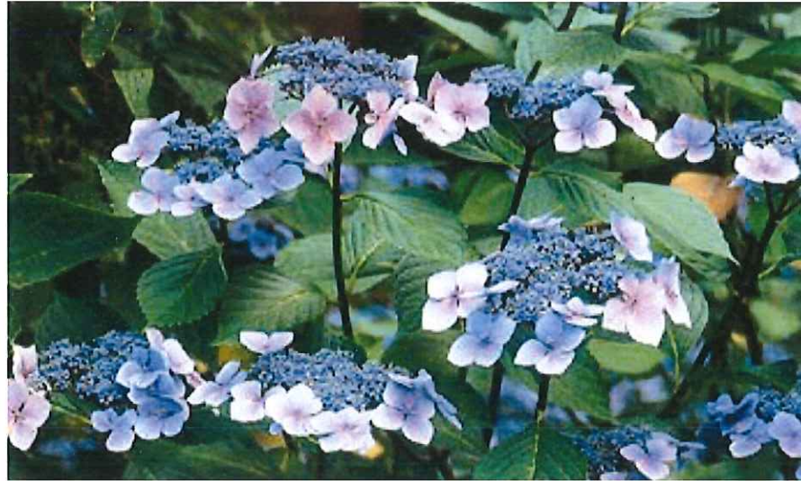
hydrangea mac. 'mariesii perfecta' | blue wave lacecap hydrangea