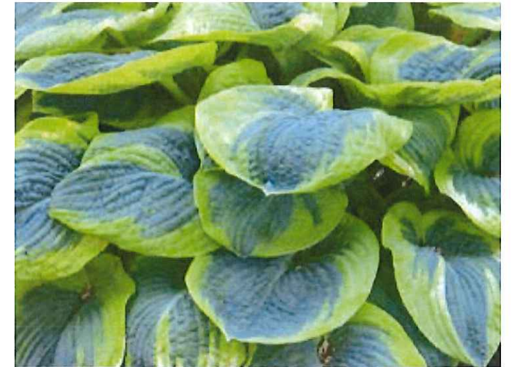
hosta 'frances williams' | hosta