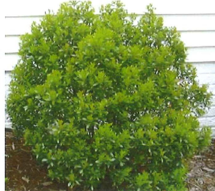
ilex glabra | inkberry