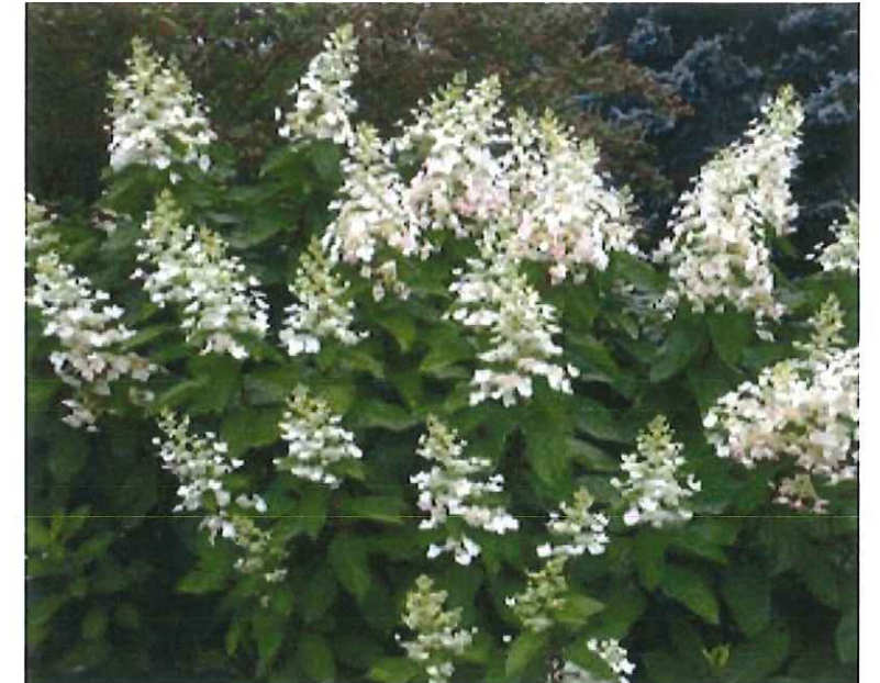
hydrangea paniculata 'tardiva' | tardiva hydrangea