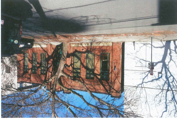
Adjacent Cambridge Charter School Annex