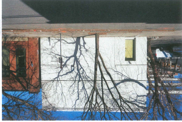
Fifth Street View of Apt 1