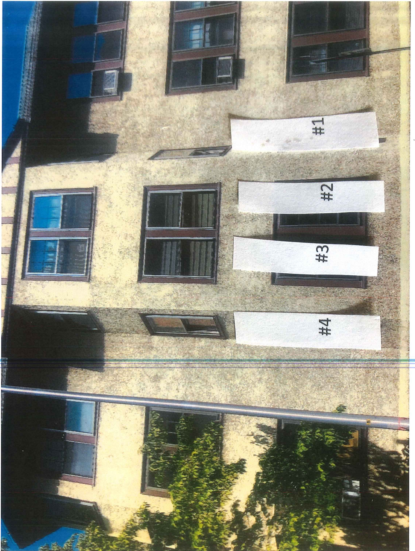
2nd Fl. windows