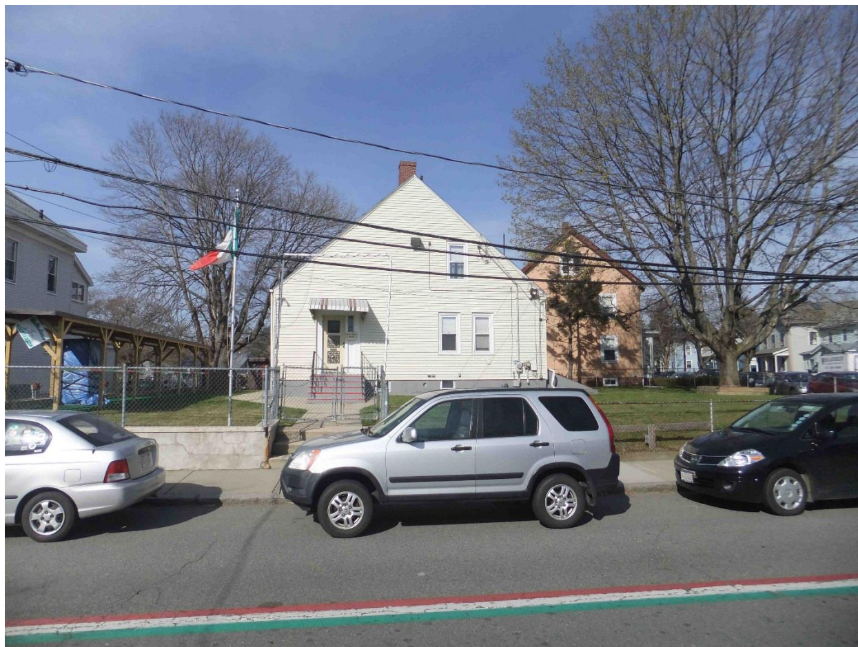
Wyeth Tenant House, 136-138 Cushing Street

An application to demolish the building at 136-138 Cushing Street (with an alternate address for 138 Cushing as 6 Vineyard Street) was received on September 9. The applicant, MacArthur Construction Company, was notified of an initial determination of significance and a public hearing was scheduled for October 1.