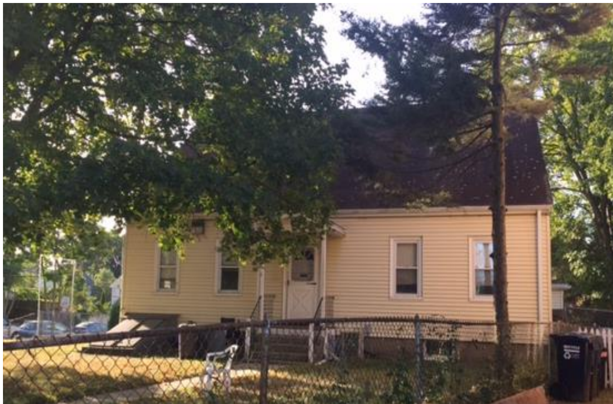
Wyeth Tenant House, Vineyard Street elevation