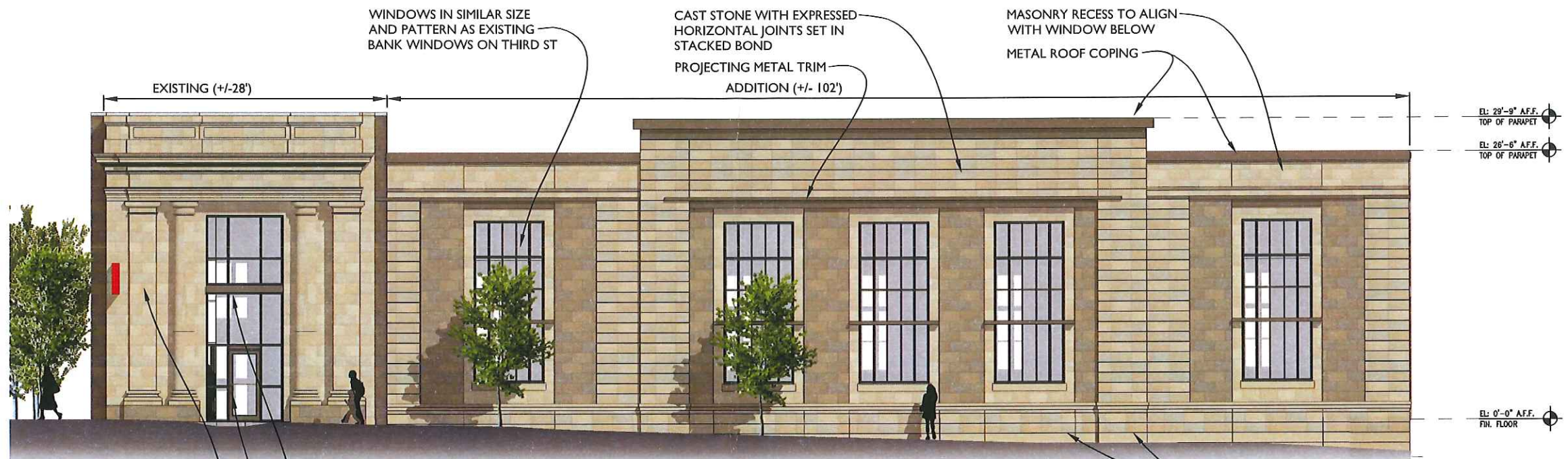
CAMBRIDGE ST ELEVATION

EXISTING BANK BUILDING TO REMAIN NEW CURTAIN WALL INFILL AND ENTRY NEW METAL CANOPY