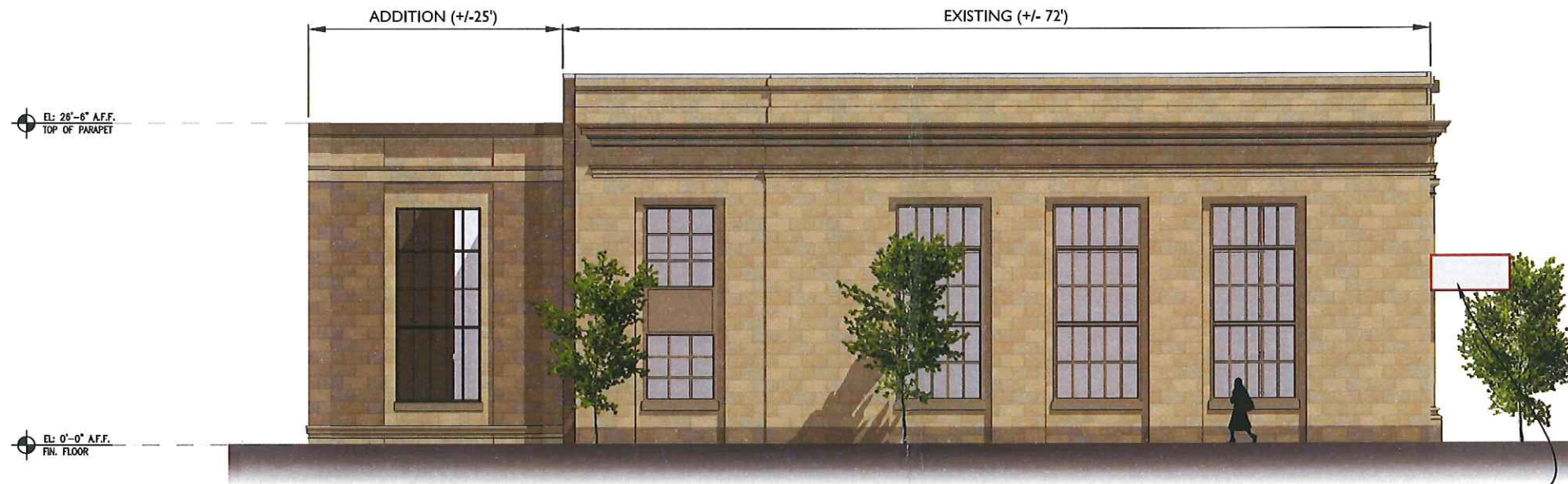
THIRD ST ELEVATION

LIMESTONE BASE FROM BULL NOSE TRANSITION TO GRADE WITH EXPRESSED HORIZONTAL JOINTS, TYPICAL