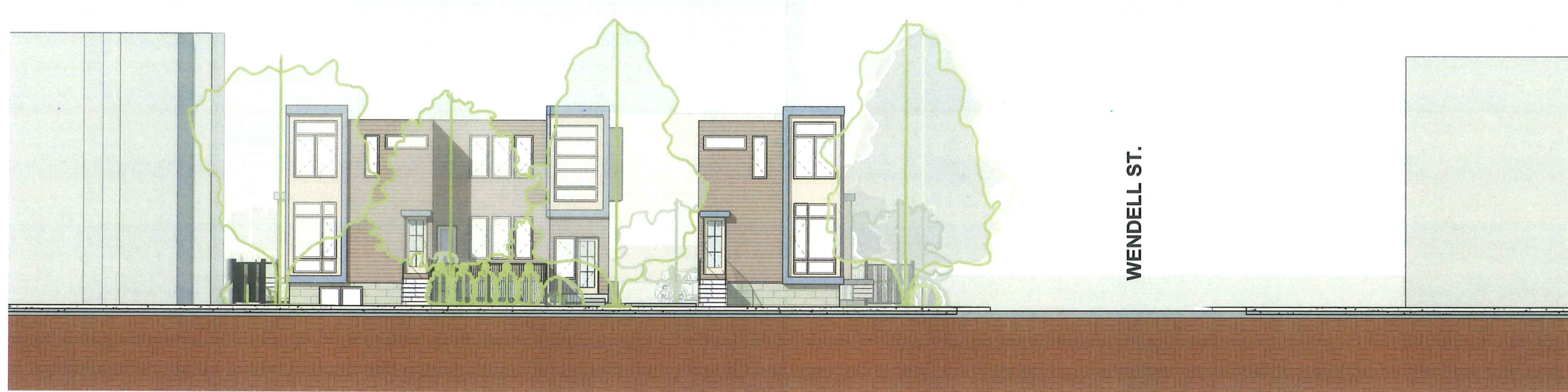
① Oxford St. Elevation 1/8" = 1'-0"