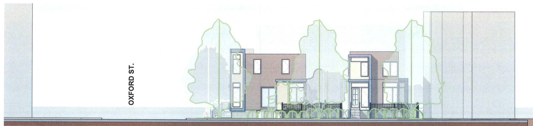
② Wendell St. Elevation 1/8" = 1'-0"