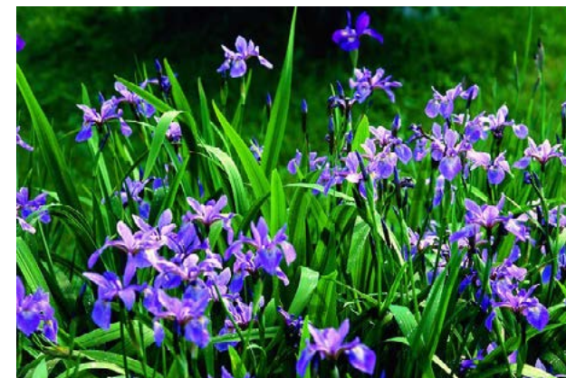
Iris versicolor Blue Flag 1 QT.