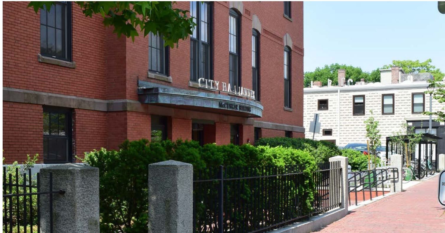
Existing Hedge and Fence