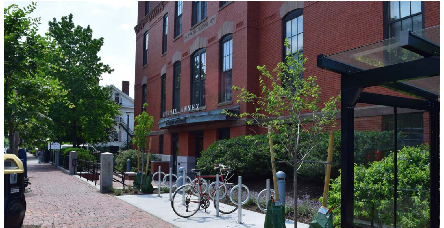
Existing Foundation Planting and Bike Parking