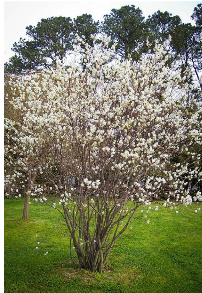
Amelanchier canadensis Serviceberry 12'-14' Multi-Stem