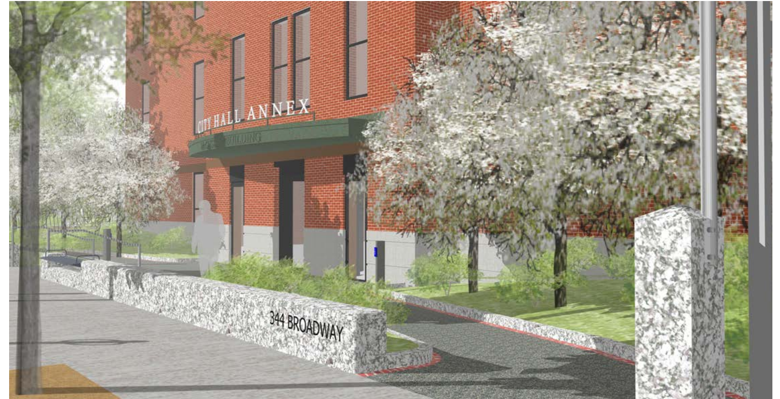
Proposed Planting Area View from the North