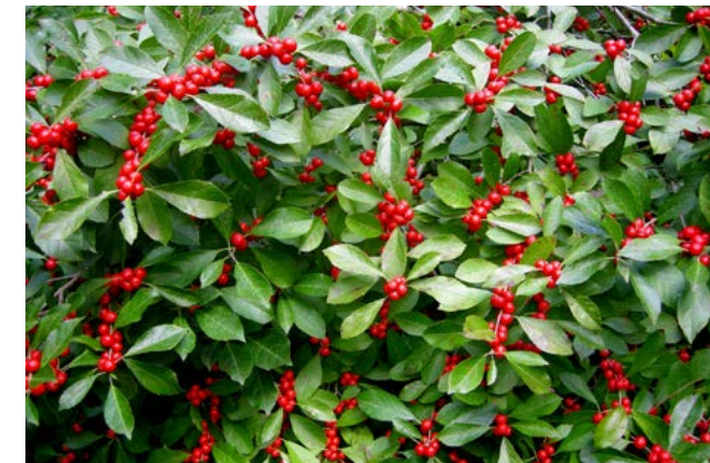
Ilex verticillata 'NANA' RED SPRITE Red Sprite Winterberry 24" ht