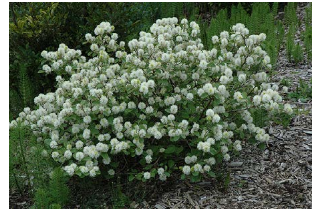
Fothergilla gardenii Dwarf Fothergilla 24" ht