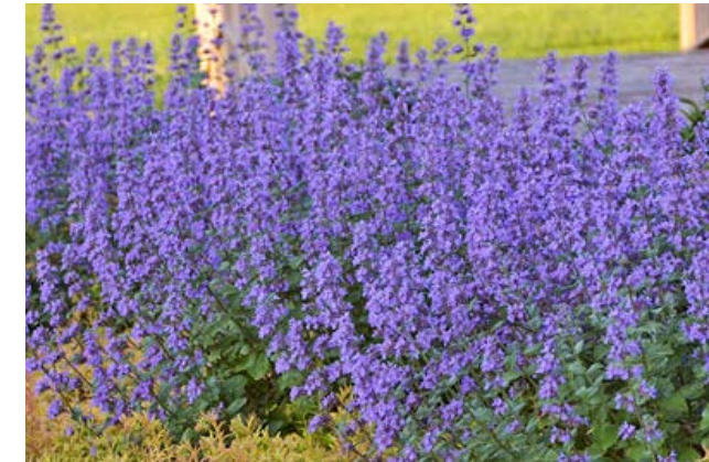
Nepeta racemosa 'Blue Wonder' Blue Wonder Nepeta 1 QT.