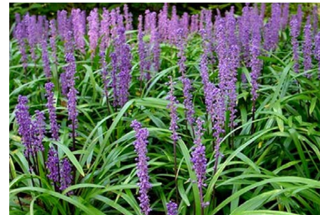
Liriope muscari 'Big Blue' Big Blue Lily Turf 1 QT.