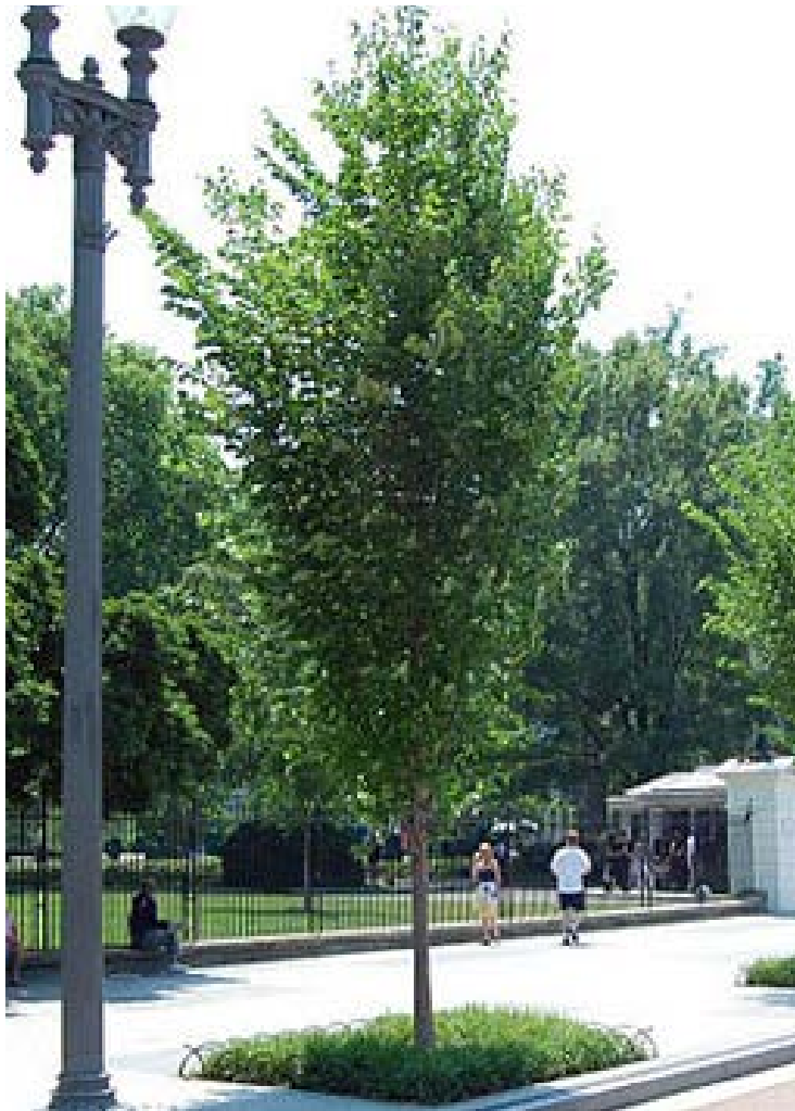
Ulmus americana 'Princeton' American Elm 3.5" CAL. Limbed up at 7' ht