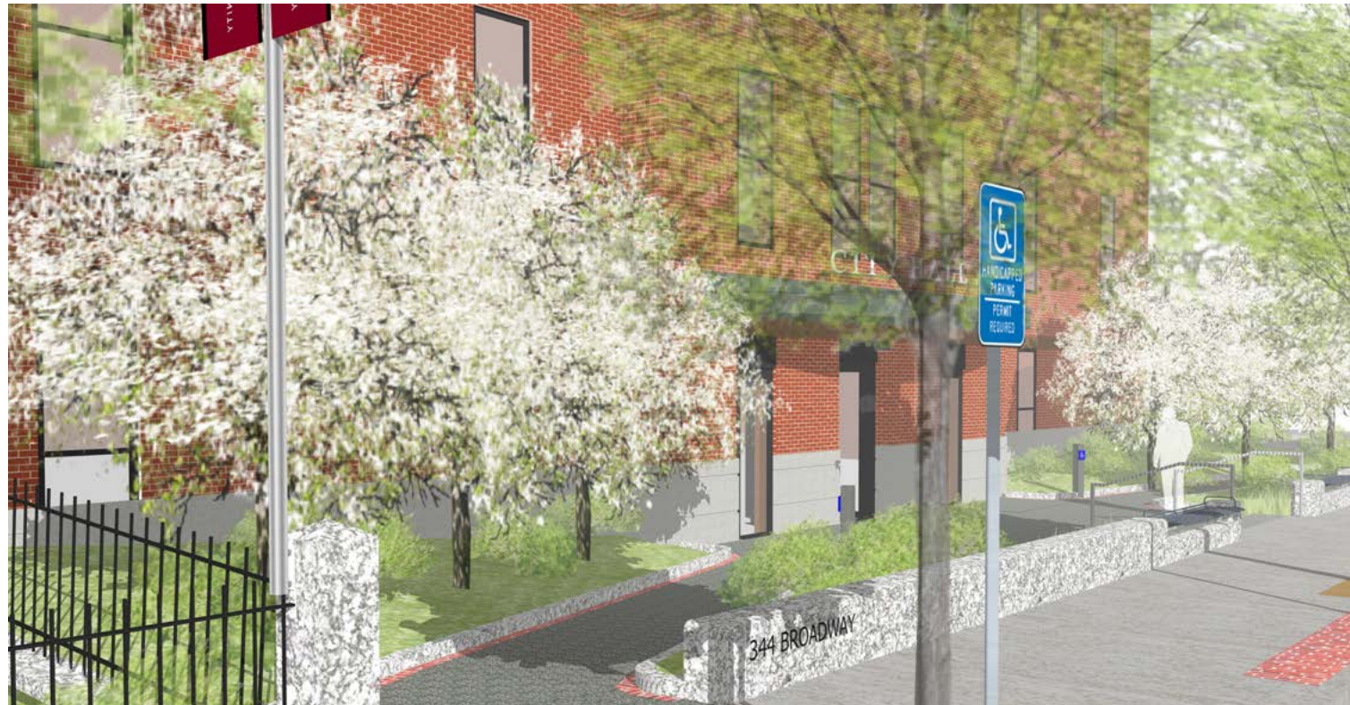
Proposed Planting Area View from the South