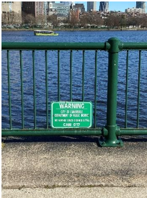
Figure 8: CAM017