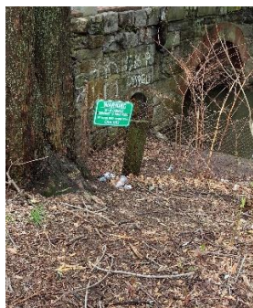
Figure 3: CAM002