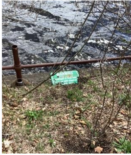
Figure 6: CAM005