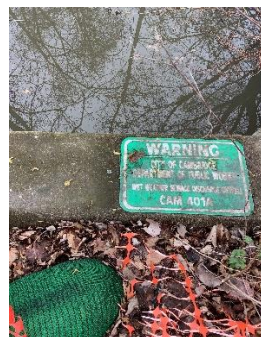
Figure 4: CAM401A