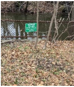
Figure 5: CAM401B