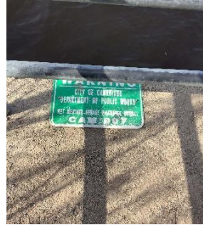
Figure 7: CAM007