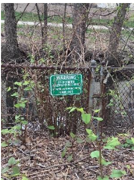
Figure 2: CAM001