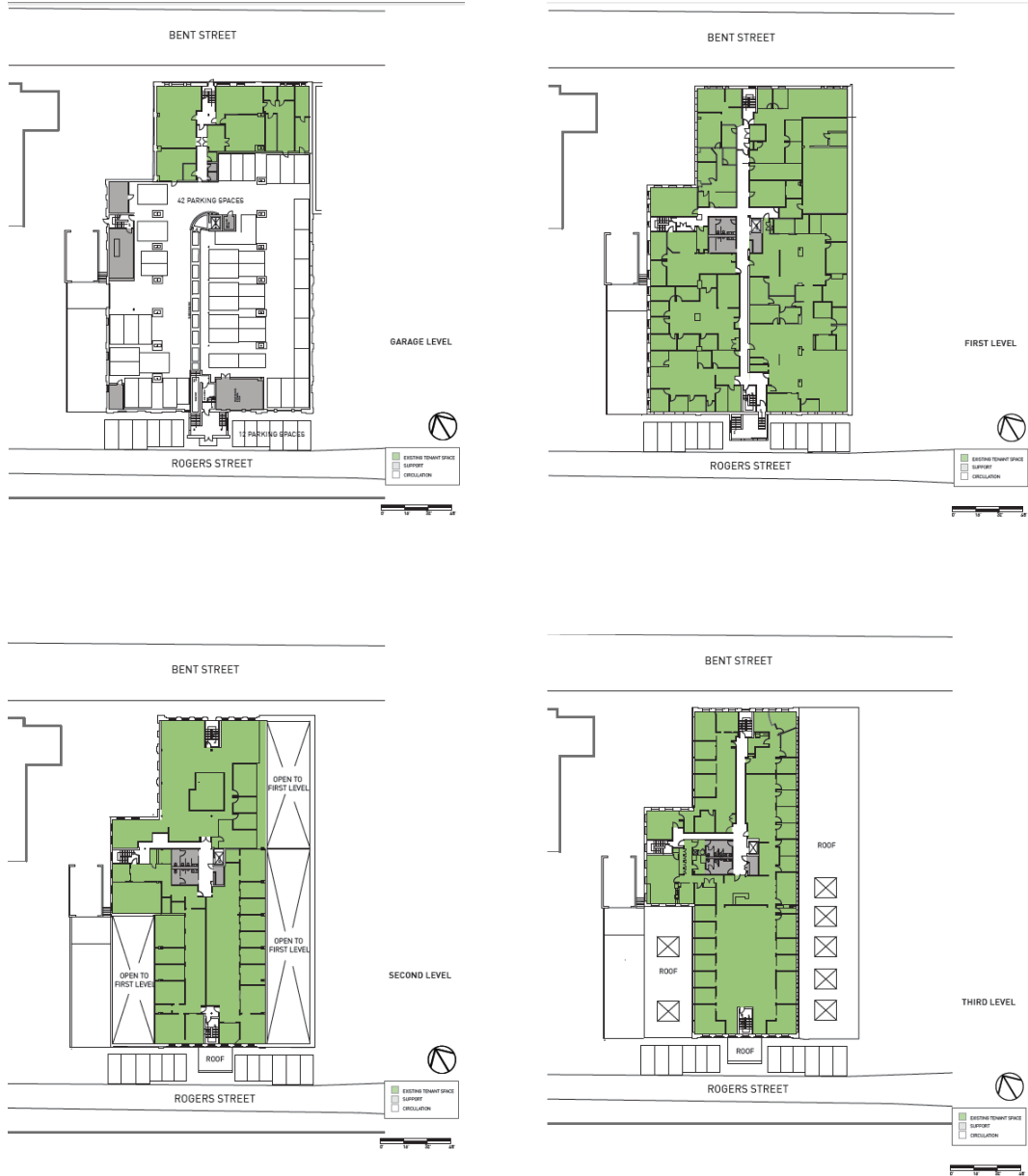
Existing Foundry Floor Plans

Fire Protection: Areas of the building require improved fire protection. The fire alarm system does not meet code, and the fire pump room requires a direct egress to the outside. Significant code upgrades are needed to reach the Occupancy Type B requirements necessary for a broad range of uses.