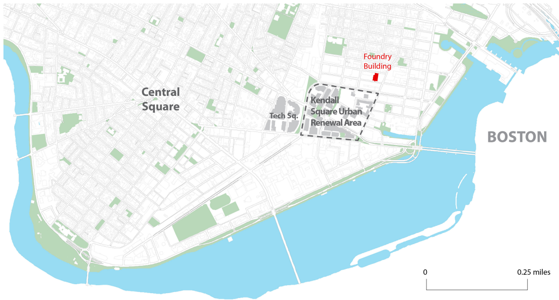
Foundry Location Map

Not all of Cambridge’s residents have access to these jobs, however. In the City, 13% of people live in poverty, and 26% of those over 25 years of age have less than four years of college. Poverty rates and unemployment rates are higher for those with less educational attainment. 3 Two neighborhoods near Kendall Square and the Foundry (Area 4 and Wellington-Harrington) have some of the highest rates of poverty for families, especially single parent families and children under 18 years of age. 4