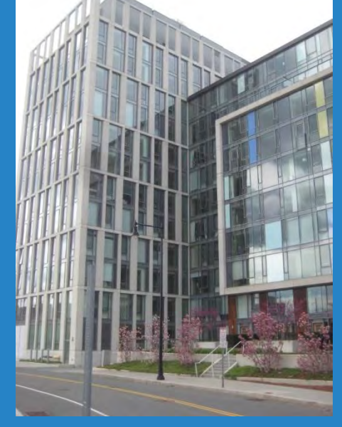
Sierra + Tango Condominiums, above, and 20/20 Apartments, below, part of the North Point PUD.