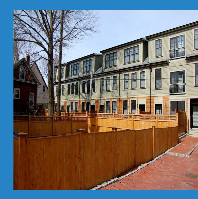
Prospect St. - 26 condominiums, 3 affordable