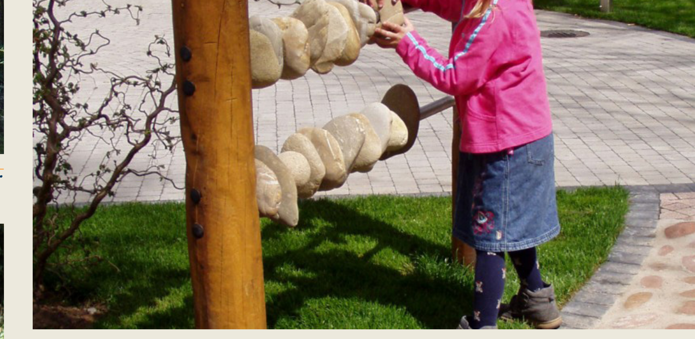
"ABACUS" PLAY PATH ELEMENT