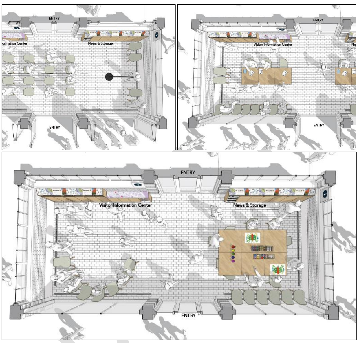
Examples of temporary Kiosk activities, from top left: performance; voter registration; family activities – storytelling with arts and crafts (Touloukian Touloukian, Inc.)

A portion of Kiosk programming may also generate revenue to help offset operational costs. This programming may include temporarily hosting a business that pays to use the space for promotional activities that contribute to the life of Harvard Square and/or financial self-sufficiency of the operation, such as giving away free samples of a product or operating a fun activity that relates to the offerings of the business. However, all activities in the Kiosk or Plaza would need to be fully open to the public, with no entrance fees.