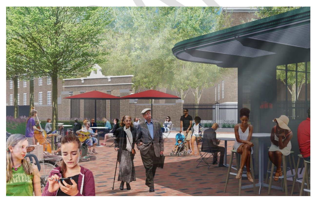
Depiction of activity around renovated Kiosk and reconstructed Plaza (Halverson Design Partnership)

The interior of the Kiosk would function as a flexible space accommodating temporary, community-serving uses that occupy the space intermittently during the span of a typical week. In addition to these uses, a daily Kiosk operation would feature news for perusal or sale and serve as a Visitor Information Center. During periods with no active temporary use, the interior space would support the news and visitor information functions as well as acting as an informal public seating space. The Plaza would also accommodate a range of temporary, community-serving programming, and would function as a community resource for informal social seating and community gathering.