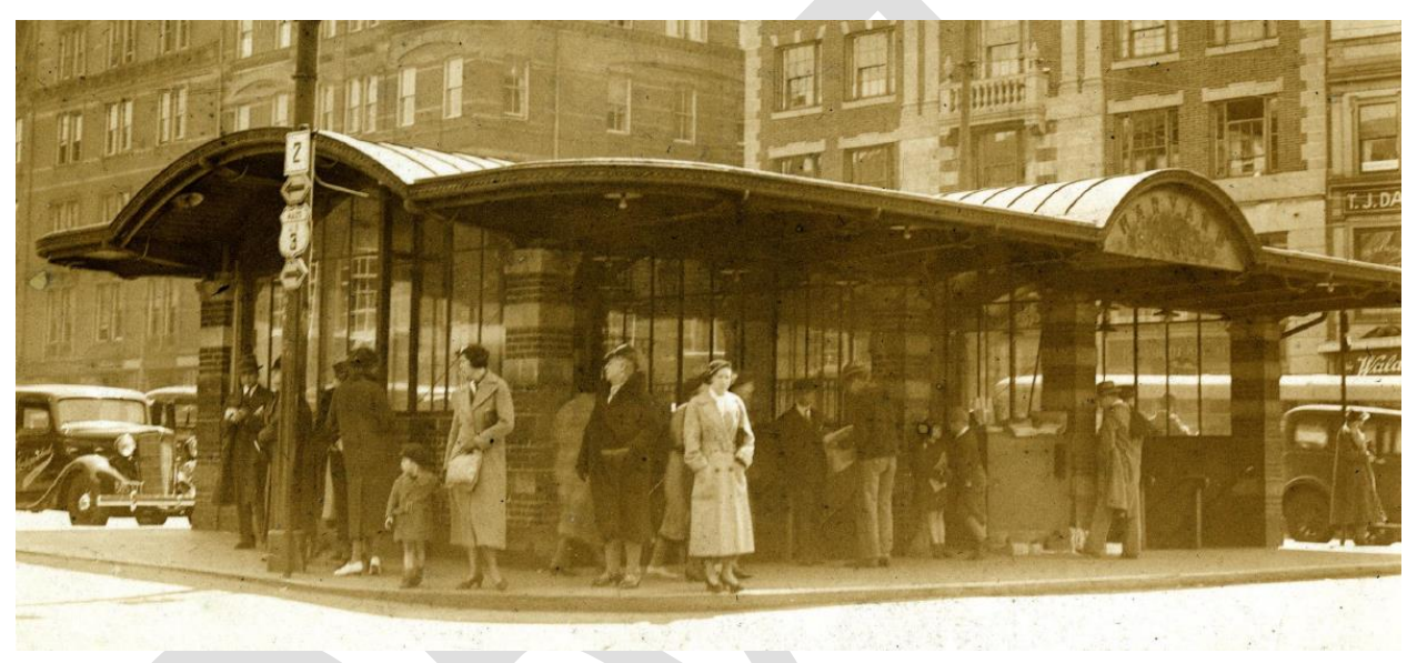
Kiosk, ca. 1938, functioning as headhouse

The Harvard Square Kiosk was constructed in 1927-28 as a headhouse and entrance to the subway line below, replacing a larger headhouse built in 1912. During 1981-84, the Kiosk was disassembled, removed, and stored while most of the station below was demolished during construction work to extend the terminus of the Red Line from Harvard to Alewife. A new headhouse was constructed in its place, and in 1984, the Kiosk was reassembled with some modifications to accommodate its use as a newsstand, including exterior magazine racks and a projecting cashier's booth. Since then, the City of Cambridge, which owns the structure, has leased it to multiple businesses operating as Out of Town News. The newsstand was originally founded in 1954, occupying a succession of stands that accompanied the Kiosk in what was then a small traffic island. During the construction of the Red Line extension, the traffic island was also expanded into the larger Plaza that exists today.