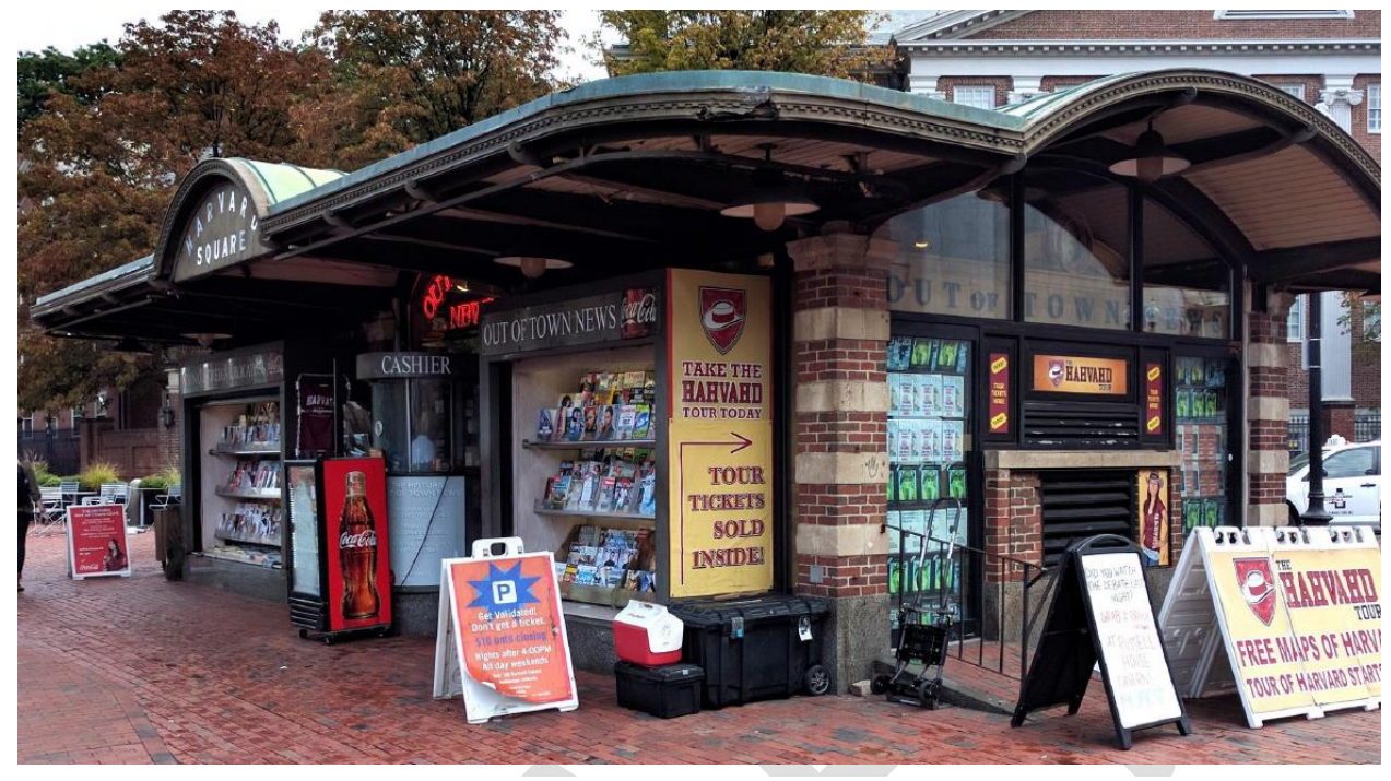
Kiosk in 2016

In 2017, the City established the Harvard Square Kiosk and Plaza Working Group, composed of residents, business and property owners, representatives from local institutions, and subject matter experts, to create a vision for the future use, operation, and governance of the Kiosk and surrounding Plaza. The Working Group process has involved broad public input, including public meetings, surveys, and a Call for Ideas process, which have provided a wide range of ideas to inform the Working Group's discussions. Based on this community feedback, and with the support of City staff and three project consultants, Project for Public Spaces, Halvorson Design Partnership, and Touloukian Touloukian, Inc. the Working Group developed the recommendations captured in this document.