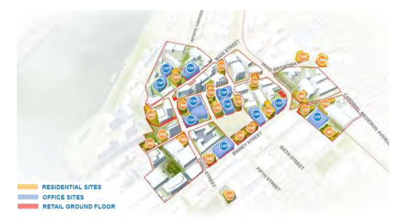
CBT Potential Development Sites