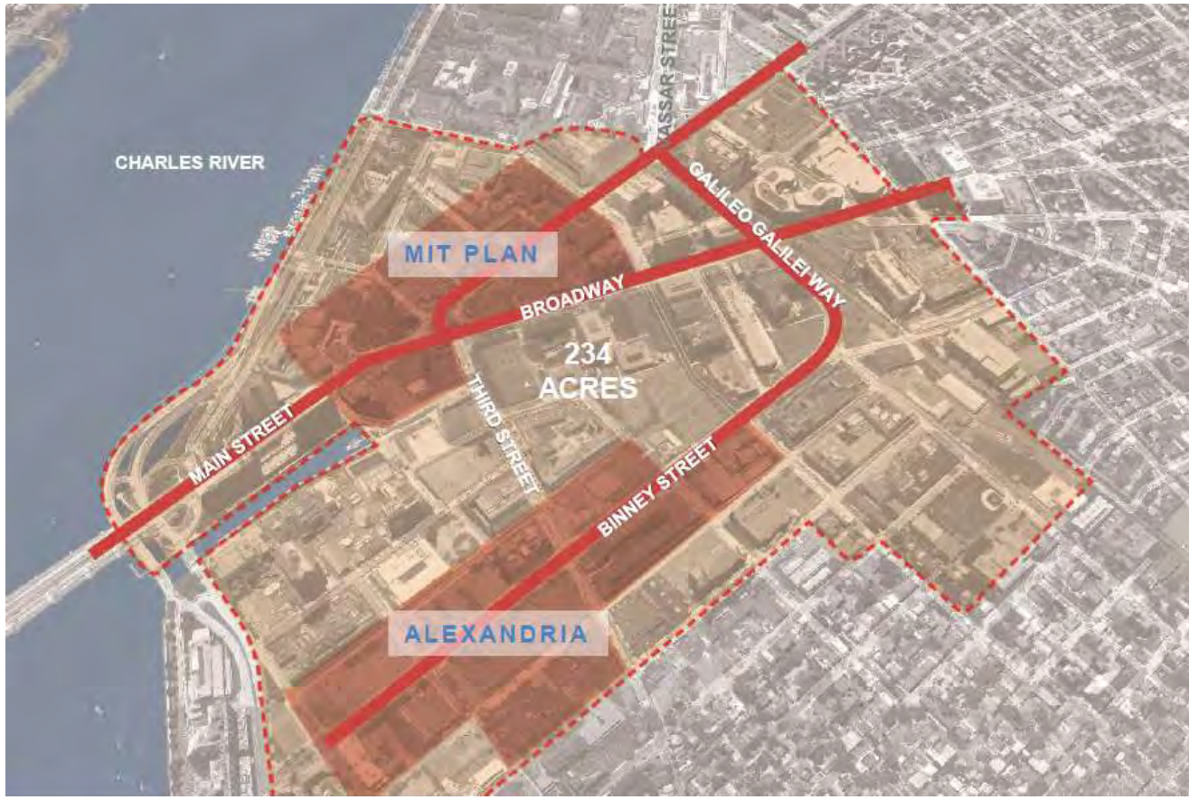
CBT Study Area

*Note: While the CBT Study Area is significantly larger than the K2 Study Area, the majority of the additional area is either built out (such as Tech Square and 1 Kendall Square) or previously permitted for development (such as Alexandria) and hence not included in the calculation of 'New Development'. Potential office sites identified in the CBT plan are largely concentrated within the K2 Study Area, while the expanded Study Area accommodates potential residential sites adjacent to the nearby residential neighborhood edges.