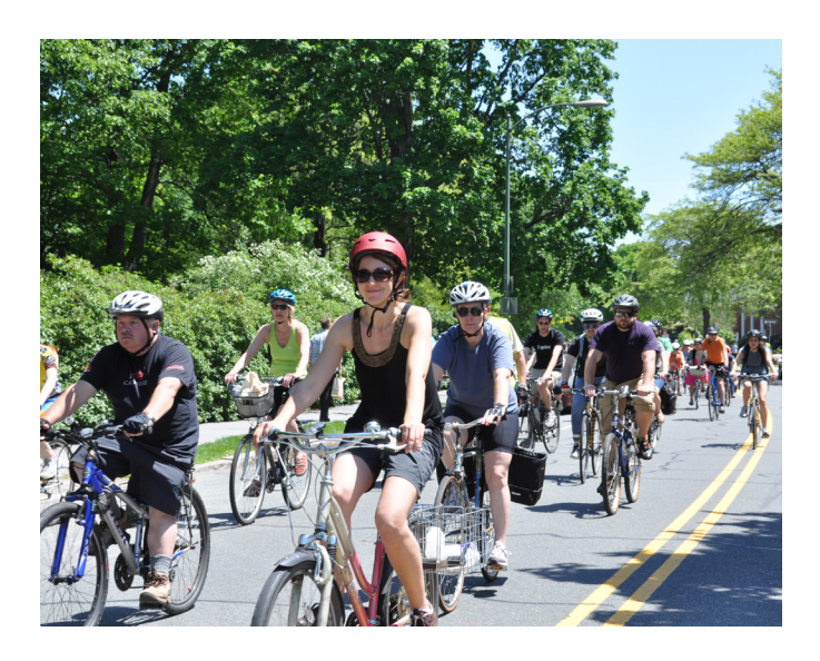
Figure 6.6: The Cambridge Bicycle Committee organizes regular community rides through Cambridge.

In 1991, the Cambridge Bicycle Committee was officially created as a permanent advisory committee appointed by the City Manager. It comprises people who live or work in Cambridge, representatives from Harvard and MIT, and staff from related departments: Community Development; Traffic, Parking, and Transportation; Public Works; and the Police.