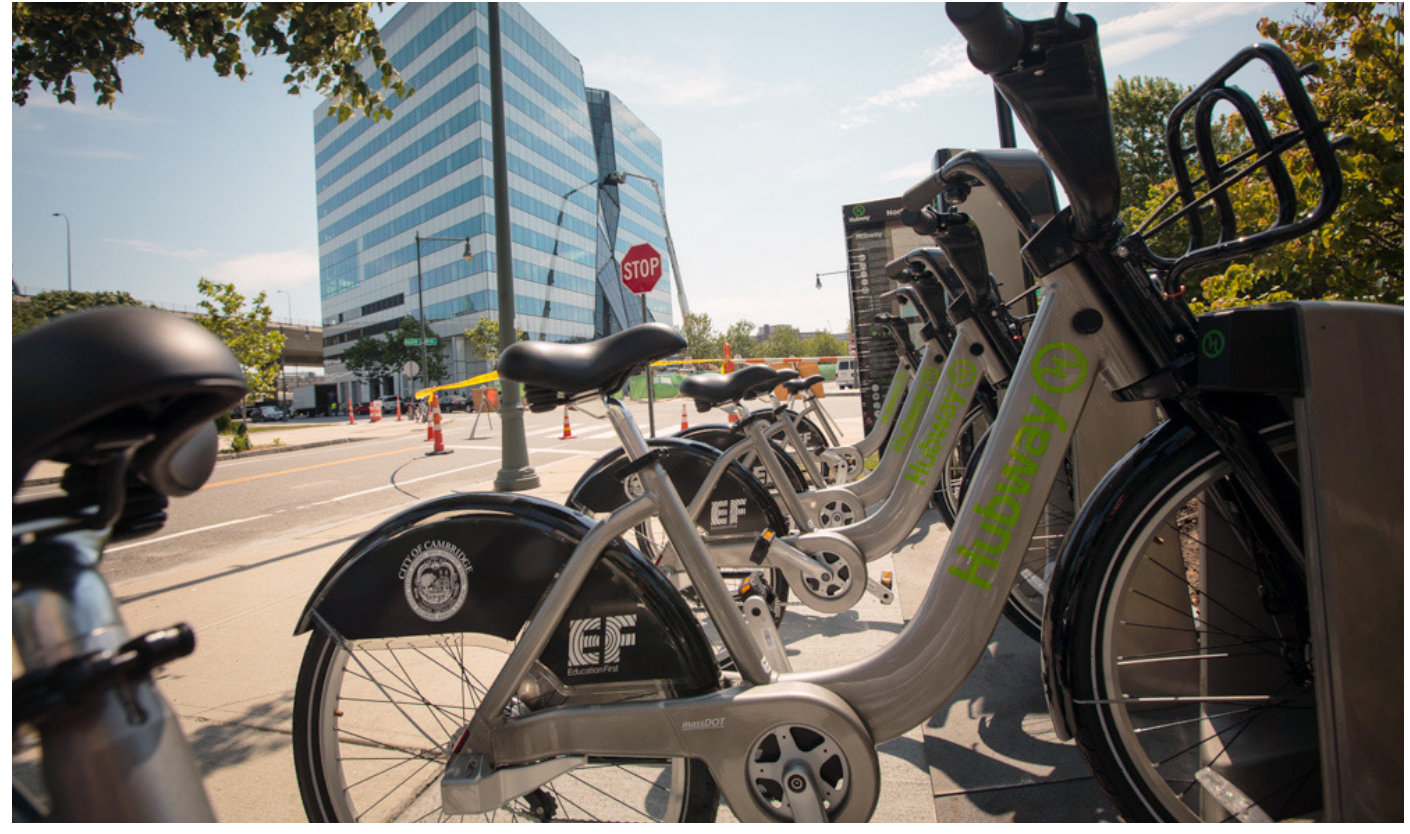
Figure 6.7: EF Hubway Station

Donated a large Hubway station; constructed expanded off-road paths in the North Point area; supports and helps to promote the expansion of the path system.