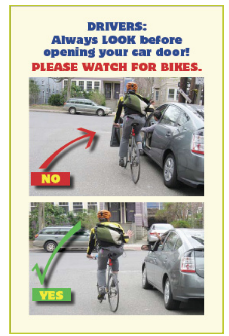
Figure 6.2: Examples of educational materials available at www.cambridgema.gov/bike