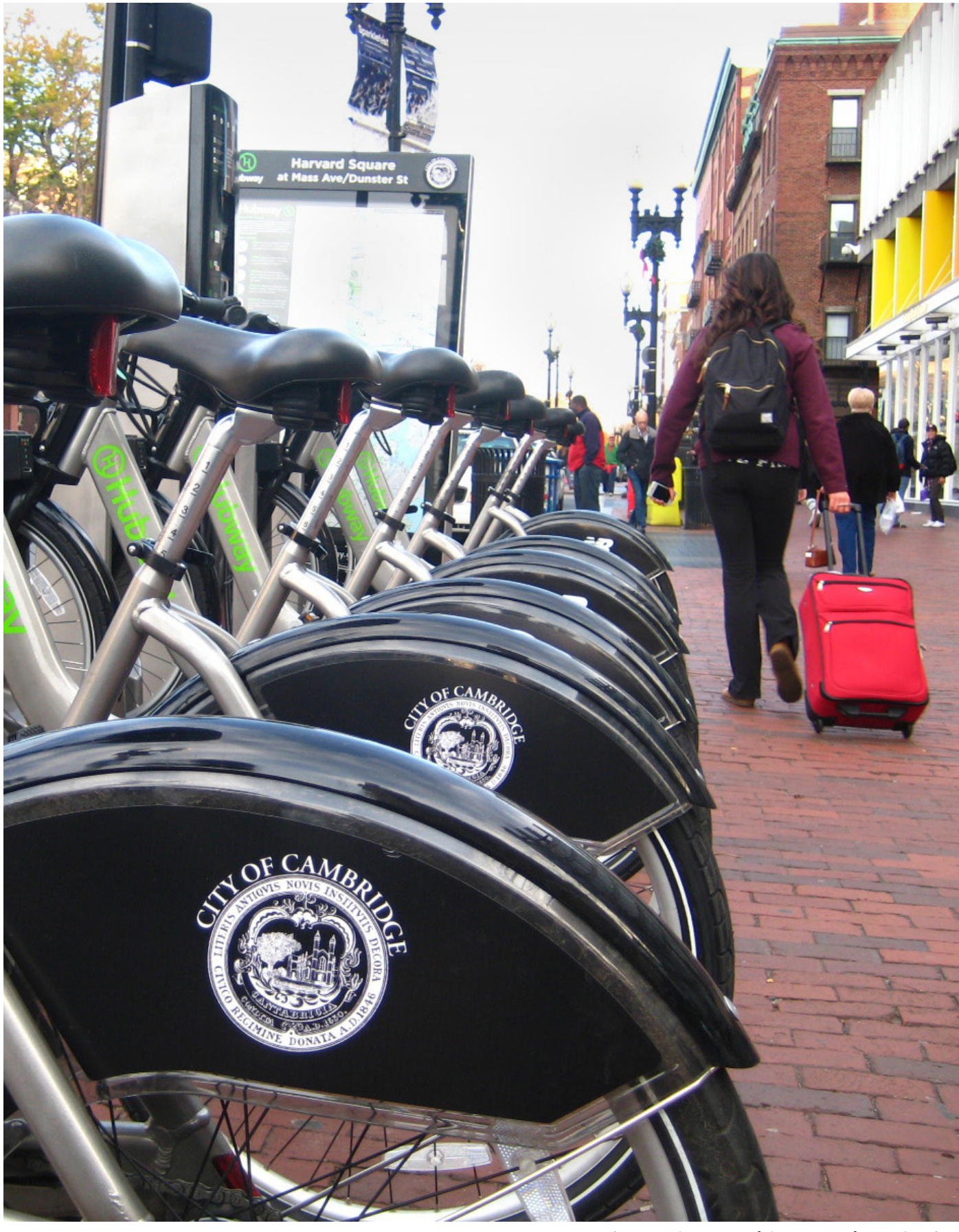
Figure 6.8: Harvard Square Hubway Station