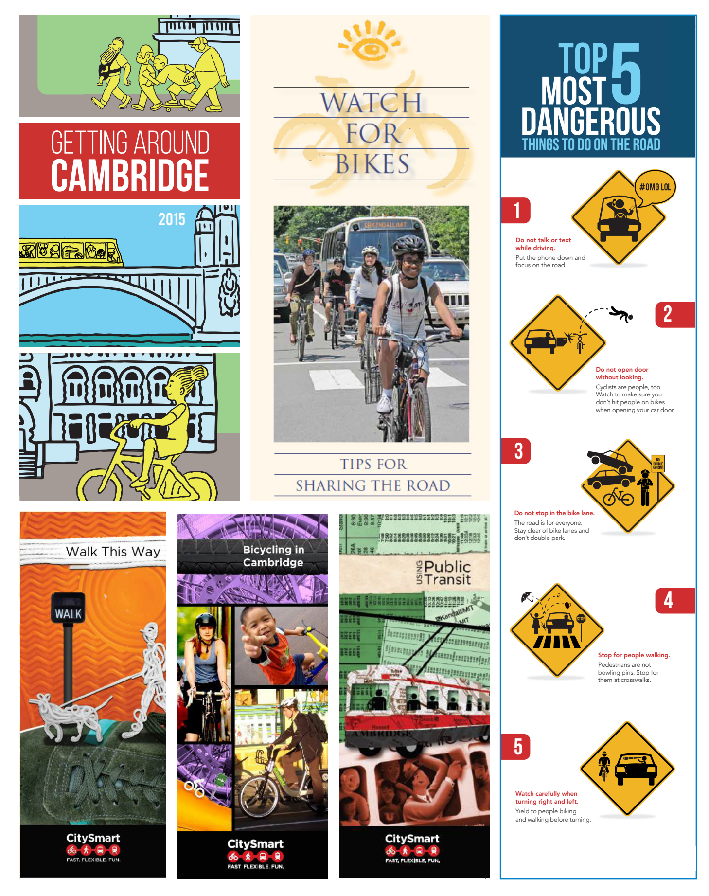
Figure 6.1: Examples of educational materials