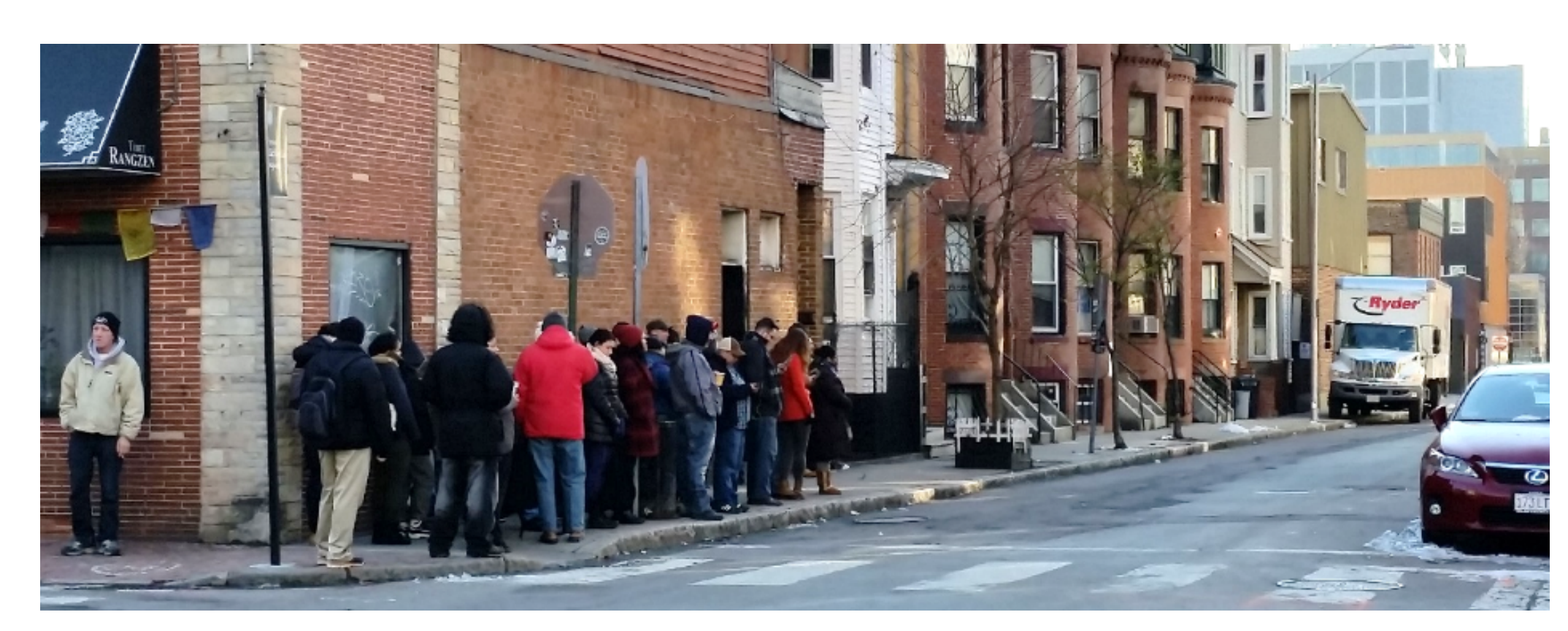
Sidewalk at bus stop is too narrow