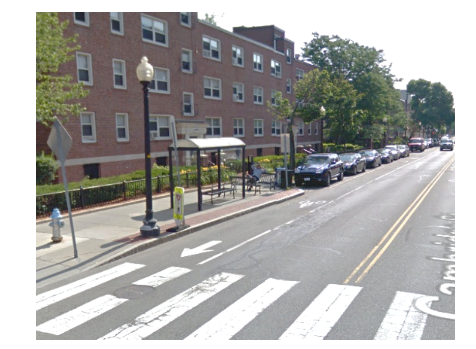
Example of curb extension with bus shelter on Cambridge Street