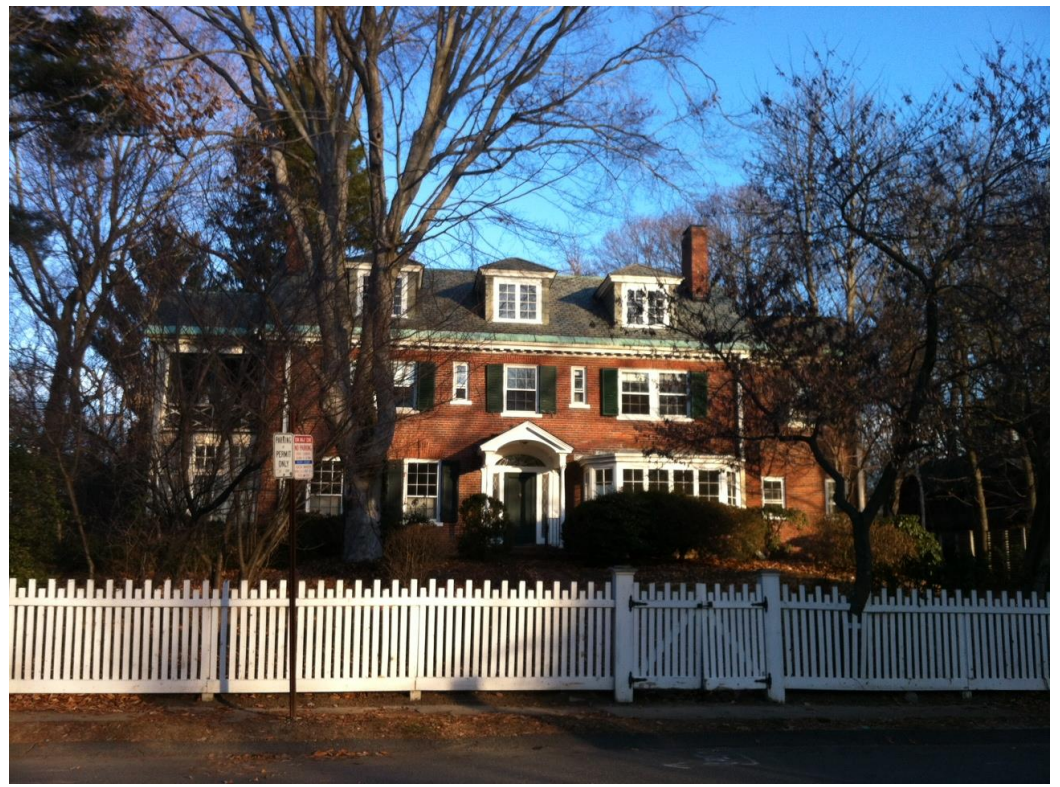
29 Highland Street front elevation, staff photo, Dec. 31, 2014

The existing site plan includes a driveway to the east of the house (#29) to access the carriage house dwelling at the back corner of the lot (#29 rear). The carriage house is situated with non-conforming setbacks on two sides, and it is not proposed for demolition. The front house has conforming setbacks, being closest to the property line of #23 Highland Street on the east side with a 20 foot setback.