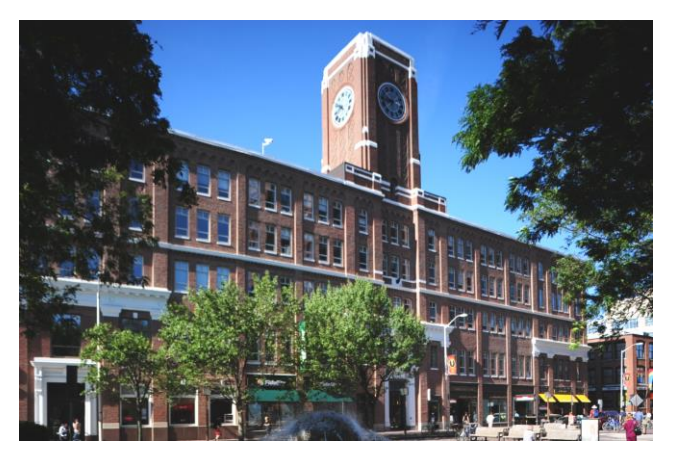
Kendall Square Building as extended, 1925. CHC photo, 2012

Preservation objectives for the Kendall Square Building should include maintaining the brick masonry, storefronts, and main entrance in their current state. The clock should continue to operate. When windows reach the end of their useful life, more appropriate replacements should be considered.