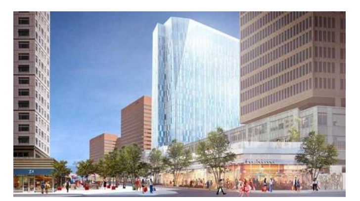
Residences on Main, seen from Third Street

Residences on Main. This highrise residential tower directly abuts the Broad Canal and the E.R. Luke (American Red Cross) building, both of which are on the National Register. The impact of this project on these historic resources is being resolved through the Massachusetts environmental review process.