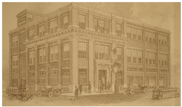
Manufacturer's National Bank building, 222 Main Street, 1917. Letterhead cut, 1919.

3. Kendall Square Building, 238 Main Street (1917-25). The Kendall Square Building is a five-story reinforced concrete structure with brick cladding. The exterior masonry is in good condition, but the original 8+8 double-hung sash have been replaced with inappropriate aluminum windows. Some storefronts, although reworked with aluminum, have traditional recessed entrances and retain their original marble trim and replicated Luxfer prism transom lights. One vitrine by the entrance retains its original bronze surround. The masonry of the main entrance, although painted, is in good and original condition.