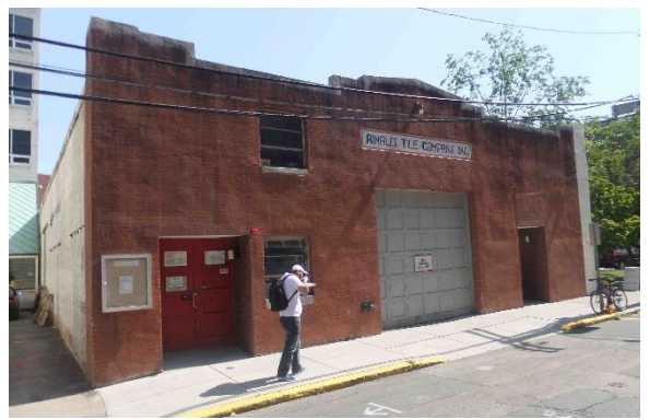
32-34 Carleton Street (above); 38-42 Carleton Street (right).