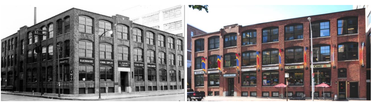
J. L. Hammett Co., 264 Main Street. Left image: R.E. Smith collection, CHC. Photo 1953. Right: CHC photo, 2012 Preservation of the Hammett building should include careful maintenance of the brick ma-

2. J.L Hammett Building, 264 Main Street (1915). The Hammett building is a three story brick industrial building with a slow-burning timber frame; the first floor is about 3' above grade. It originally featured 8+8 double-hung wood sash. The exterior masonry is in a good state of repair, but the windows have been replaced with 4+1 aluminum windows with applied muntins. Conversion of the first floor to retail use has been accomplished with little disruption to the structure and without marked inconvenience to customers.