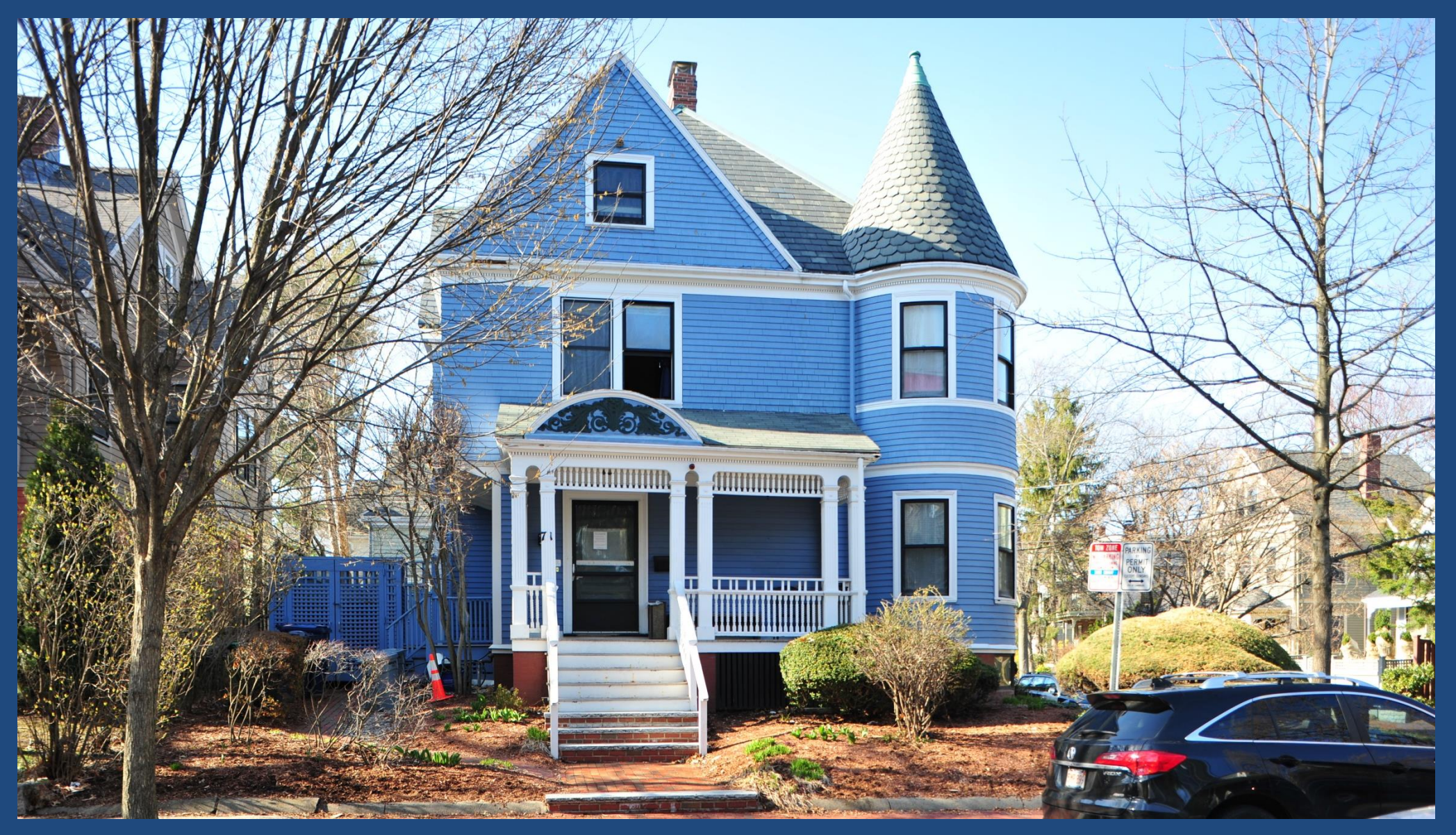
PG 20-05, 71 Hammond Street, by Cambridge Housing Authority. $50,000 for siding and porch repairs