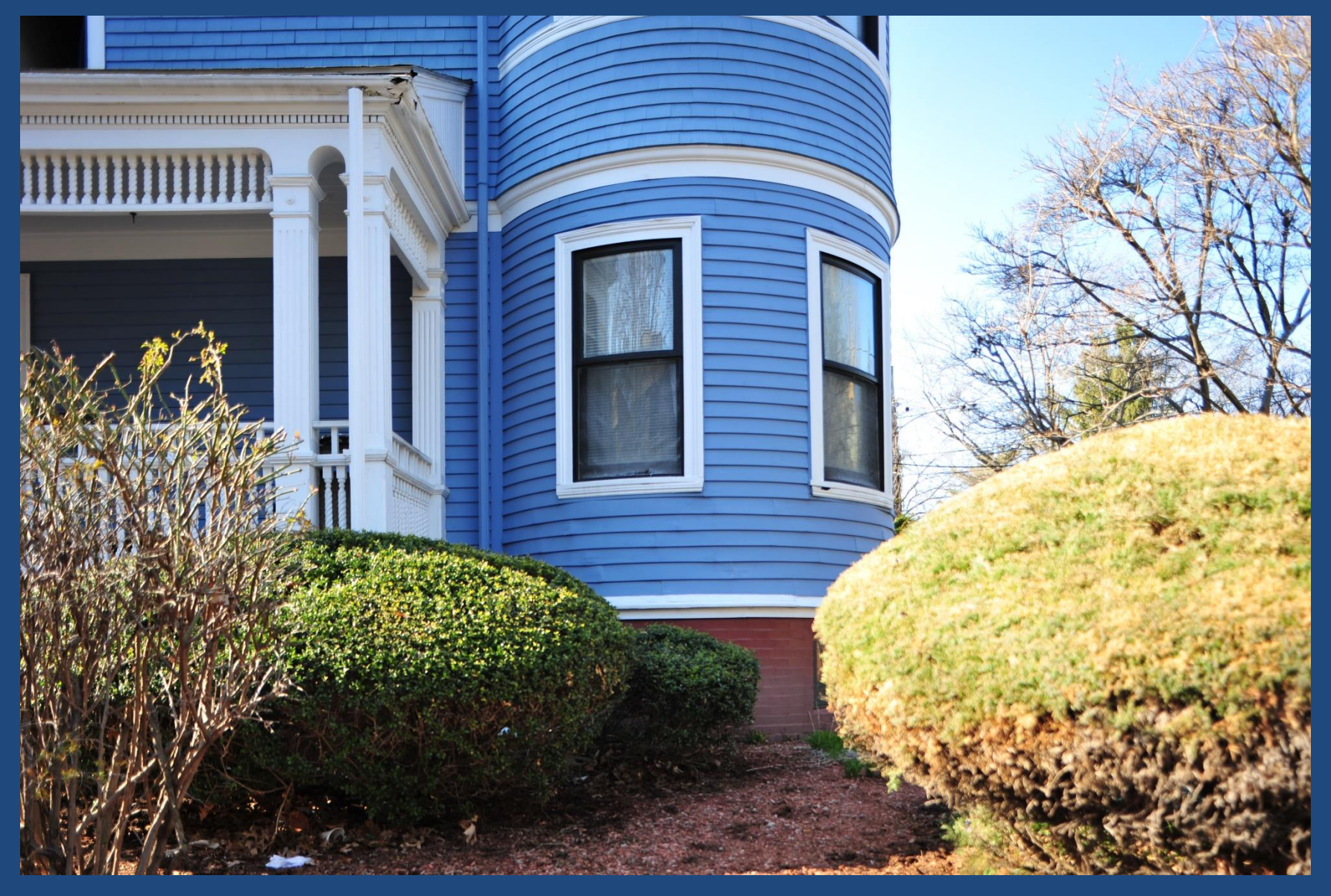
PG 20-05, 71 Hammond Street, by Cambridge Housing Authority. $50,000 for siding and porch repairs