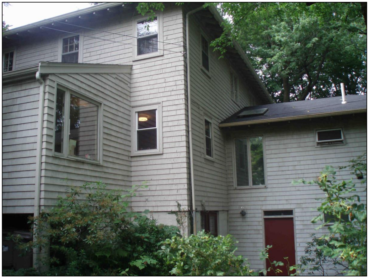
15 Gurney Street, Cambridge Assessor's Department North side view