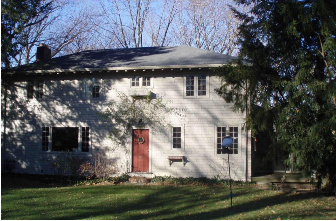
15 Gurney Street, Cambridge Assessor's Department East (front) elevation