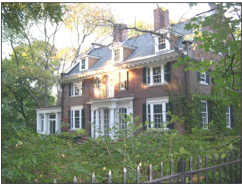
55 Fayerweather St,2007, Sarah Burks View of garden elevation, looking northwest.

Fisher's design for 15 Gurney Street was very different and far less formal than the design he made for 55 Fayerweather Street (1905), which used masonry construction and classical forms such as the columned loggia on the garden side. Materials and labor were in short supply following World War I, and architectural tastes were changing. Number 15 Gurney has a cottage quality in comparison with the Potter House. The garage pre-dates the house and was built in 1909 as part of the Potter estate.