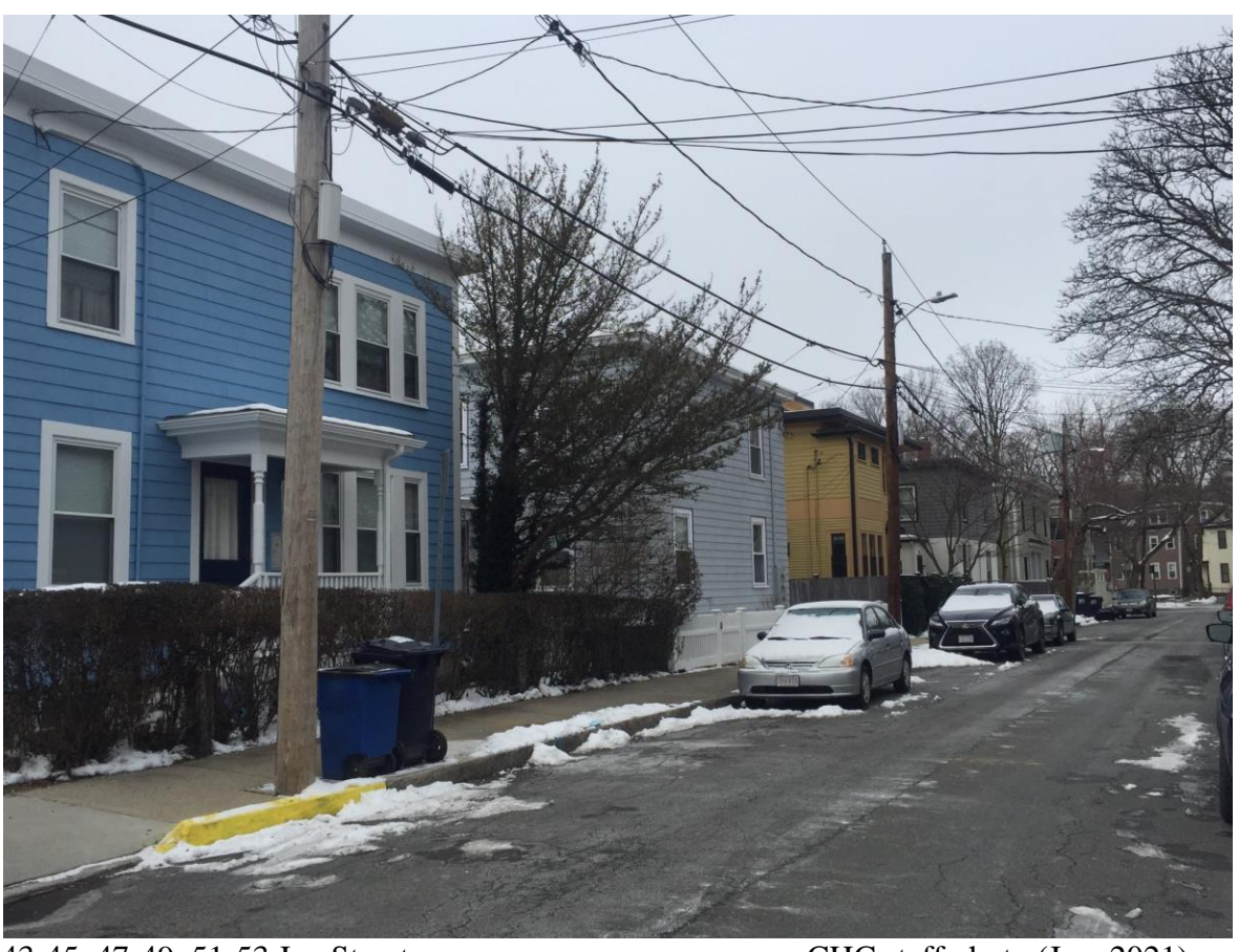
43-45, 47-49, 51-53 Jay Street