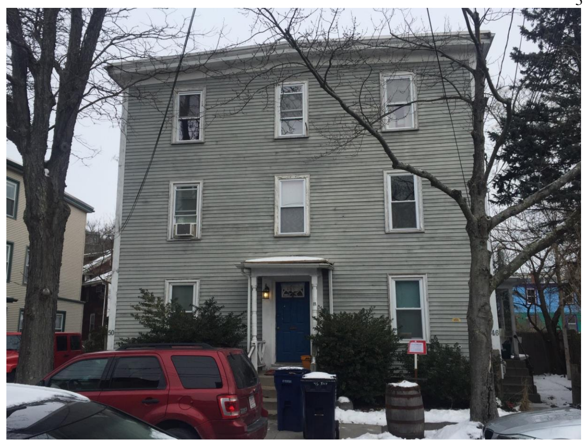
46-50 Jay Street