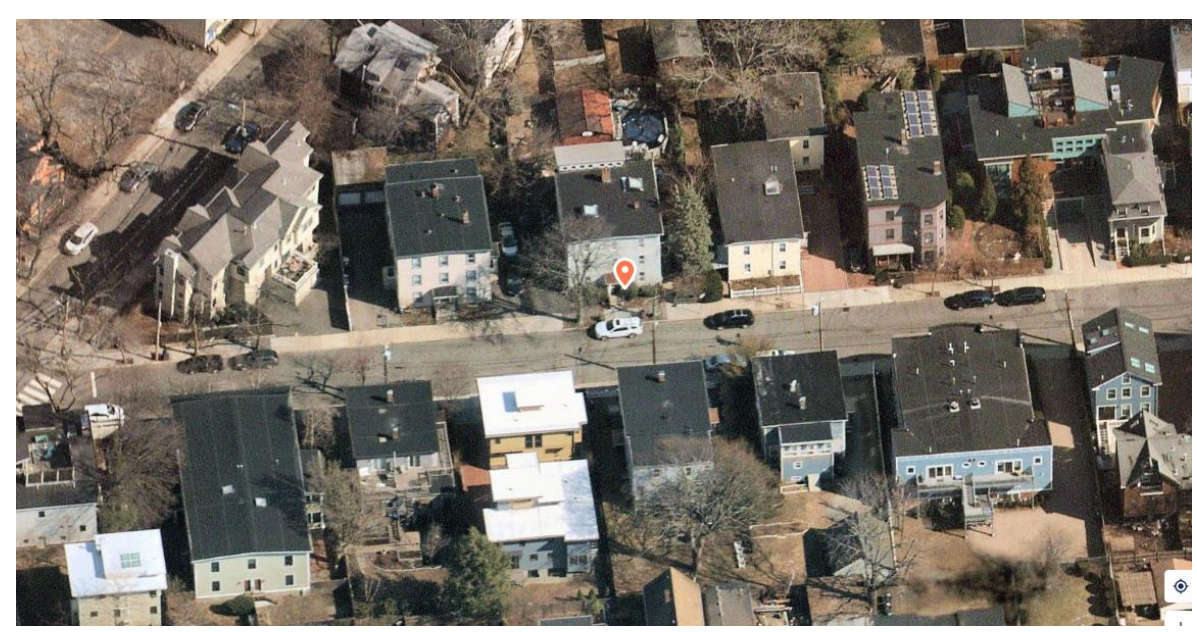
Jay Street aerial view, 2020