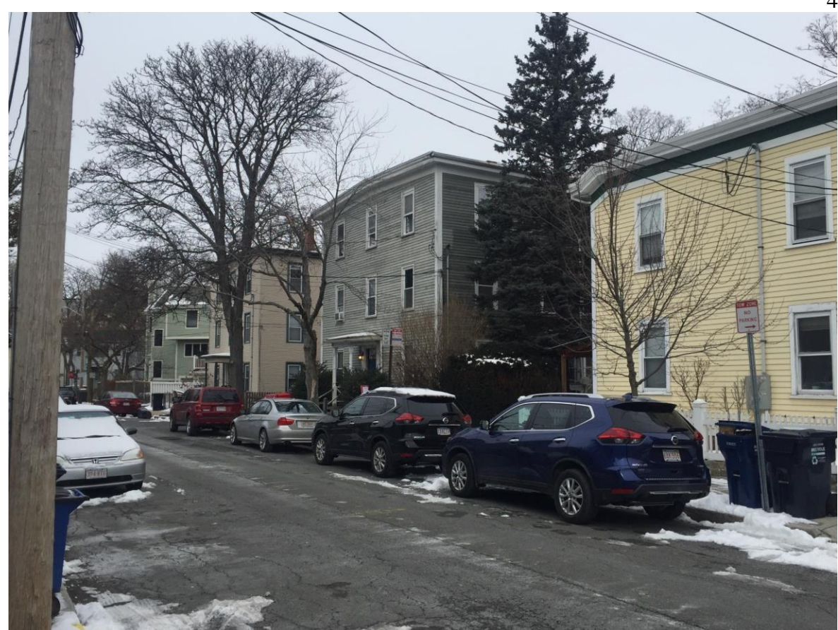
42-44, 46-50, 52-56 Jay Street