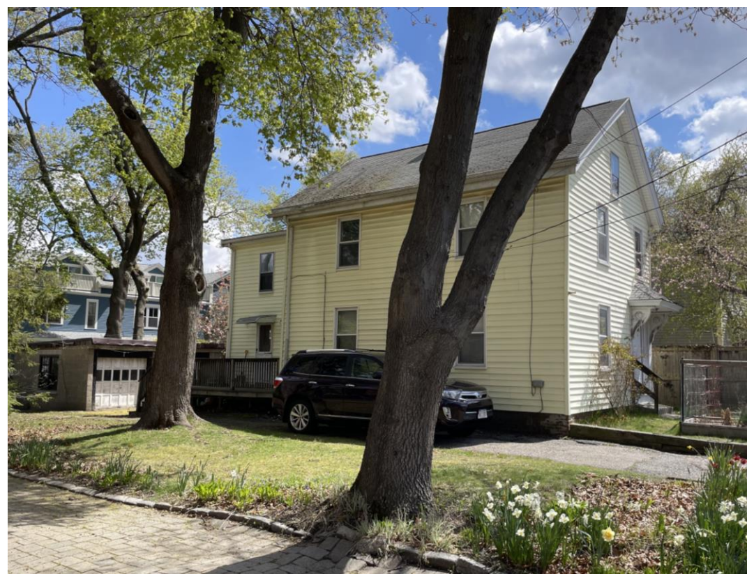
51 Kelley Street side elevation and garage, facing east.

building. A two-story ell extends off the rear and has a flat roof. A two-car, concrete block garage sits towards the rear of the lot and is accessed by a driveway.