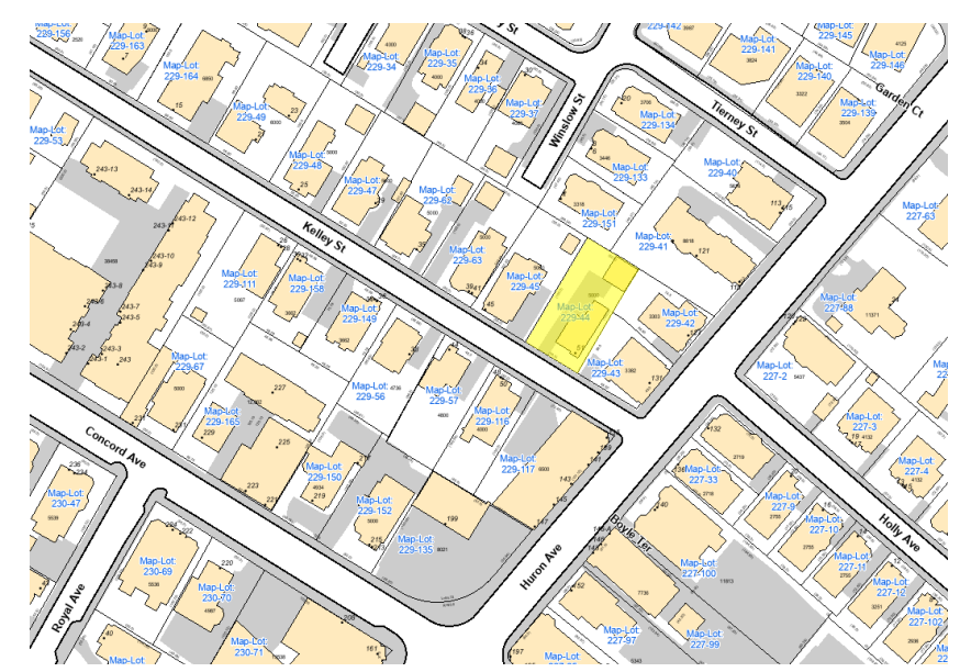
51 Kelley Street, Cambridge Assessor's Database, accessed April 21, 2023

Contemporary residences from the 21<sup>st</sup> century. On the north side of Kelley Street specifically, many Contemporary infill construction and substantial renovation projects have been completed in the early 21<sup>st</sup> century, significantly altering the streetscape of what was once a street lined by workers and middle-class cottages.