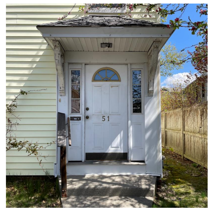
Entry of 51 Kelley Street.

The house is side hall in form with the entry sheltered by a large door hood with original bracketed supports. The façade is asymmetrical with windows aligned to interior programming. The eaves have been boxed and