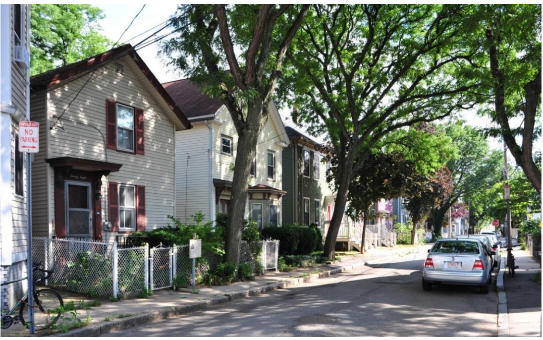
Even side of Union Street, looking south. #28 is at the far left. CHC photograph, July 2020

The zoning allowances of the C-1 zone, the presence of additional development potential on the site, and Cambridge's robust housing market will continue to put pressure on the property to be developed as fully as possible.