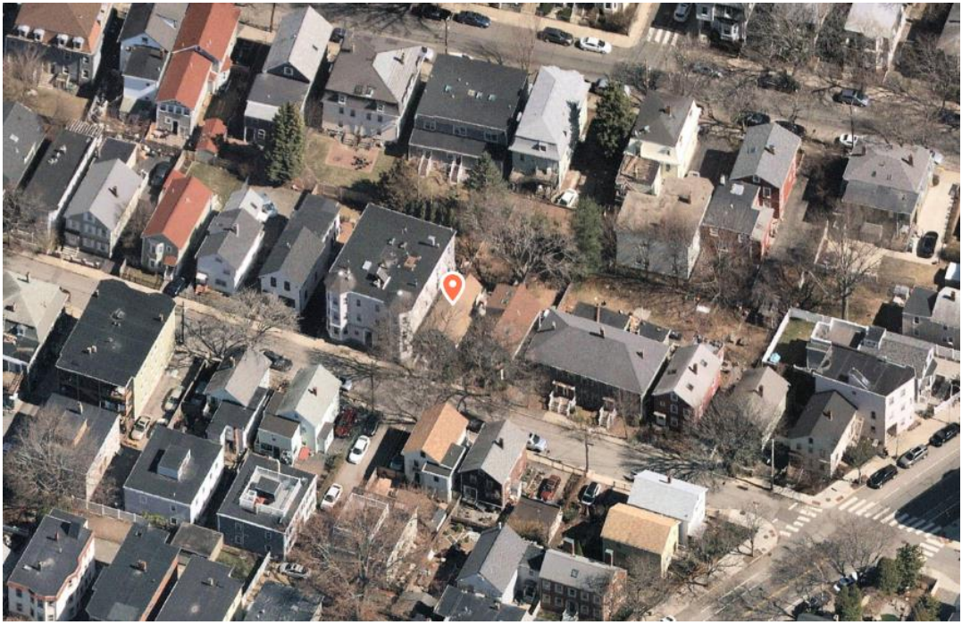
Environs of 28 Union Street (at center)