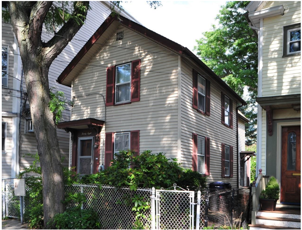
28 Union Street, west front and south side elevations.

The house is a modest example of the Italianate style of architecture in Cambridge. The 1^{3} - story house has a gable roof, oriented with its gable-end to the street. The pitch of the roof is not steep, and the second-floor windows are positioned very close to the eaves on the side elevation. The façade of the house is just two bays wide with the entrance at the far-left side and the first and second floor windows centered under the gable. Four symmetrically placed 2-over-2 double-hung wood sash windows light the south elevation of the front part of the house. The front door is covered with a small flat roof supported by two ornamental brackets. A 1^{1} -story ell extends on the east end of the house. A tall chimney is located on the north side of the house. The house is organized in a side-hall plan, with a staircase just inside the front door and a front parlor to the right.