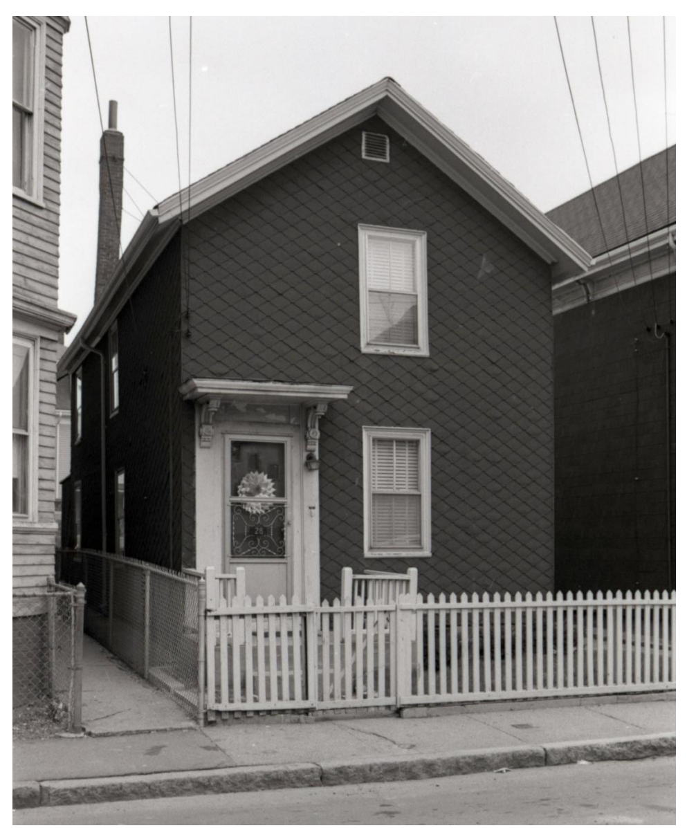
CHC survey photo of 28 Union St. Winter 1966-67.

The previous owner undertook some major interior work during her occupancy of the house including re-framing the roof and raising the ceilings upstairs. She also removed the horse-hair plaster from the walls, reinforced the framing where needed, and insulated with fiberglass batting. The original wood windows were repaired, and their sash cords replaced with chains. Her letter to the Commission details other features such as wallpaper and framing members.