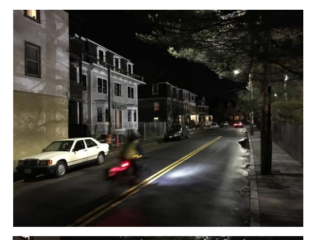
Willard Street when our lights are on

The current lamps do not control the light very well and they allow significant light spillage especially along Willard Street; the proposed LED technology directs the light to the courts and the lights are shielded to prevent stray light.