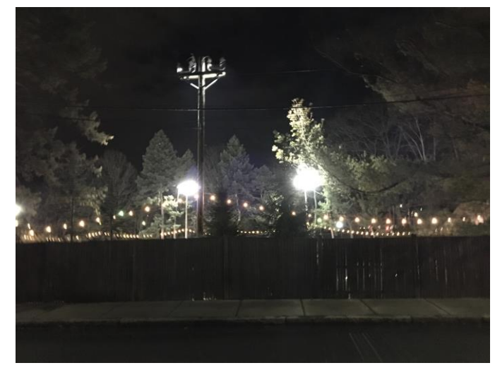
Trespassing light comes from poles on the east side of our property