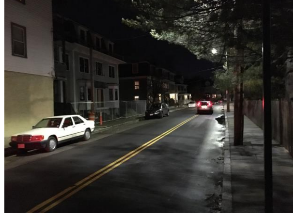
Willard Street when our lights are off