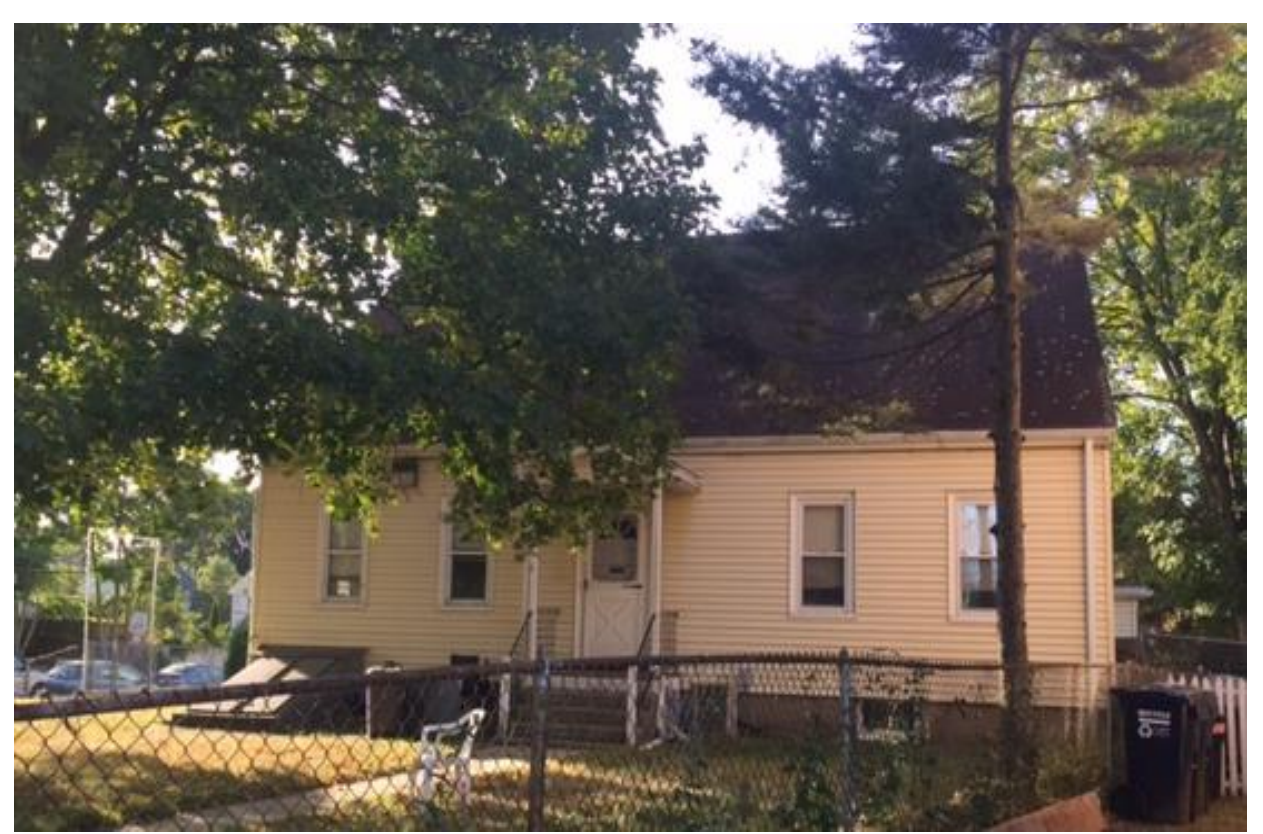
Wyeth Tenant House, Vineyard Street elevation