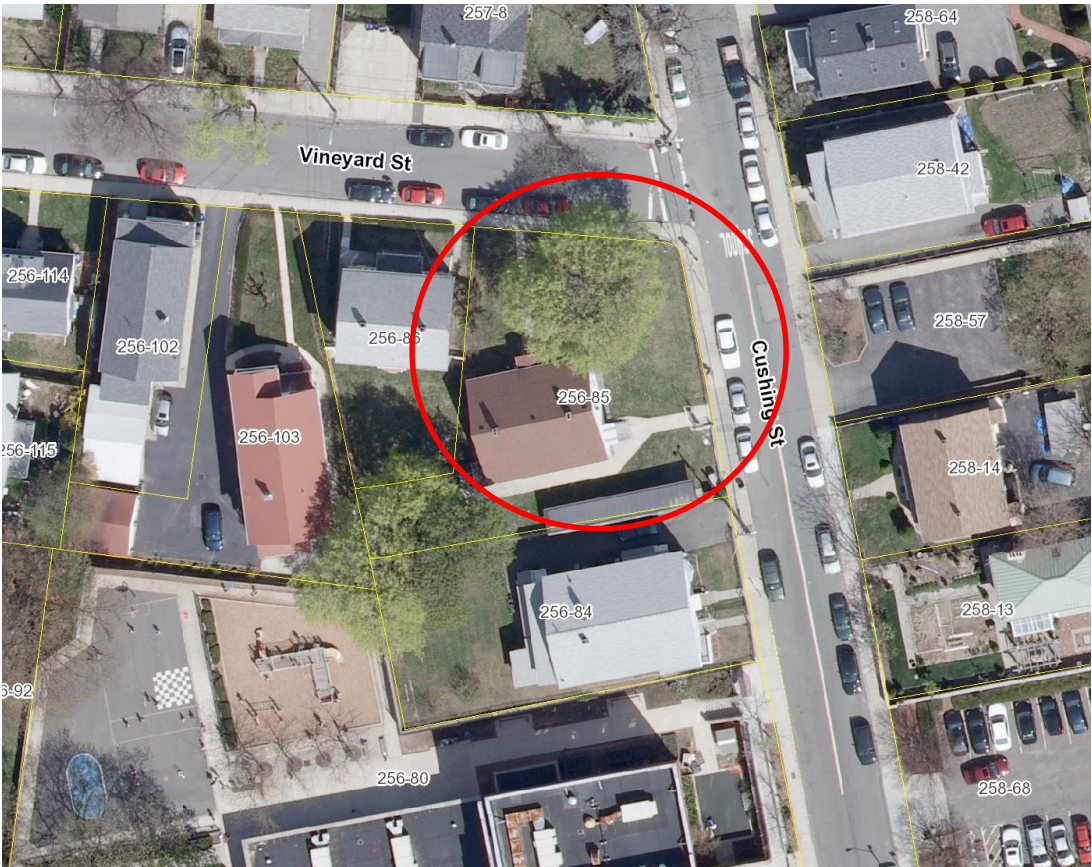
136-138 Cushing Street