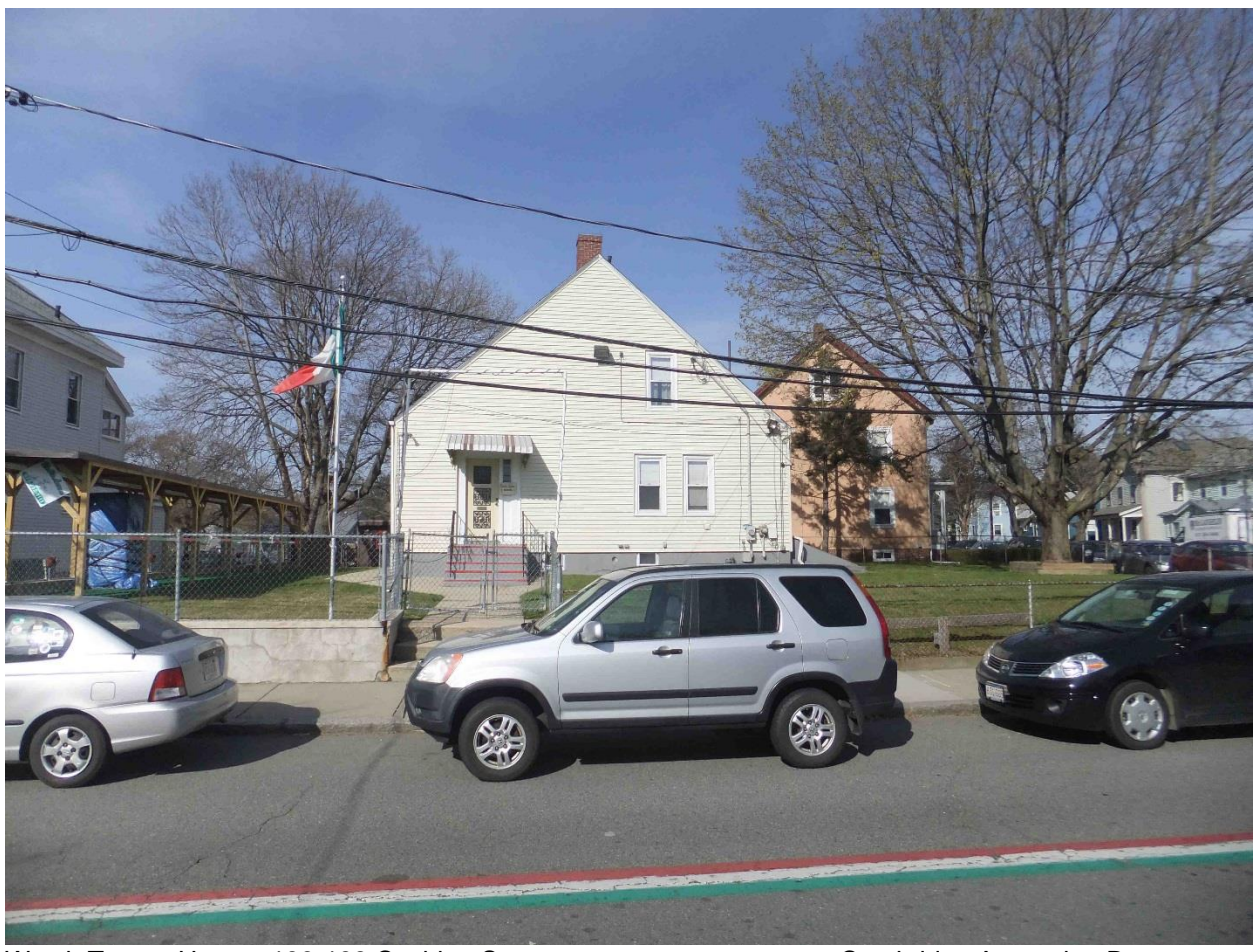
Wyeth Tenant House, 136-138 Cushing Street

An application to demolish the building at 136-138 Cushing Street (with an alternate address for 138 Cushing as 6 Vineyard Street) was received on September 9. The applicant, MacArthur Construction Company, was notified of an initial determination of significance and a public hearing was scheduled for October 1.