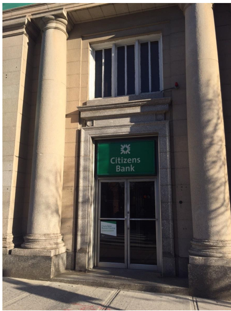
227 Cambridge St. entry on south front.