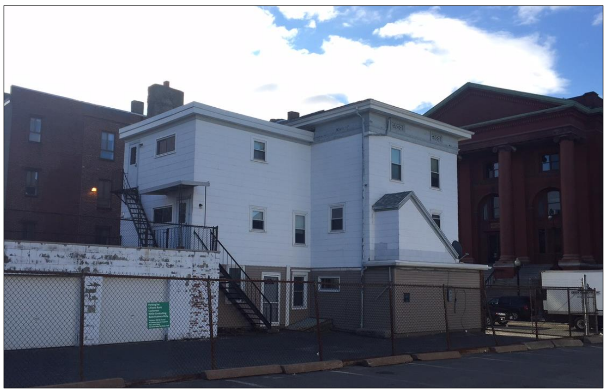
207 Cambridge Street rear and west side. CHC staff photo, 2016.