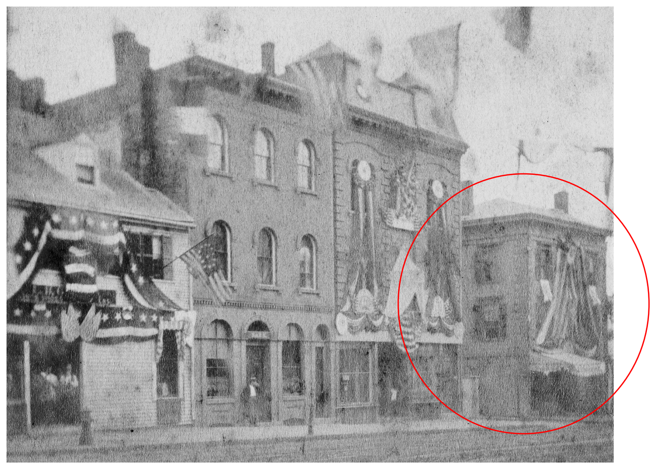
207 Cambridge St (circled), 217 Cambridge St., 221 Cambridge St., and 227 Cambridge St. (far left)