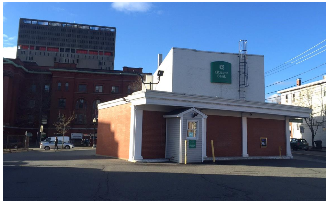
227 Cambridge St. north elevation from parking lot. Registry of Deeds and courthouse/jail in background.