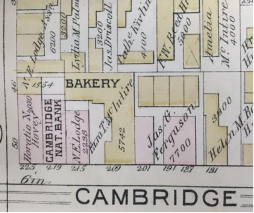
1873 Atlas detail showing bakery and residence at 209 Cambridge Street.

207 Cambridge Street was sided with asbestos shingles in 1943 and the eastern portion of the hipped roof was raised 1963 with zoning approval. The building is in average condition but its exterior character has been diluted by the white siding, replacement windows, and brick storefront. Because of the demolition of the buildings on either side it stands alone in a sea of pavement.