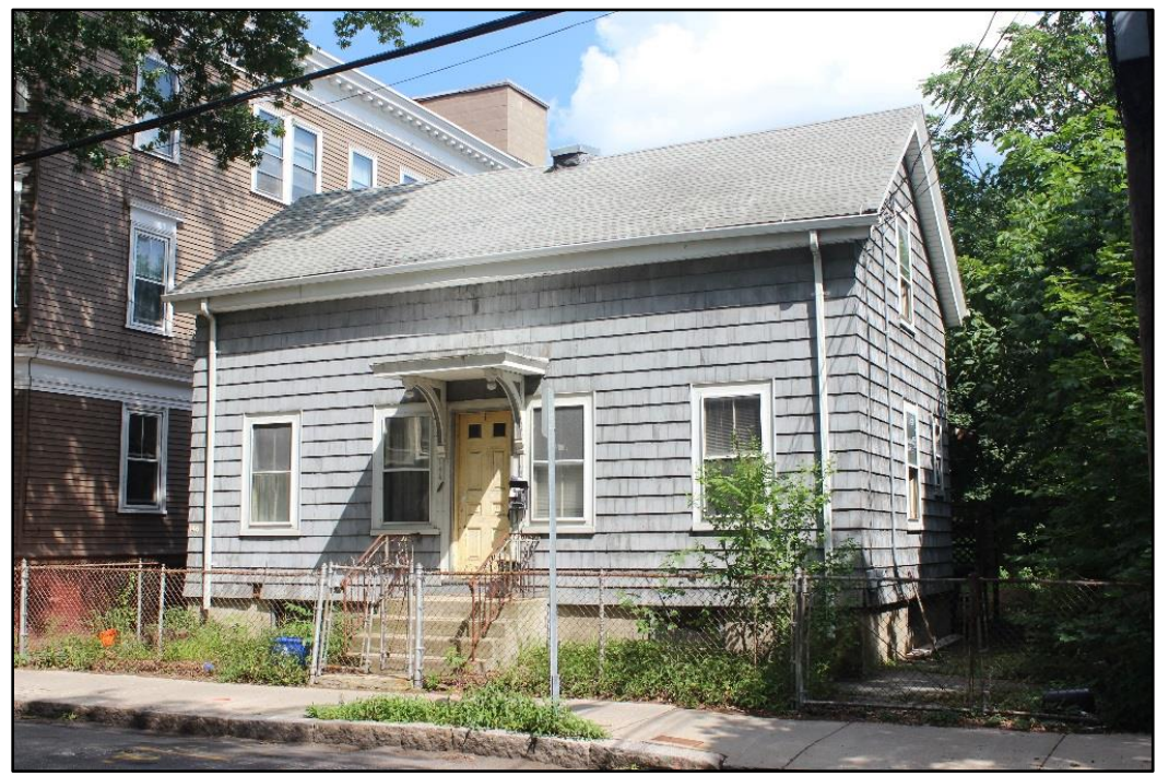
146-148 Pearl St., 2016

The Dalton house occupies a 4,151 square-foot lot (94/182) on the east side of Pearl Street, midway between Decatur and Valentine streets. This lot measures only 45' wide at the front and 37' wide at the back of the lot, which is 100' deep. The house is a 1½-story frame building with a side facing gable roof. The zoning is Residence C, a multi-family housing district that requires 1,800 square feet per dwelling unit. The FAR and height limits in this district are 0.60 and 35 feet. The assessed value of the land and building, according to the Assessors database, is $693,100 - $135,200 for the house, and $557,900 for the land. The property sold in April 2015 for $641,500.