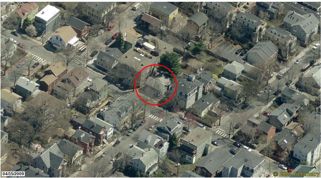
146-148 Pearl Street and environs