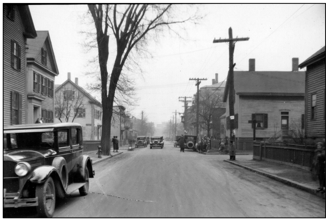
Pearl at Decatur, 1932. Engineering Dept. Collection, CHC Two double workers' cottages at 132 and 138 Pearl Street are visible at the right in this photo.