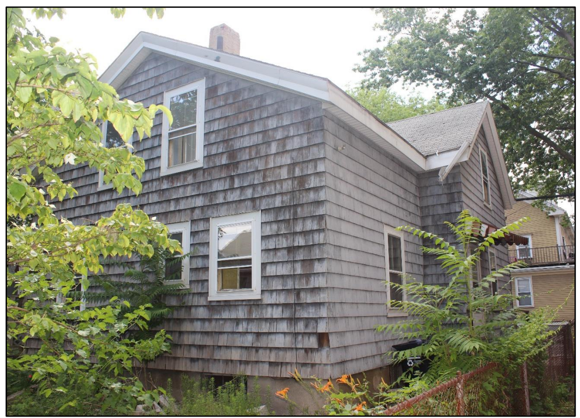
Rear of 146-148 Pearl St., 2016

The house is in fair condition. The roof and walls appear sound, but a former hoarding situation required considerable remediation on the interior of the house after the former occupants moved out. Aluminum gutters are present on the front of the building but is damaged at the northeast corner at the intersection of the main block and the ell. The typical settling and framing issues of an older home are also present here.