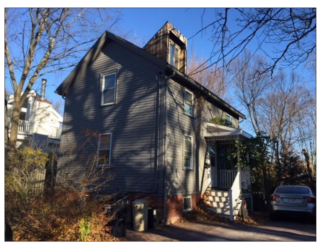
South and east sides of 7 Kelley Street.

The 3-bay workers cottage at 7 Kelley St. was constructed in 1871. This house shares features characteristic of many workers cottages built in the brickyard subdivisions of north and west Cambridge including a raised brick basement, limited fenestration on the north (rear) wall, chimneys on the north wall, and a gable roof oriented with its end facing the street. The house has clapboarded walls, narrow corner boards, a modern dormer on the south face of the gable roof, and the center entrance is located on the south wall facing the side yard.