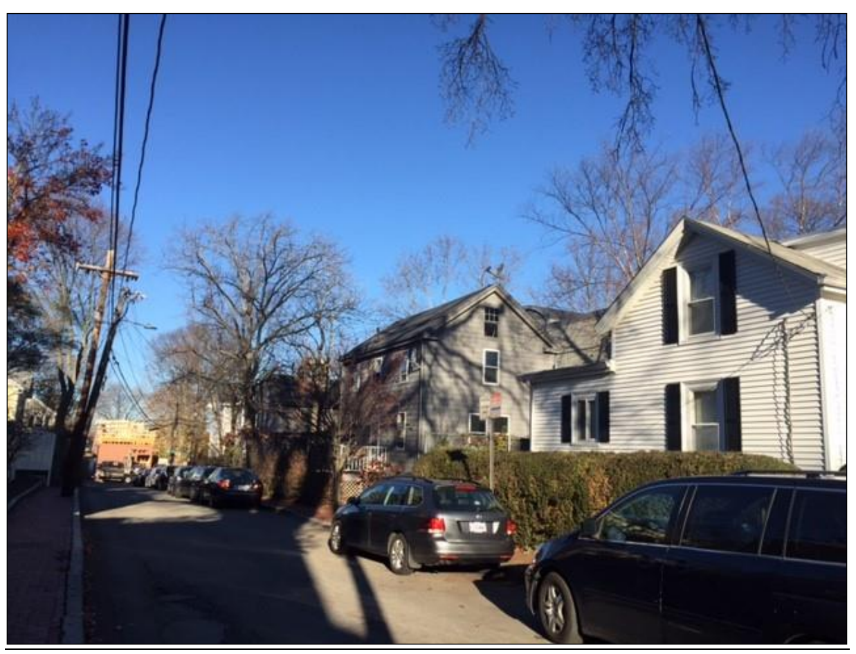
East side of Kelley Street, looking north. #21 on right and #15 at center and #7 in distance.