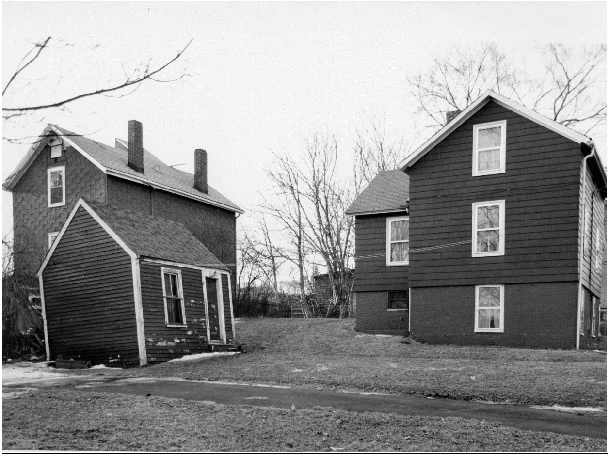
View from east of 1 (right) and 7 (left) Kelley Street with shed, ca. 1970. The house at 1 Kelley was demolished without a permit in 1990, a violation of the city's demolition delay ordinance, which led to a two year moratorium of the site. The house was eventually replaced with two attached single family townhomes (10 and 14 Donnell Street) of contemporary design.