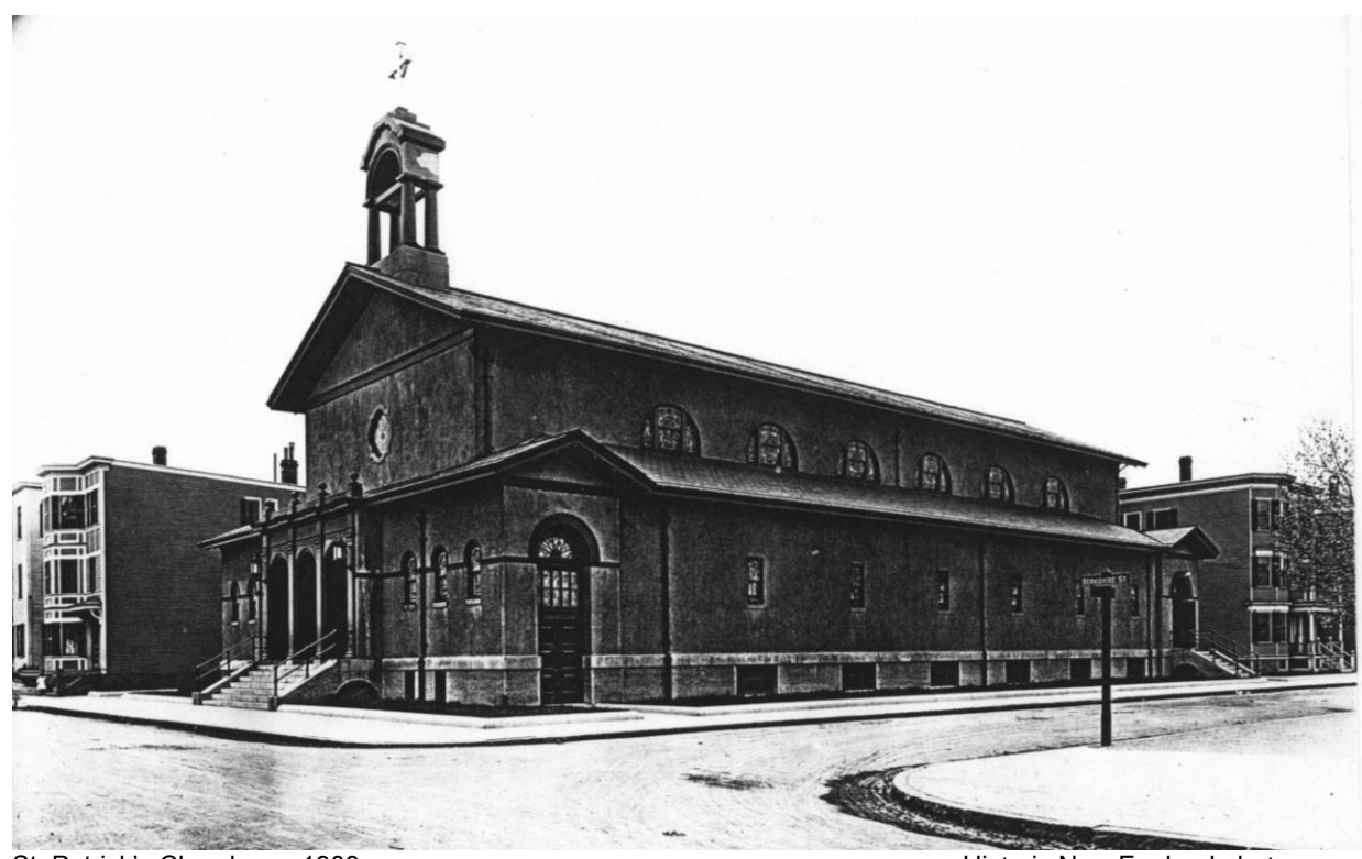
St. Patrick's Church, ca. 1909

accommodate 1200 worshippers. A choir loft was located over the vestibule of the main entrance and an elliptical apse and two sacristies were at the opposite end. The center of the sanctuary was 40' high and lit by large arched windows at a clear story level. Two side aisles had a lower ceiling and were lit with small rectangular windows along the length of the building. The church was also fitted with electrical incandescent lighting fixtures by the Pettingell-Andrews Company.