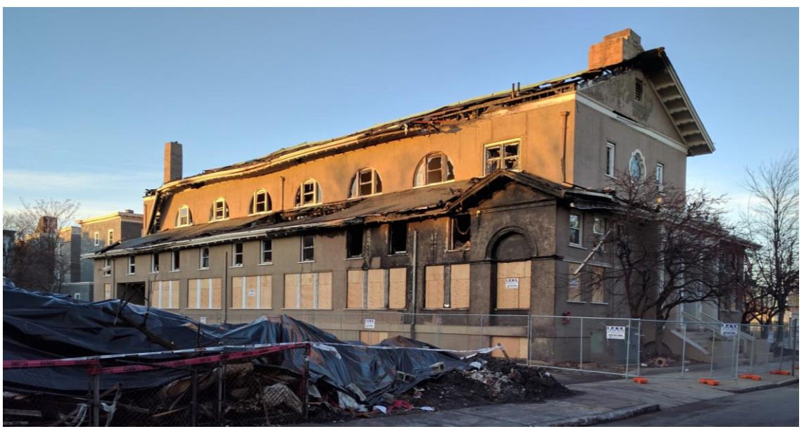
St. Patrick's Church, Jan. 2017