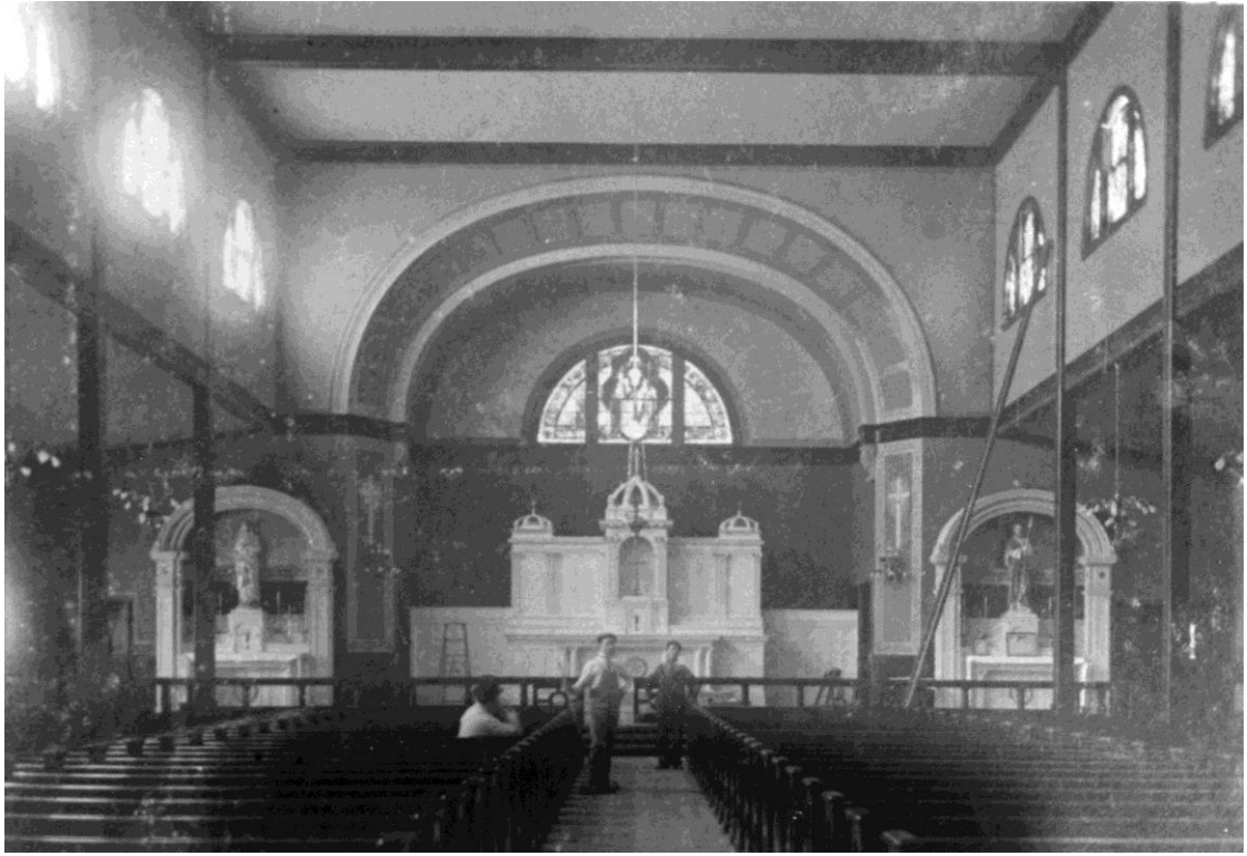
St. Patrick's Church interior, ca. 1909