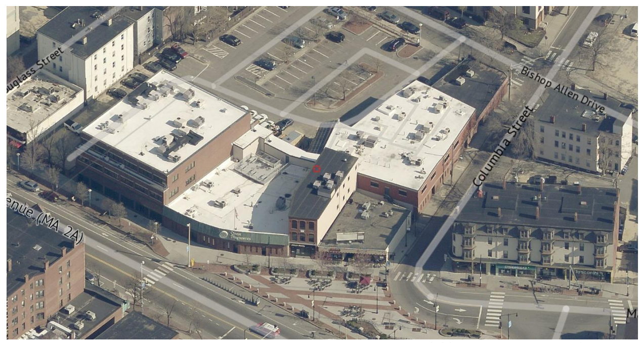
Cambridge GIS/CONNECTExplorer, 2014

The Mass+Main project will consist of three buildings on two separate sites. A tower on Massachusetts Avenue and a six-story building on Columbia Street will contain 285 apartments. A separate property on Bishop Allen Drive (now a parking lot) will contain 23 units; 20% of the 308 units will be affordable or reserved for middle-income tenants. The Massachusetts Avenue frontage and a passageway leading to the municipal parking lot will be lined with retail spaces. The entire project will contain 307,000 square feet of mixed uses.