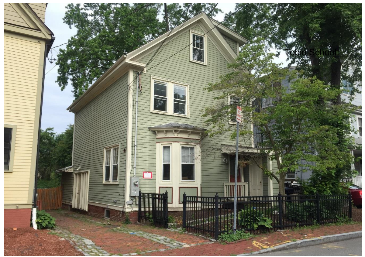
29 Bellis Circle, south and east elevations