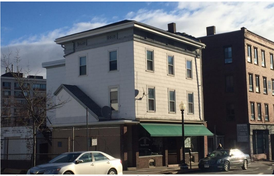
207 Cambridge Street front and west side. CHC staff photo, 2016.

This 3-story mixed use building sits directly opposite the Middlesex County South Registry of Deeds. It has a low hip roof, large frieze band, and wide eaves. The fenestration is divided into three symmetrical bays on the upper two floors and the ground floor is finished with a modern brick storefront. An enclosed stair tower was added along the west elevation. The main block of the building is 36' wide and 22' deep. At the rear is a 3-story ell measuring 20' square. The building is covered with asbestos shingle siding, but an 1875 stereopticon photo depicts the original Italianate detailing including quoins, flanking chimneys, shutters, window trim, and possibly window hoods. The masonry wall on the east side served as a fire wall for this building and the former building at 203 Cambridge Street (a 4-story brick commercial building built in 1889 and demolished 1976).