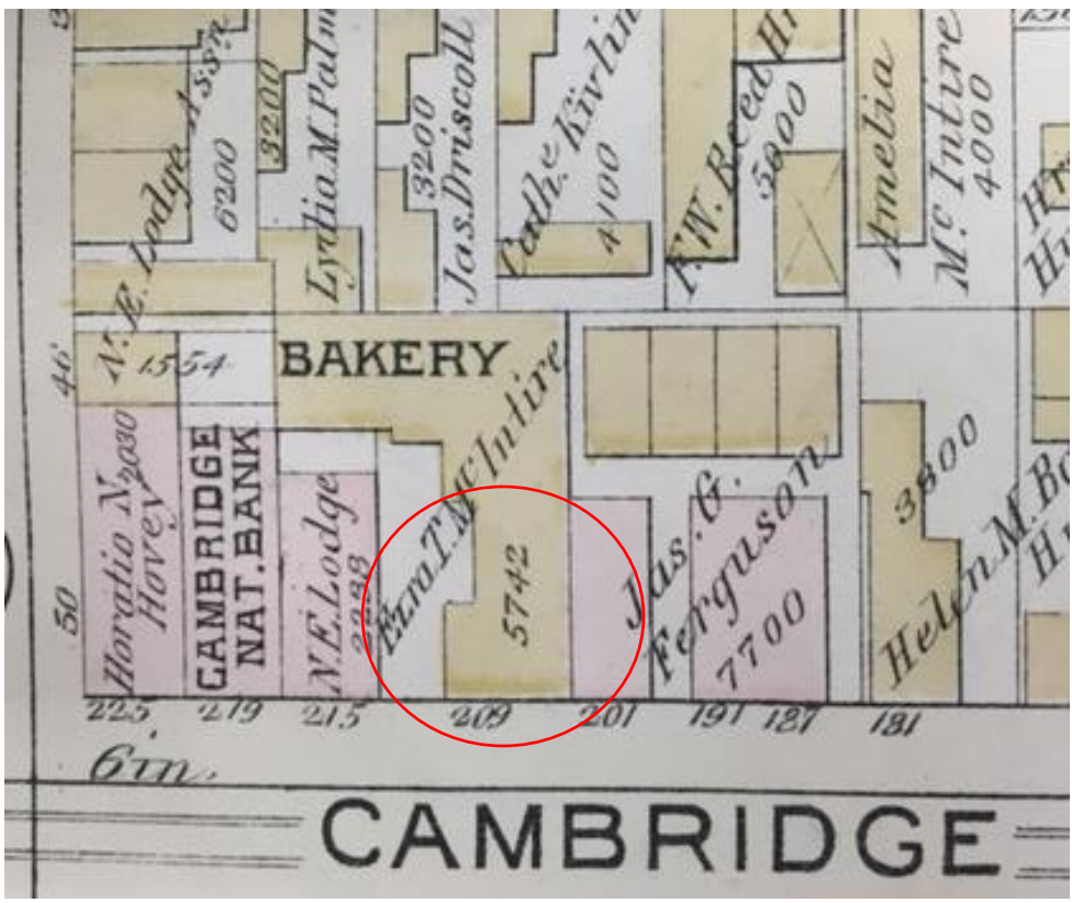
1873 Atlas detail showing bakery and residence at 209 Cambridge Street.