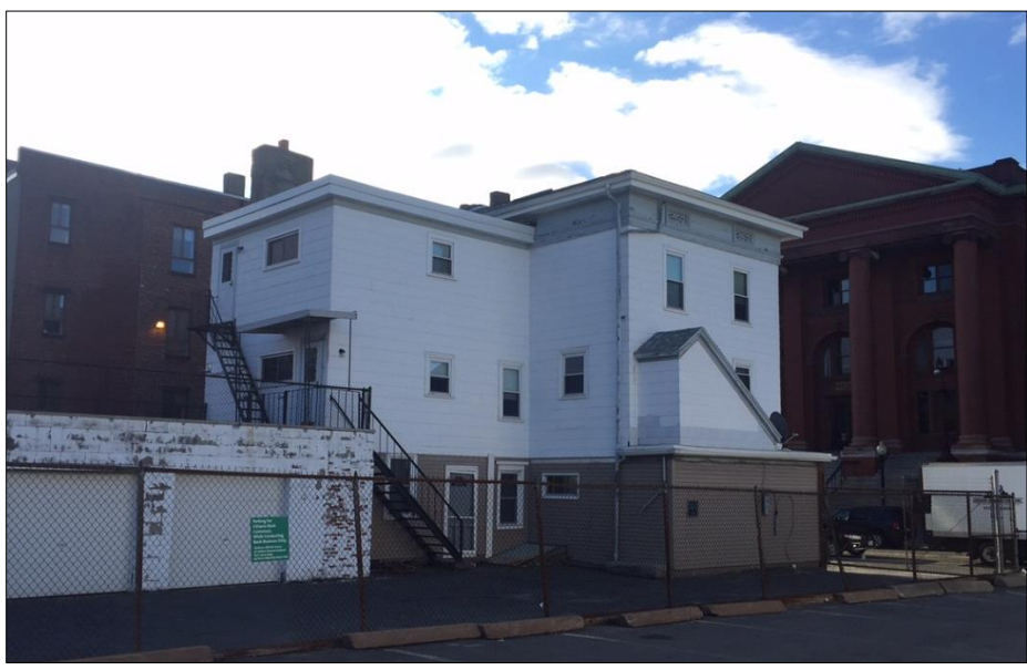
207 Cambridge Street rear and west side. 2016.