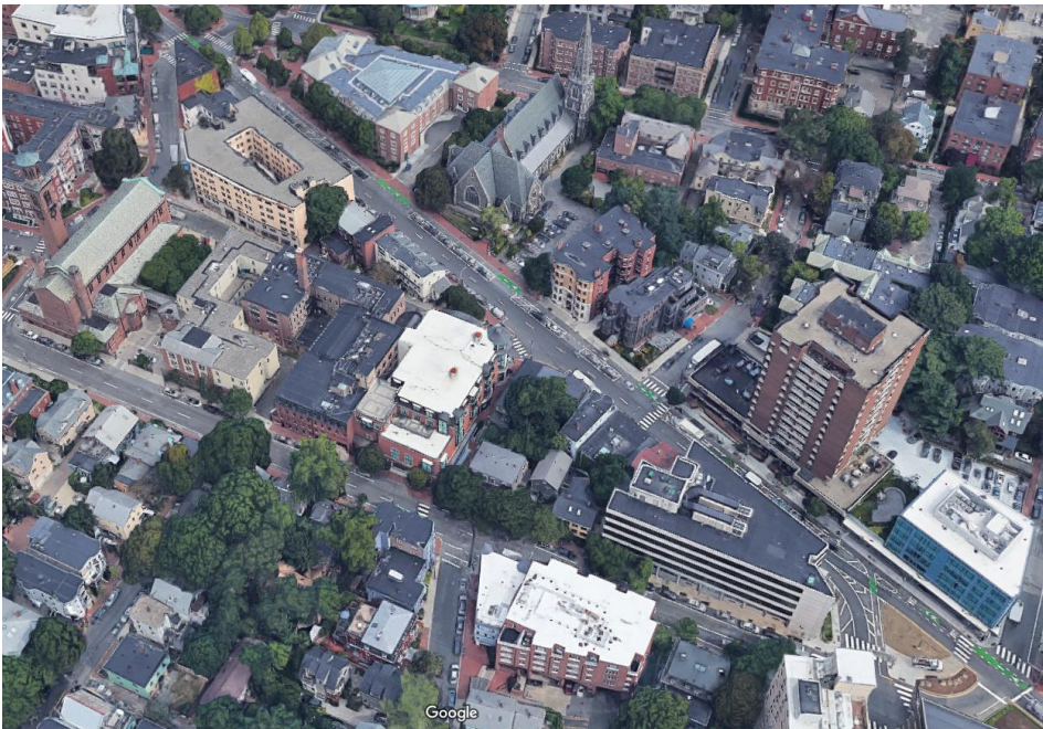
Bow and Arrow Streets/Putnam Square Subdistrict