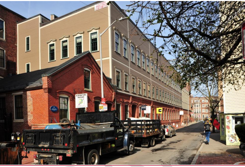
Reversible Collar complex, Arrow Street