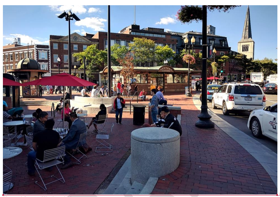
Harvard Square Kiosk and Plaza

The plaza around the kiosk was designed by the MBTA in 1979-80 and completed in 1984. The design vocabulary — wire cut brick sidewalks, granite feature strips and bollards, and Washington-style light fixtures — was carried over to the west side of the Square and down Brattle and Eliot streets to Bennett Street. The sidewalks from Church Street to Bennet Street were rebuilt with clay pavers for enhanced accessibility about 2010. Forbes Plaza was reconstructed in 2017-18 pursuant to a Certificate of Appropriateness. The plaza around the headhouse and the kiosk itself are in the later stages of a redesign to enhance accessibility and provide greater public access to these assets. Materials and construction details