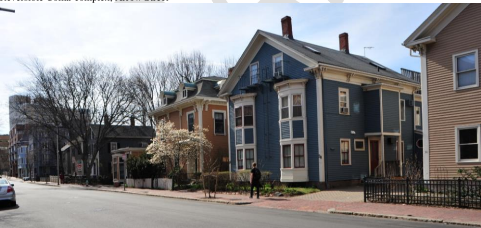
12-30 Mt. Auburn Street

Restoration and/or renovation potential exists in this subdistrict. Prime candidates include the triple-decker residence at 1131 Massachusetts Avenue at the corner of Remington Street the Hong Kong restaurant at 1234-1238 Massachusetts Avenue, Longfellow Court at 1200 Massachusetts Avenue, and the frame and brick rows at 1156-1166 and 1168-1174 Massachusetts Avenue.