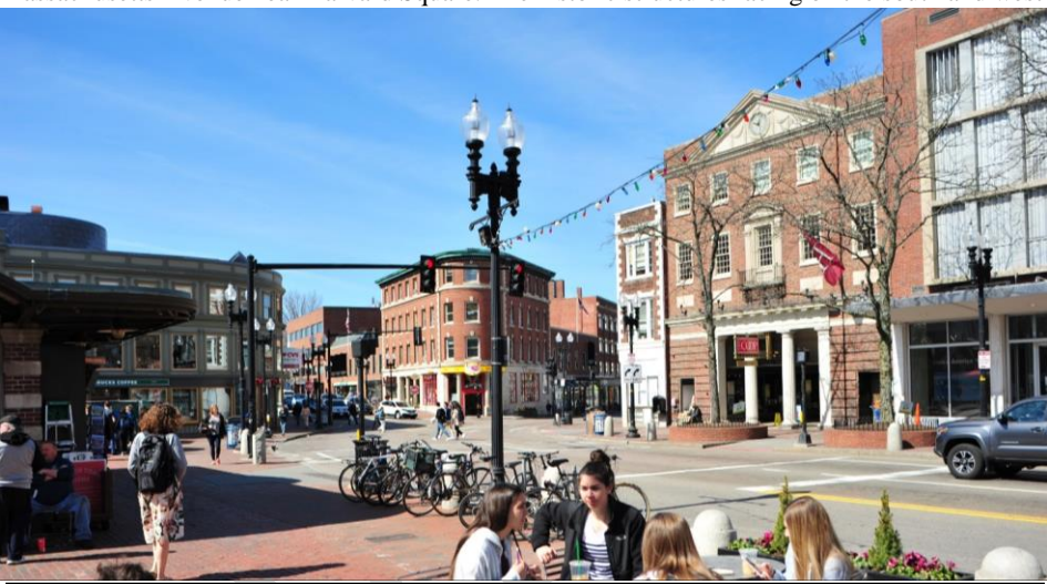
Harvard Square, with the Abbot Building (center)

Three- to five-story structures built out to the sidewalk predominate the south and west sides of Massachusetts Avenue near Harvard Square. The historic structures facing on the south and west