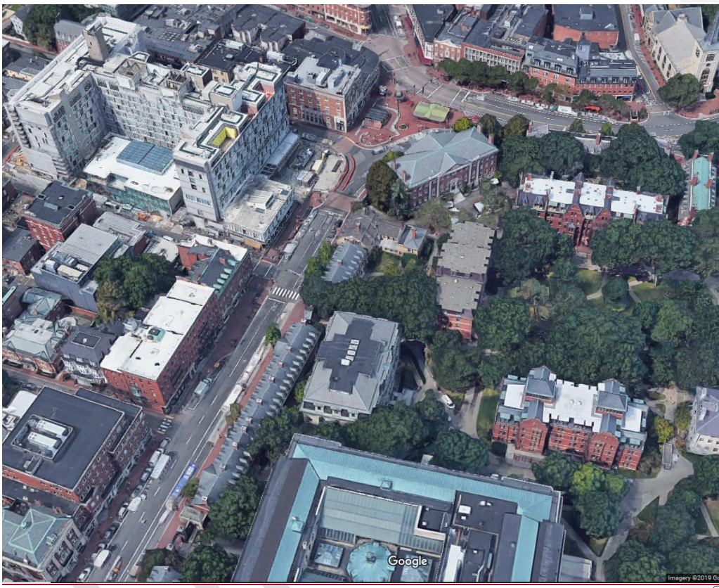
Subdistrict A: Harvard Square/Massachusetts Avenue

<u>Harvard Square subdistrict</u> Formatted: Font: 10 pt