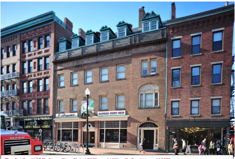
The Fairfax (1886), Porcellian Club 1890), and Hilliard's Bookstore (1827)

As evidenced by the recent Read Block development (1997) proposal and the recently-approved redevelopment of the Abbot Building, large resubstantial development potential does-still exists in the heart of the Square and along Massachusetts Avenue. Rehabilitation of existing structures