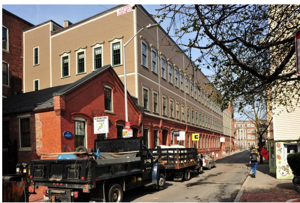
Reversible Collar complex, Arrow Street