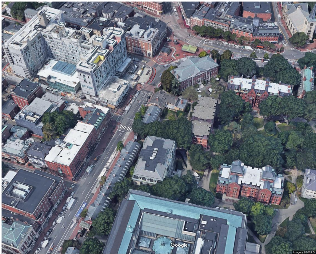
Subdistrict A: Harvard Square/Massachusetts Avenue