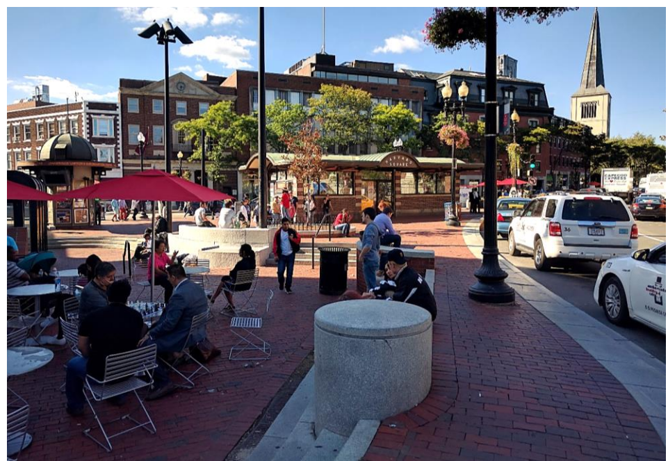
Harvard Square Kiosk and Plaza

The plaza around the kiosk was designed by the MBTA in 1979-80 and completed in 1984. The design vocabulary – wire cut brick sidewalks, granite feature strips and bollards, and Washington-style light fixtures – was carried over to the west side of the Square and down Brattle and Eliot streets to Bennett Street. The sidewalks from Church Street to Bennet Street were rebuilt with clay pavers for enhanced accessibility about 2010. Forbes Plaza was reconstructed in 2017-18 pursuant to a Certificate of Appropriateness. The plaza around the headhouse and the kiosk itself are in the later stages of a redesign to enhance accessibility and provide greater public access to these assets. Materials and construction details