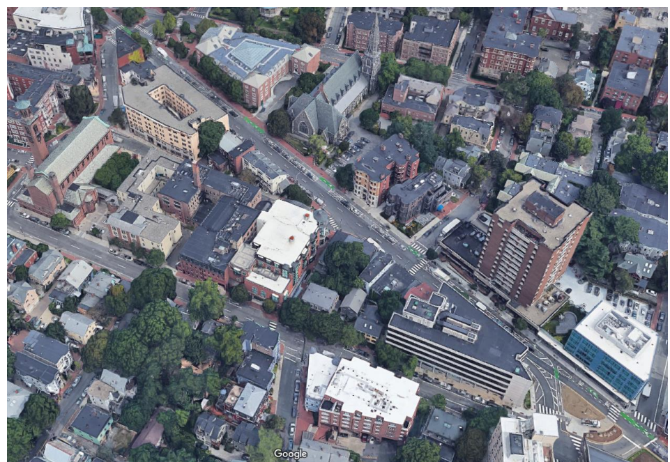
Bow and Arrow Streets/Putnam Square Subdistrict