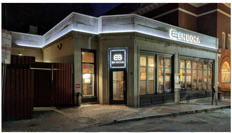
8 Holyoke Street (1927)

Historical photographs can often be valuable references during the design of facade restoration or rehabilitation projects. Investigation of the collections of the Historical Commission is a good starting point for this kind of historical research. The rehabilitation of the Read Block included restoration of the 1896 facade, renovation of the forward portions of the original structures, and construction of a new 3-story structure at the rear. The renovated space accommodates both retail and office uses.