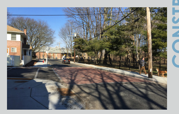
Raised intersections on Garden Street