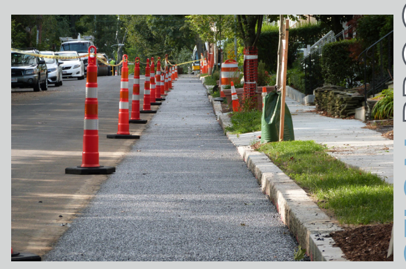
Porous pavement installation.

Curbing and roadway work along Huron Ave.