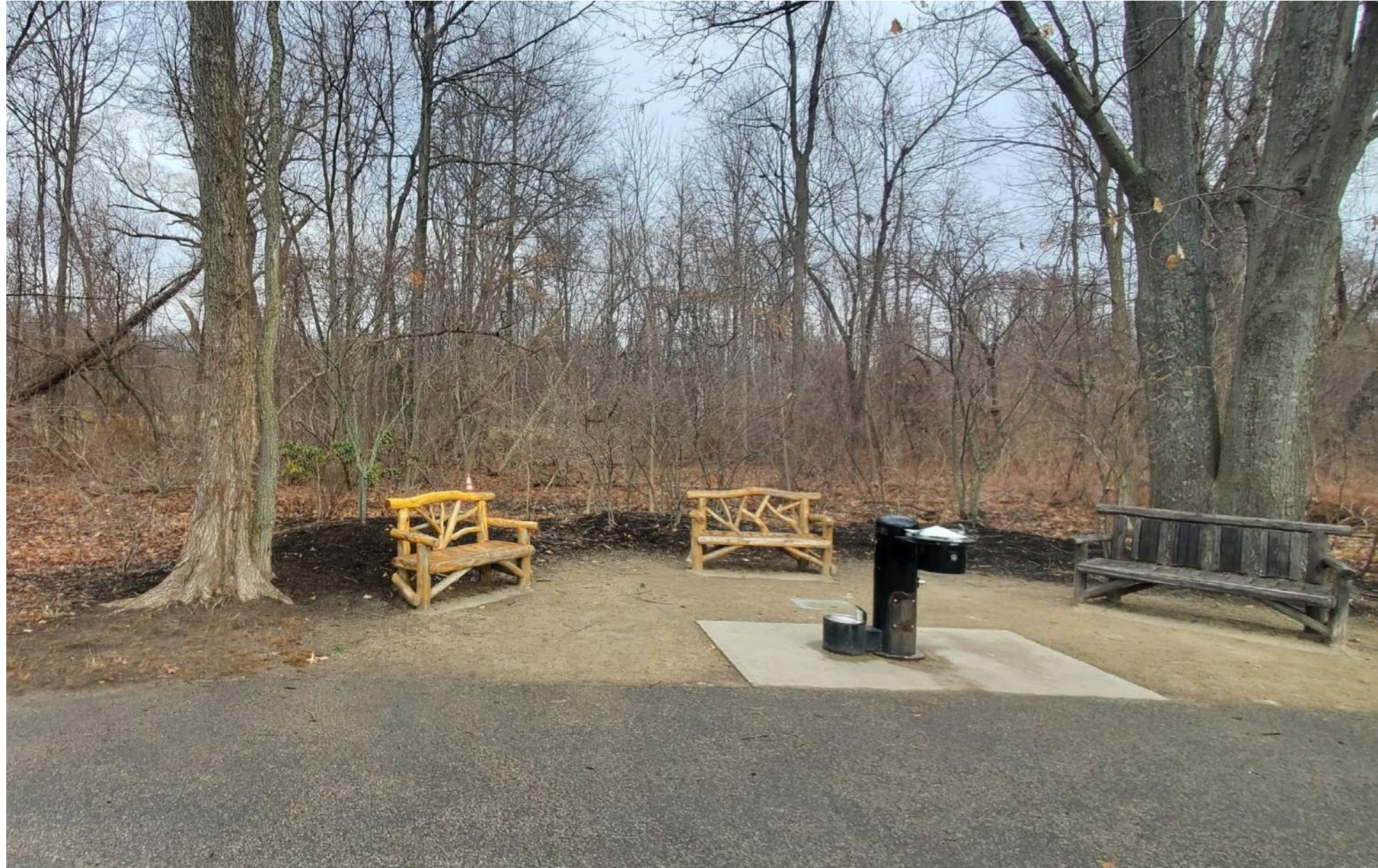
VIEW OF SEATING AREA & FOUNTAIN FROM OPPOSITE SIDE OF PERIMETER ROAD