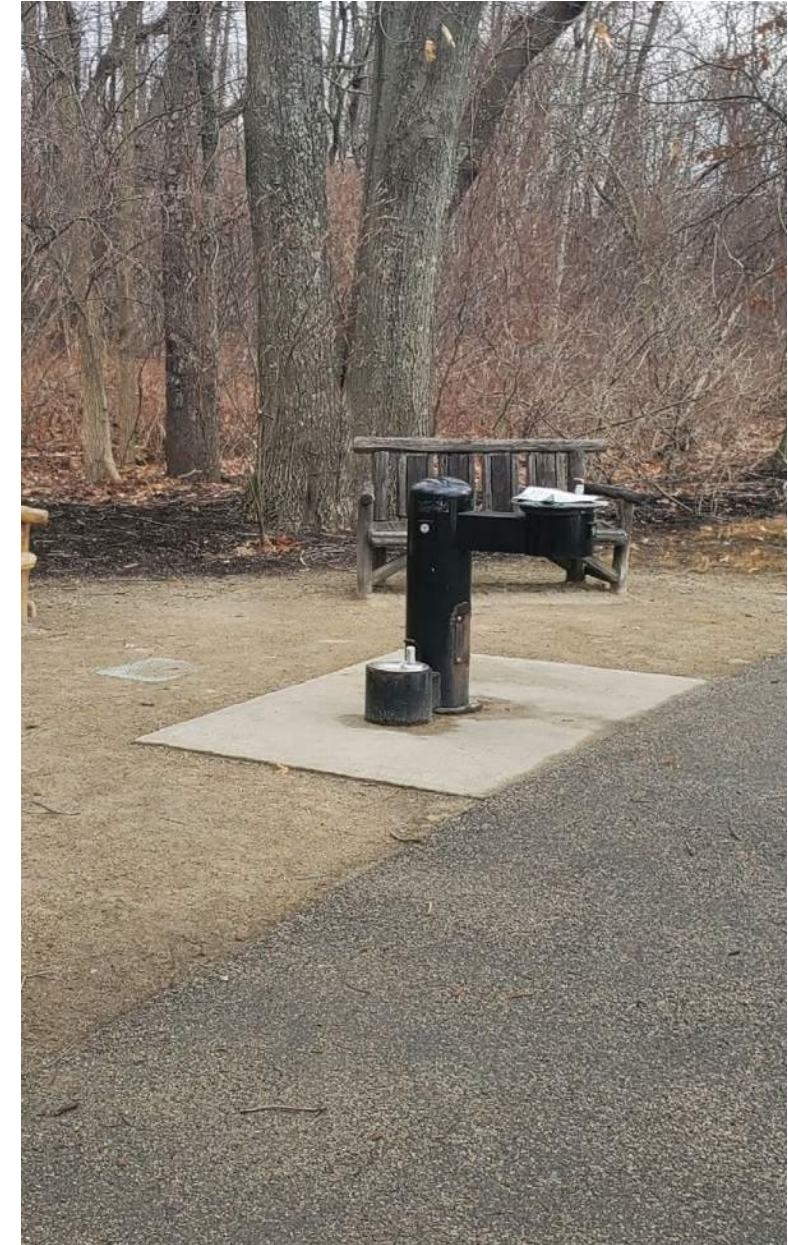
FOUNTAIN & SERVICE BOX