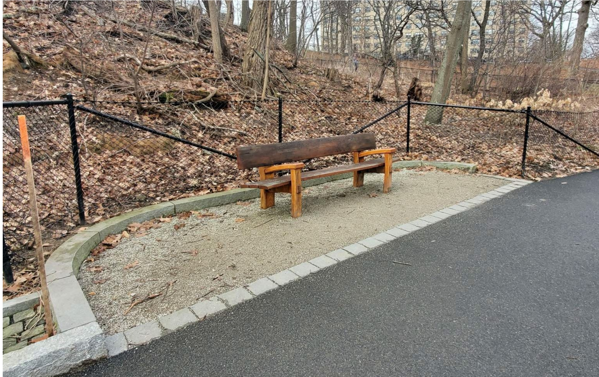
CUSTOM BENCH AND STA-LOK SURFACING ALONG PERIMETER ROAD