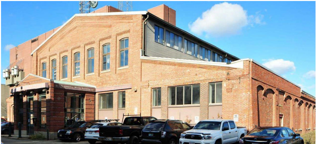
The Foundry today

Submit your qualifications online to the Cambridge Arts artist registry by September 17, 2018 to be considered for this commission.