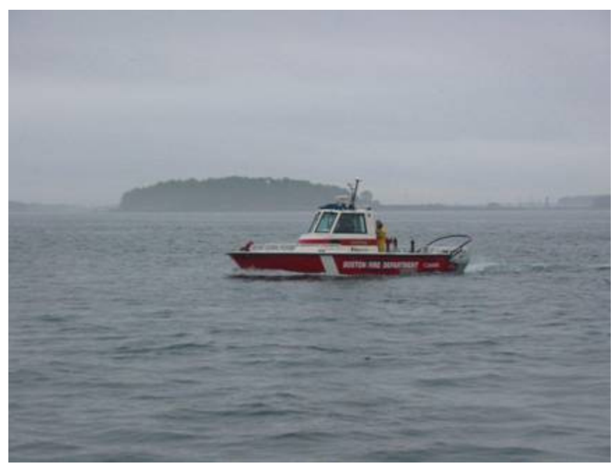
Boston Fire Marine unit.