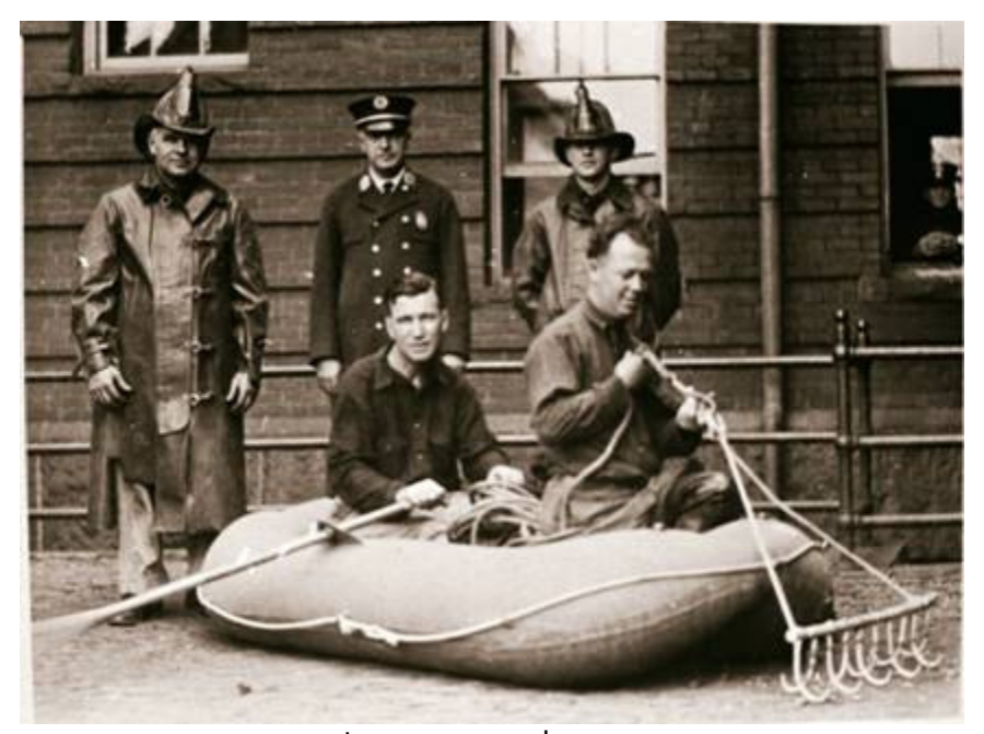
water rescue and recovery