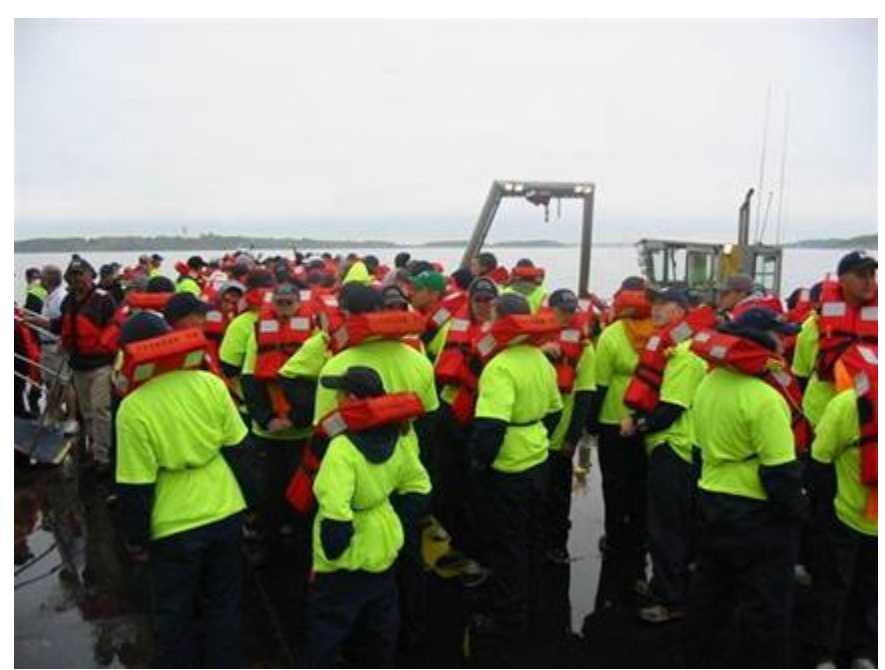
Massachusetts Maritime Academy students volunteered as "victims".