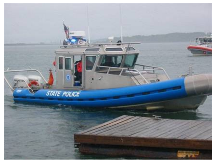
Massachusetts State Police