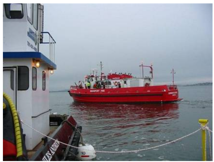
Logan Massport Fire Rescue Marine Unit