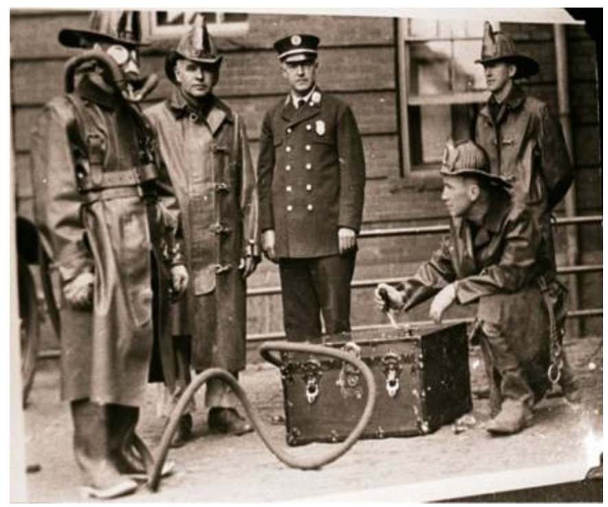
supplied air system