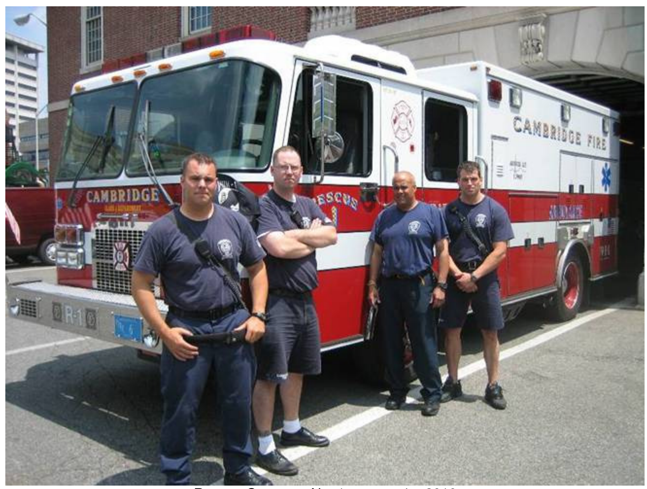
Rescue Company No. 1 - group 4 - 2010