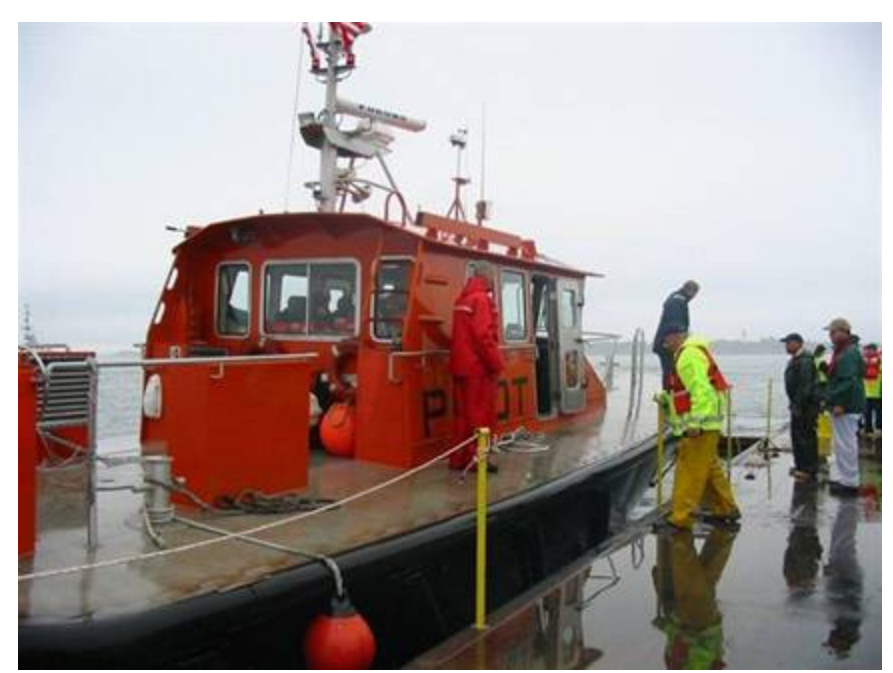
Boston Harbor Pilot boat