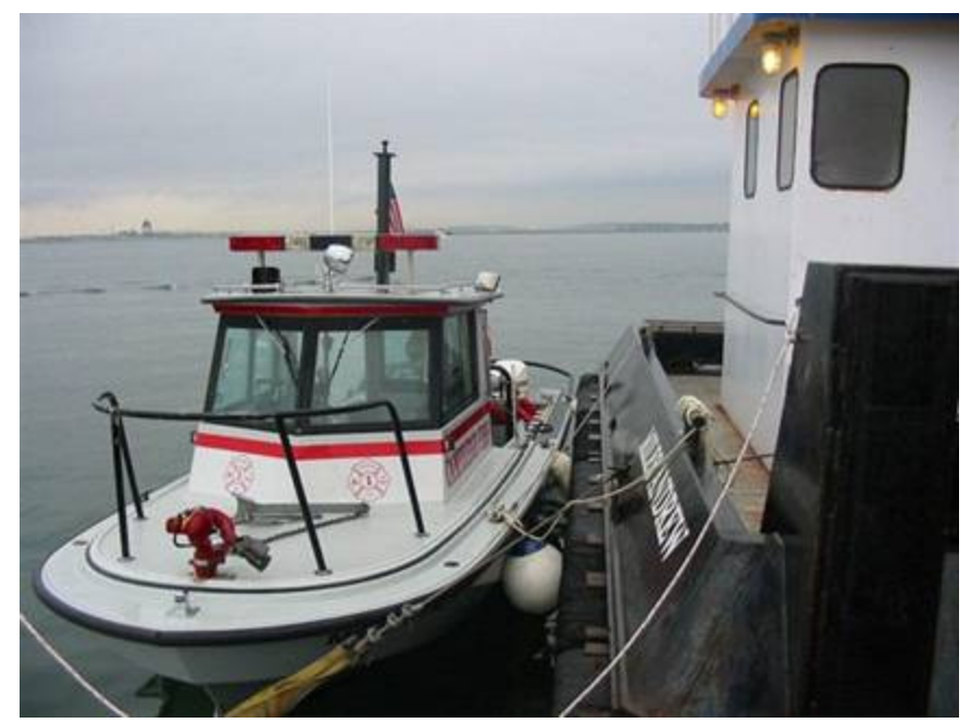
Cambridge Fire Marine 1