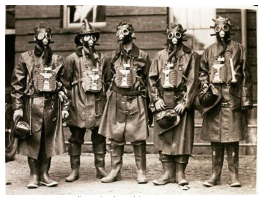
all-service breathing apparatus