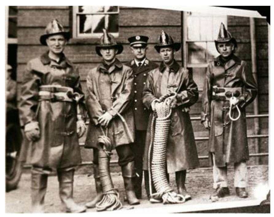
high-angle rescue and rappelling