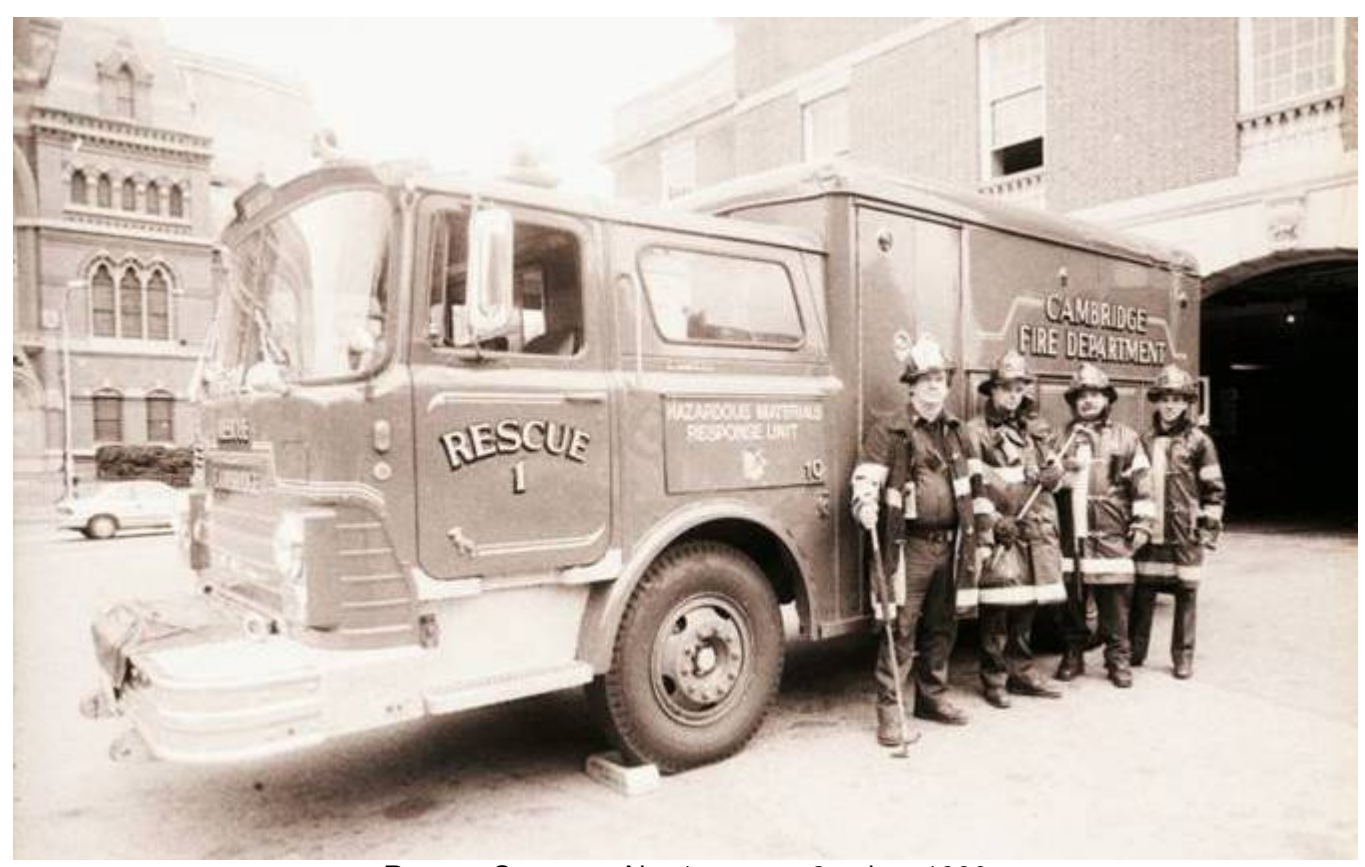
Rescue Company No. 1 – group 3 - circa 1990