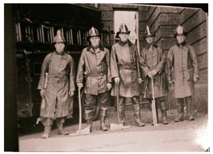
irons – search and forcible entry