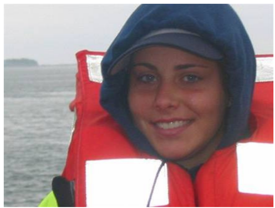
MMA student "victim" is a North Cambridge resident. All "victims" were successfully rescued.