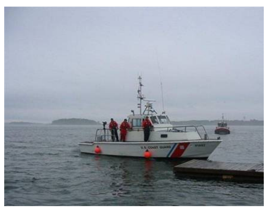
United States Coast Guard – 41 foot boat