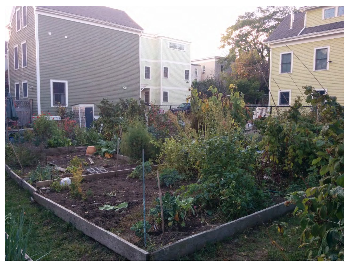
PEGGY HAYES COMMUNITY GARDEN, CAMBRIDGE