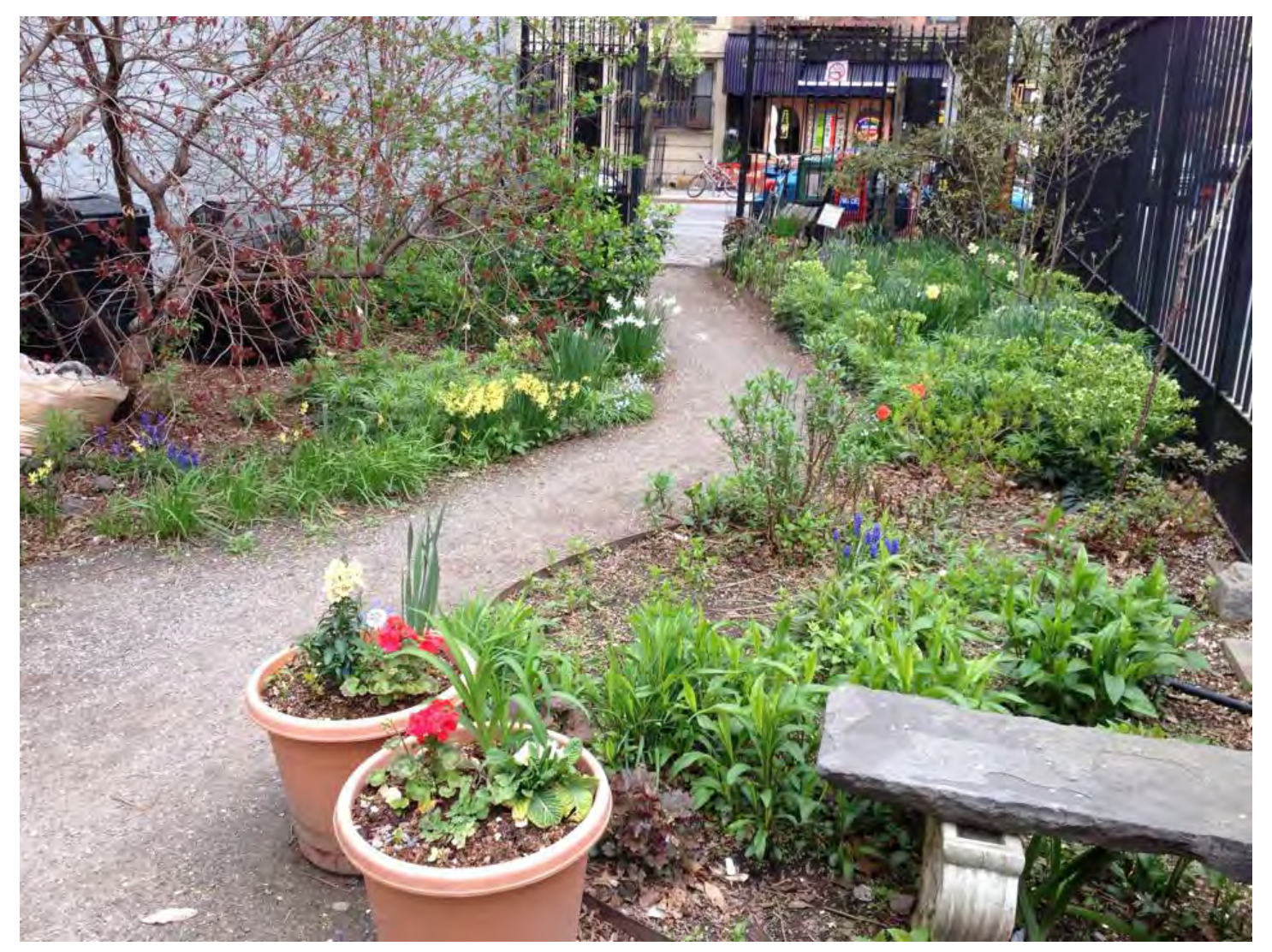
GREENSPACE @ PRESIDENT STREET, BROOKLYN, NYC