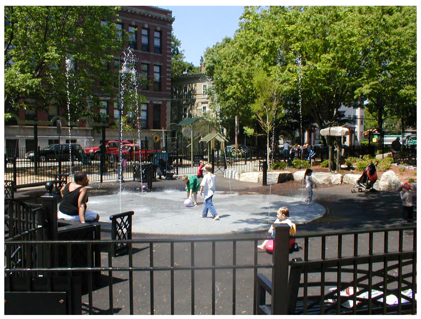
DANA PARK, CAMBRIDGE