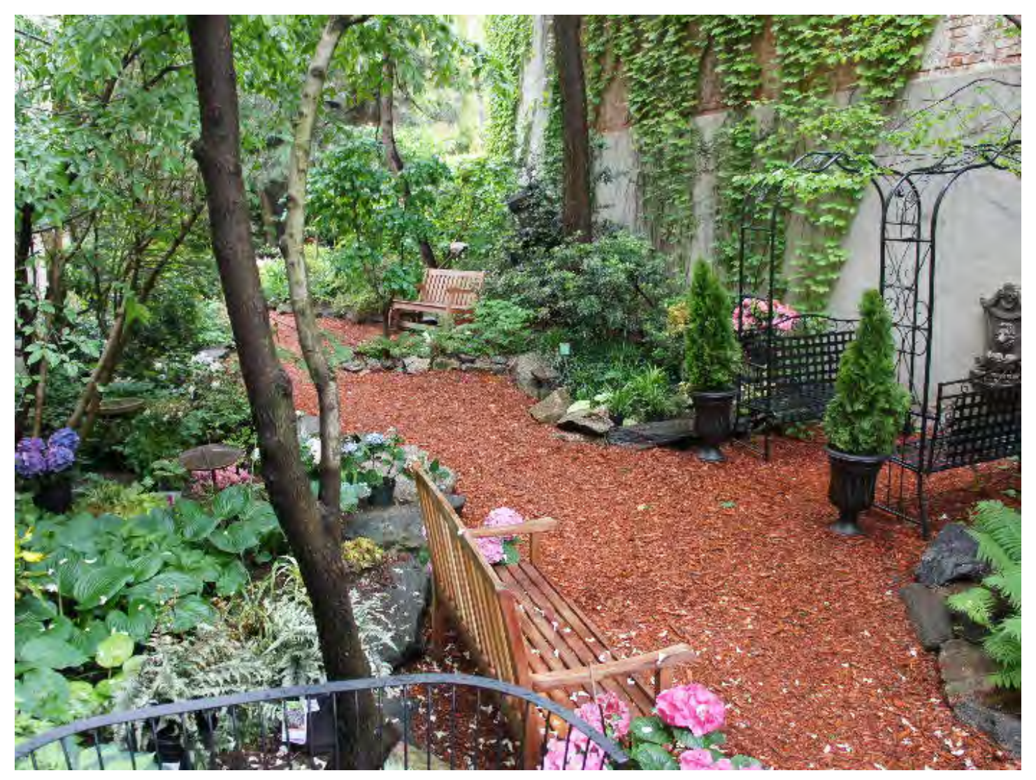
CREATIVE LITTLE GARDEN, MANHATTAN, NYC