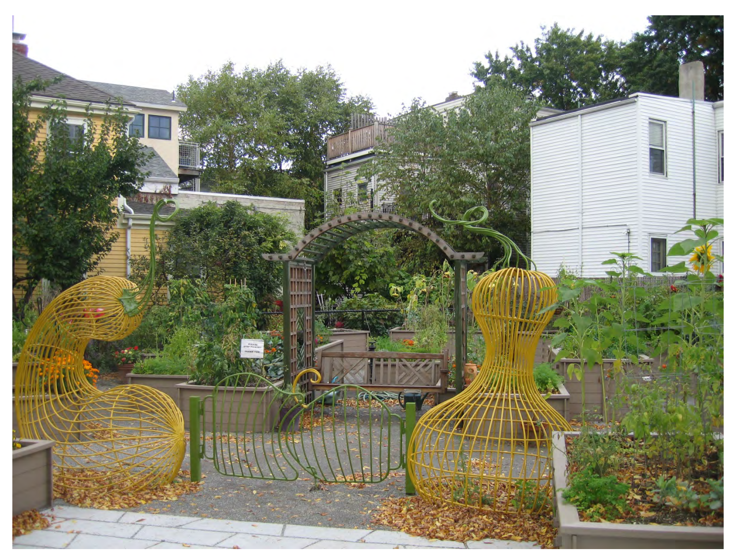
COSTA LOPEZ TAYLOR PARK AND COMMUNITY GARDEN, CAMBRIDGE