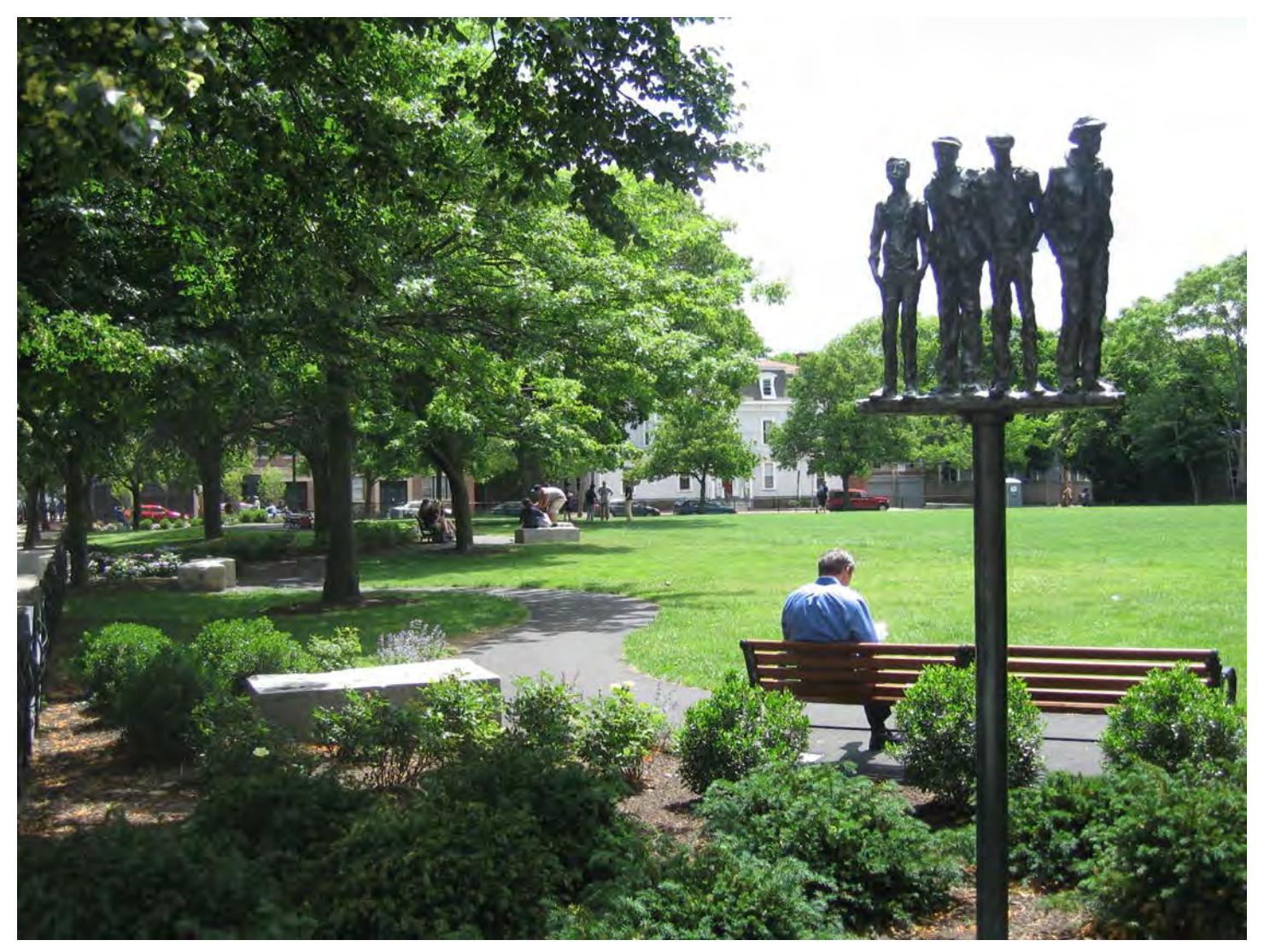
SENNOTT PARK, CAMBRIDGE