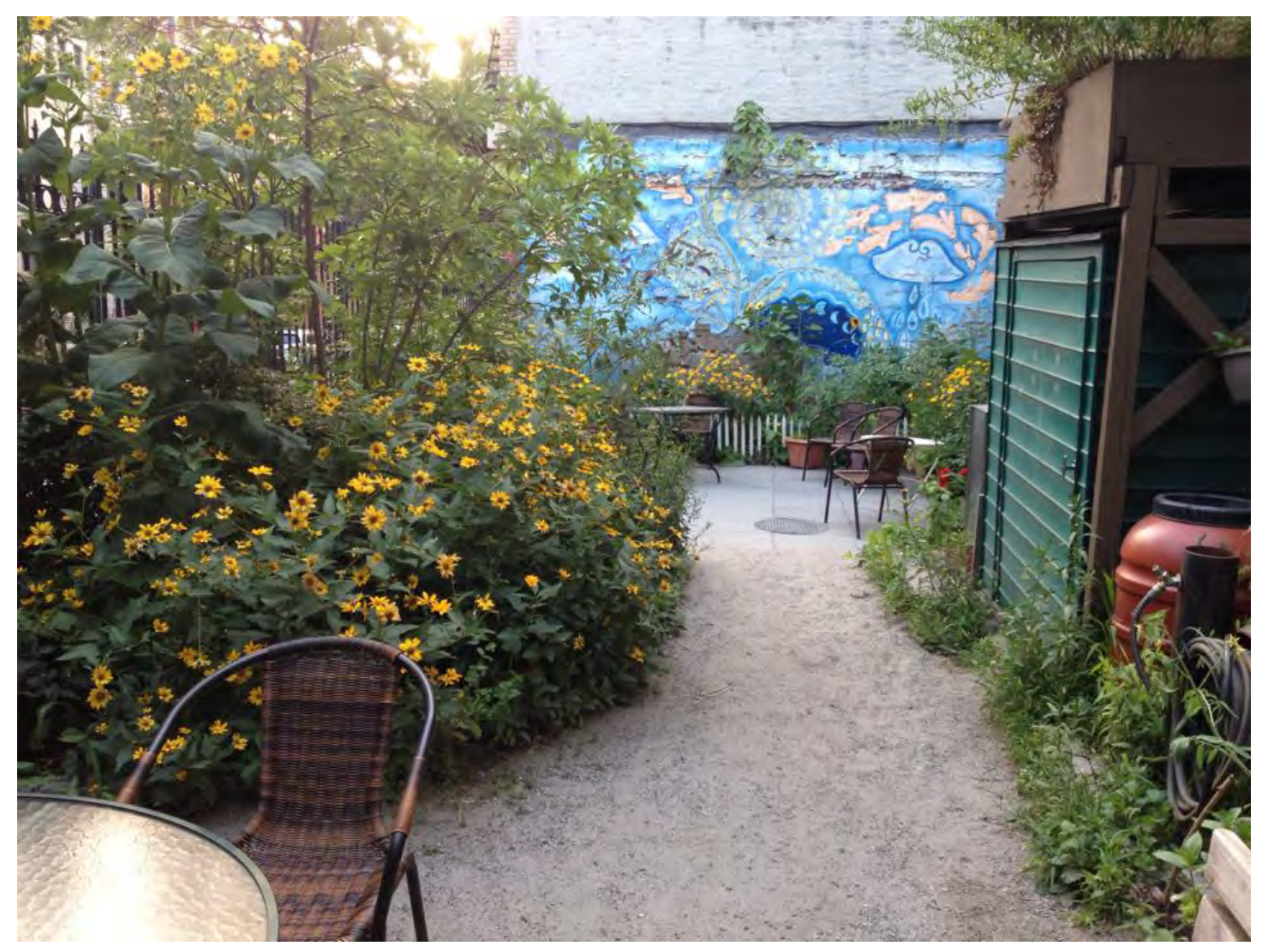
GREENSPACE @ PRESIDENT STREET, BROOKLYN, NYC