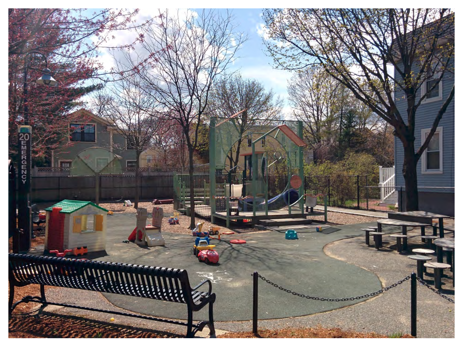
LOPEZ STREET PARK, CAMBRIDGE