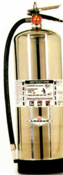
2 1/2 Gallon Water Extinguisher