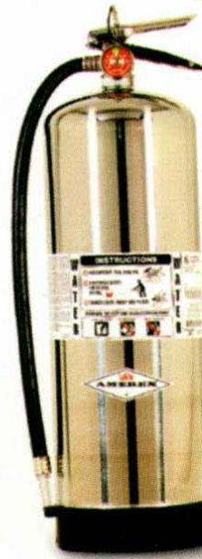
2 1/2 Gallon Water Extinguisher