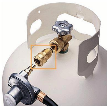
QUICK RELEASE VALVE