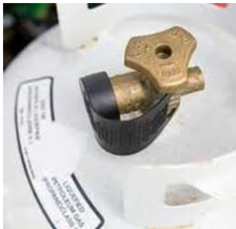
New Over Pressure Device (OPD)