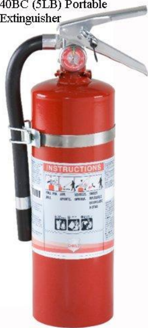
40BC (5LB) Portable Extinguisher