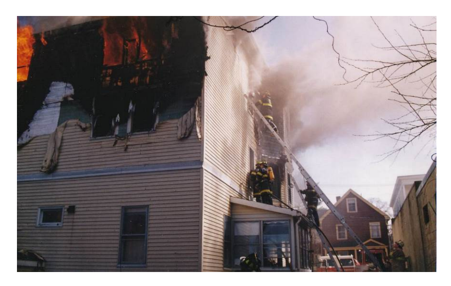
3 Story wood-frame fire is at Walden Street near Sherman Street, 3 alarms - unknown date