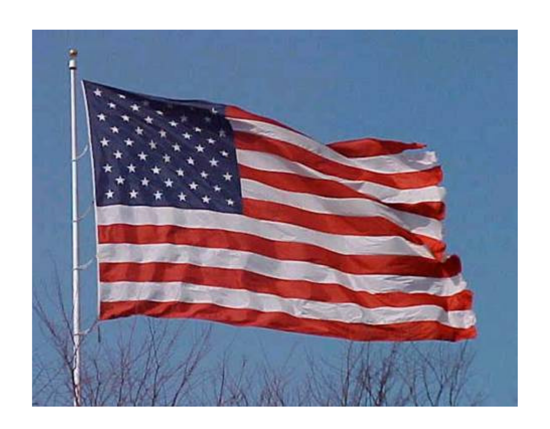
Brothers and Sisters, STAY BRAVE! STAY VIGILANT! STAY SAFE!